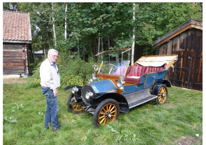
I had to have a look at the car.