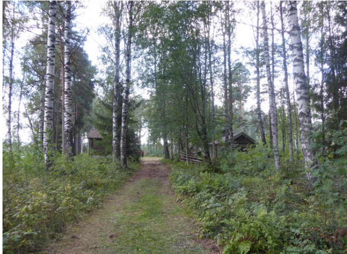
The road to the tenant's place.