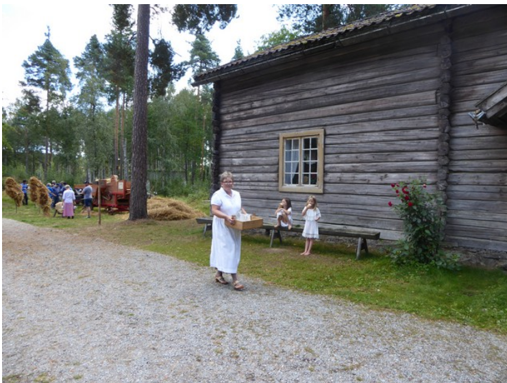
Those who worked here had contemporary old outfits.