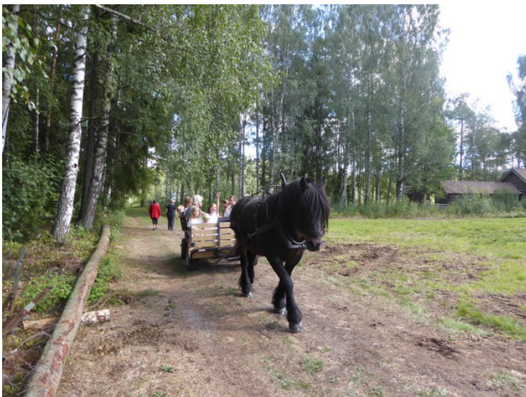
The horse was alking all the time.