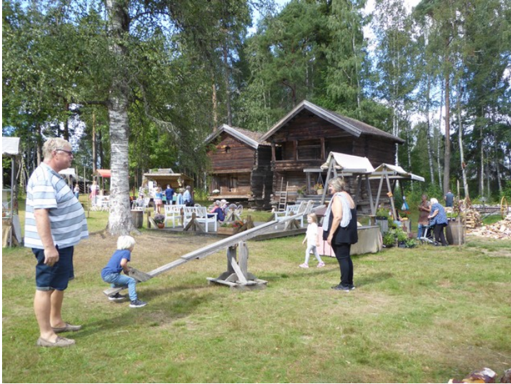
There were play equipment for the kids.