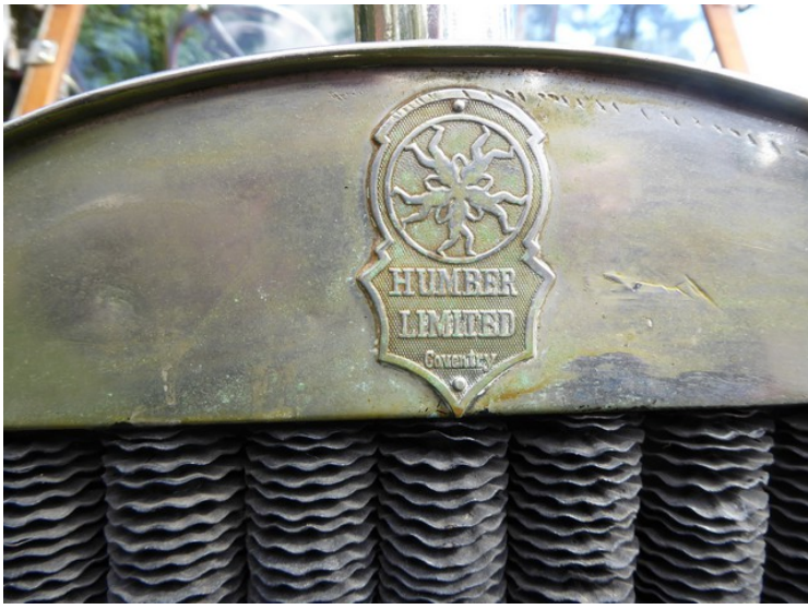
It was a Humber.