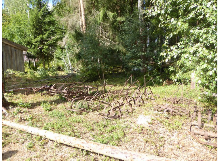
Old harrows and ploughs.