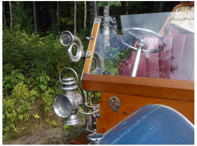
It is from about 1910.