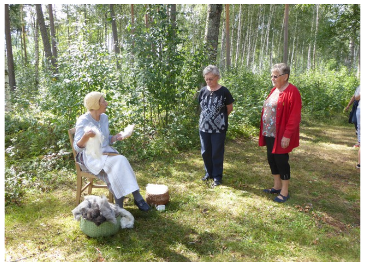
Carding of wool.