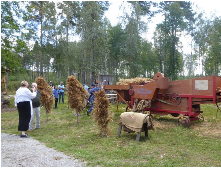
The threshing machine.