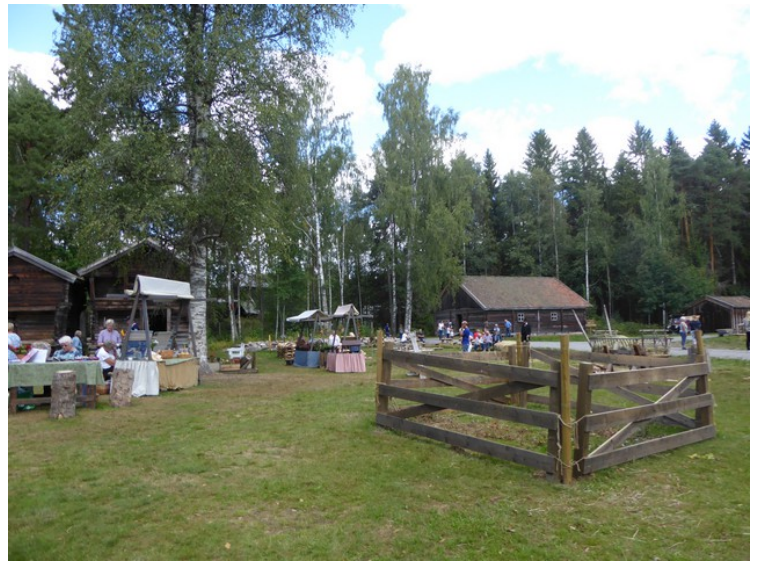
Farmen 2018 has marketplace here. Farmen 2018 is recorded at Gjedtjernet farm in Grue. The house to the left is a house from approx. 1800 with gallery. It is protected.