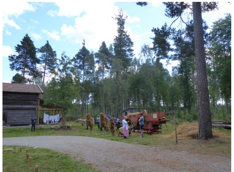
A mobile threshing machine.