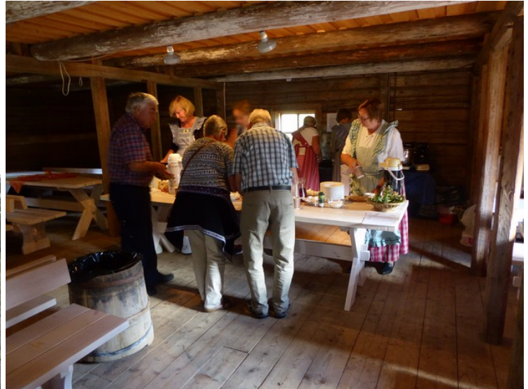
Then it was time for coffee, waffles and jam.