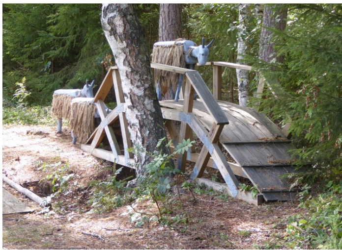
Three Billy Goats Gruff.