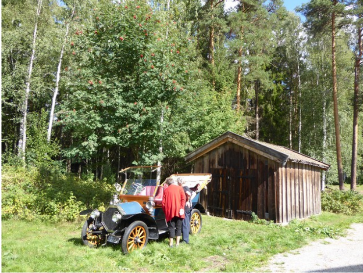
There was an old car here.