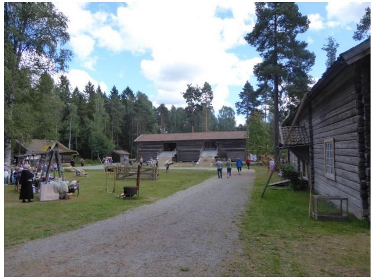
There were a lot of people in the area.