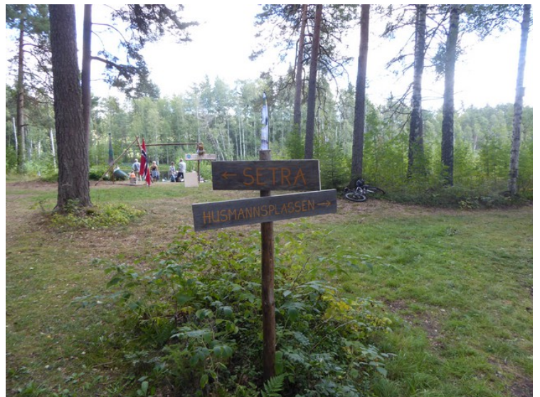
A sign that shows the way to the tenants place and to the shieling.