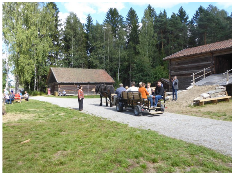
The horse went all day It was a popular activity.