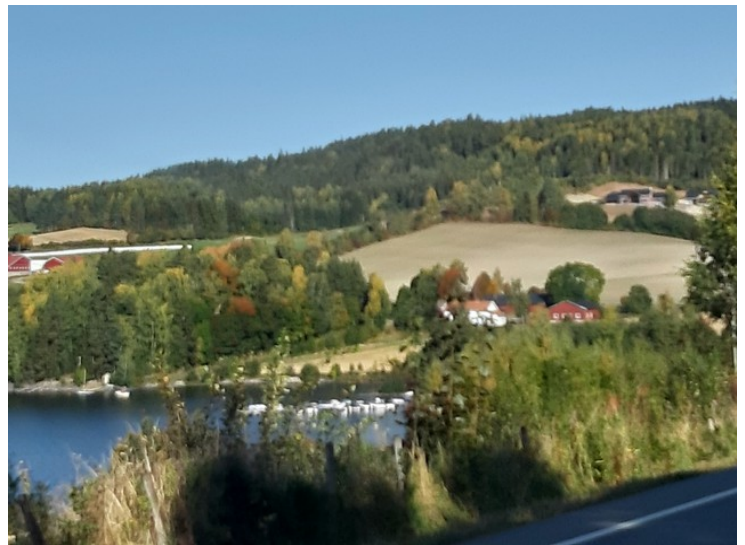
Here we come to Sløvika. The place is best known for the campsite, Sløvika Camping .