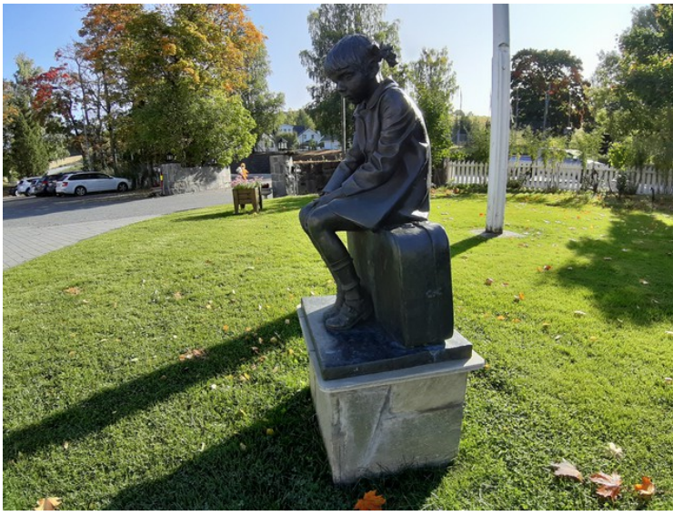
The hotel has invested in various art both indoors and outdoors.