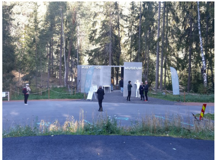
Here is the entrance to the museum. We did not have time to go in, because we had agreed on another visit that day.