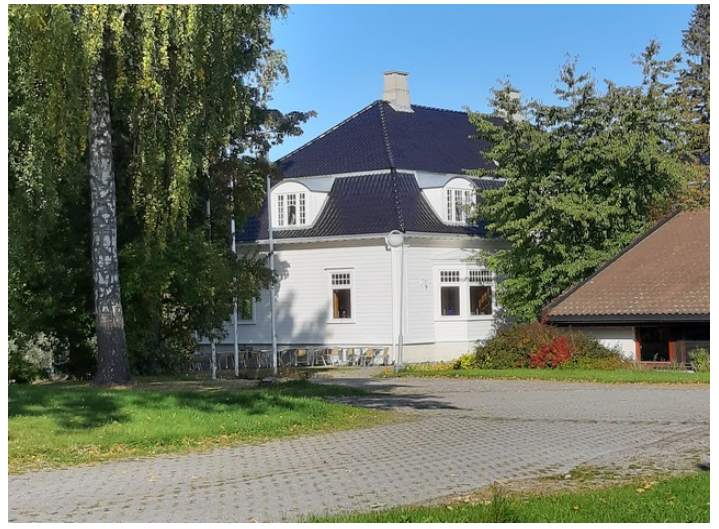
We also drove by Torbjørnrud Hotell in Jevnaker to see what it looked like there. It is idyllically located right by the Randsfjorden .