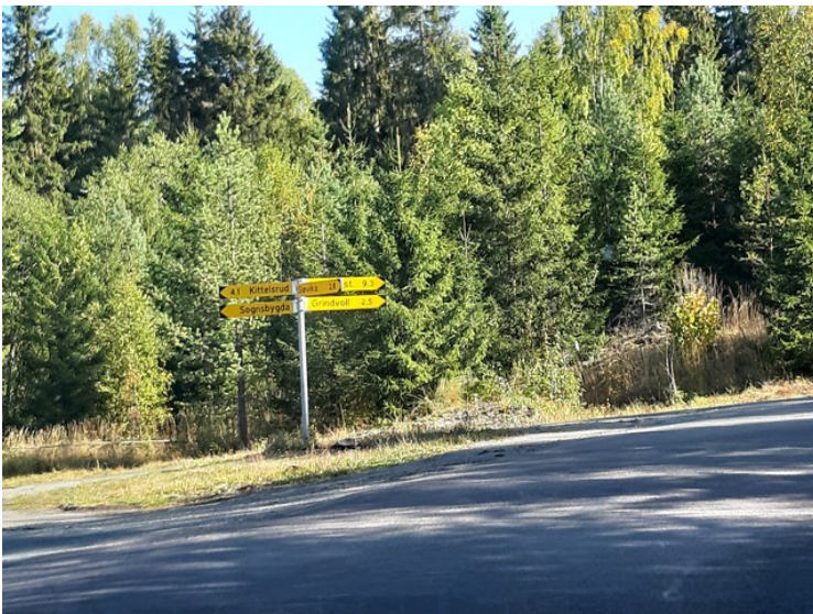
Here is a sign to Grindvoll .