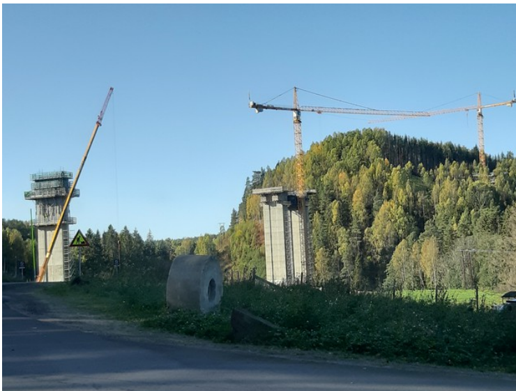
Then we drove down to Kistefos Museum . We drove past bridge foundations for the new E16 that will go from Hønefoss to Lunner .