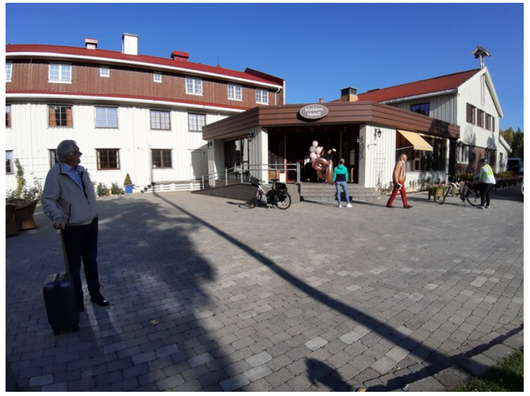
Here I am outside the hotel entrance when we are going to leave.