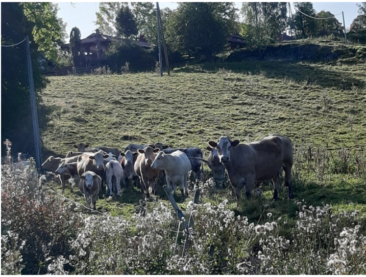
On the way up to the main road we passed another herd of cows.