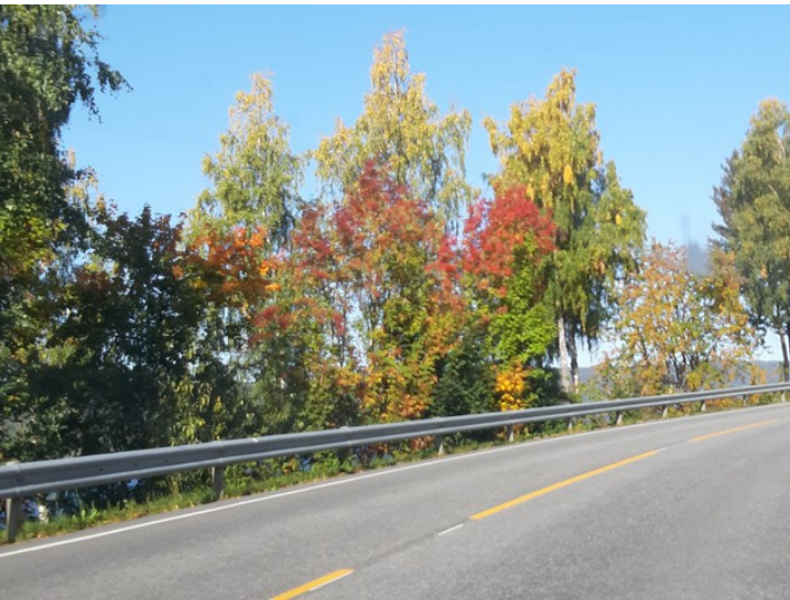
Many trees had acquired strong autumn colors.