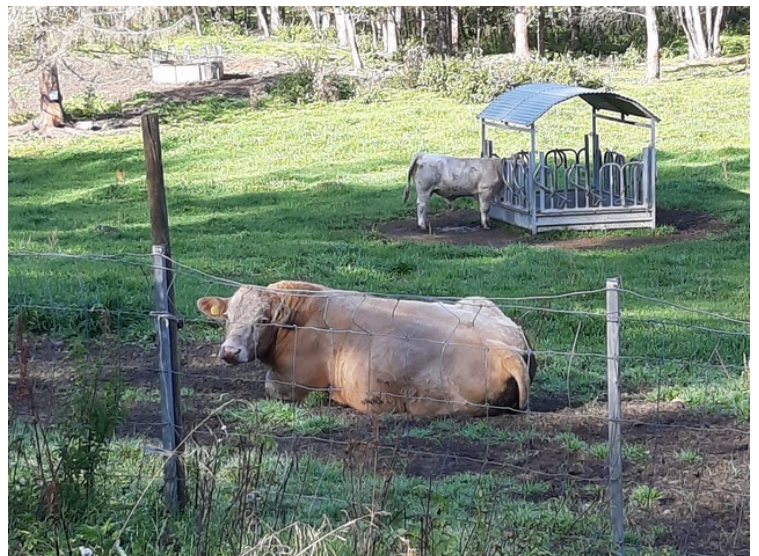
At the parking lot of the museum was a herd of cattle.