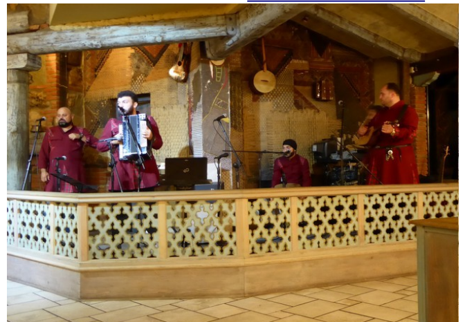
The musicians are in place.