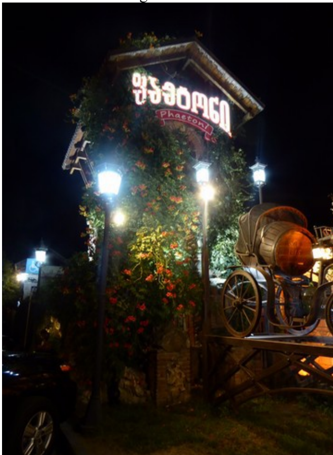
The sign at the entrance.