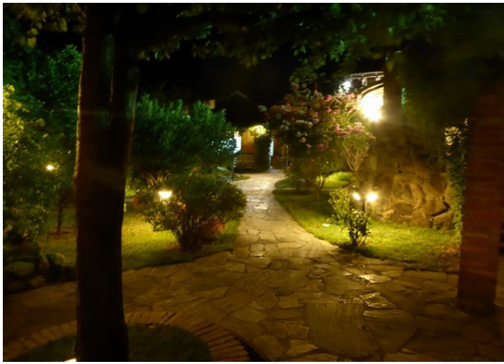
Then the performance were over, and we're going back to the hotel.