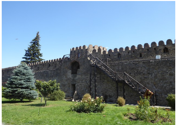
There are more than me taking pictures.