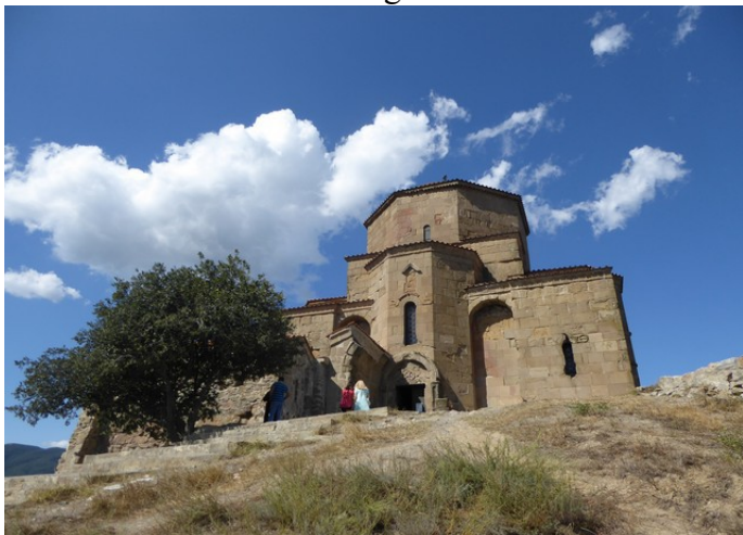
The church is called Jvari . The first church was built in 545, while this church that stands here now was built in 590-605.