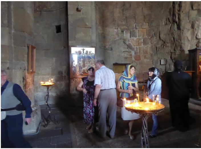
Inside the church.