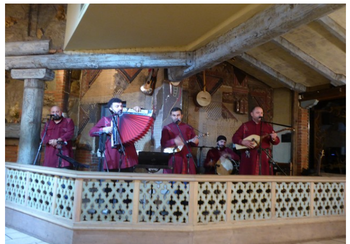
Link1 Link2 Link3 Link4 Link5 Link6 Link7 Link8