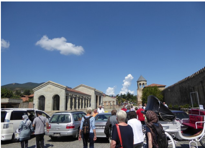
Heavy traffic on the streets outside.