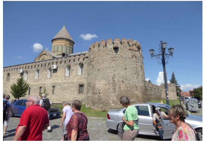
Here we made a stop in Mtskheta to watch the Svetitskhoveli Cathedral .