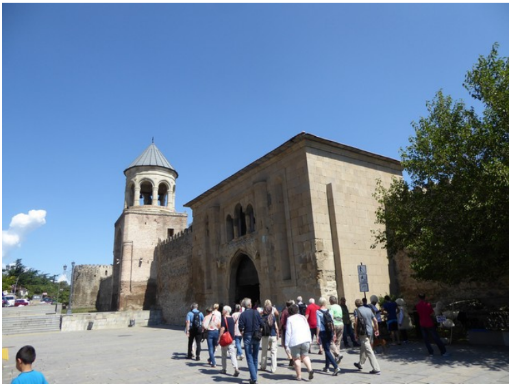
Here we will within the walls.