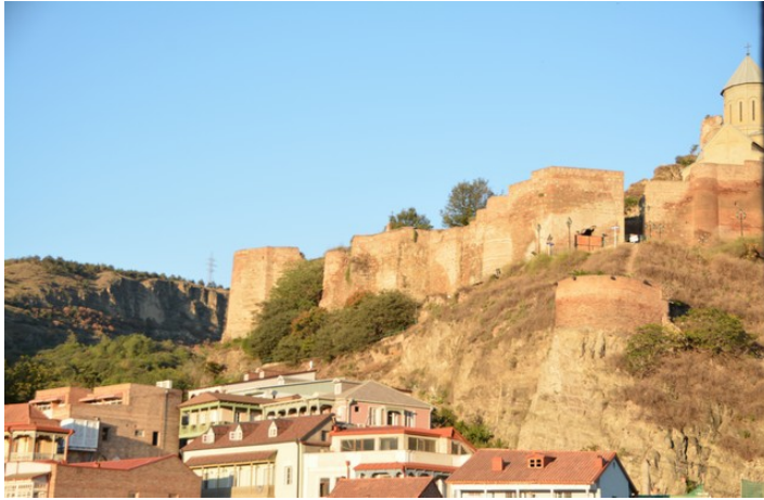
Then it was back to Tbilisi. Fortress walls.