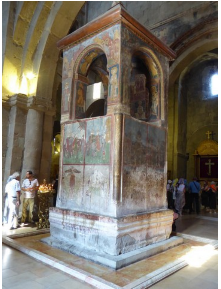
Jesus' robe should have been buried under this monument.