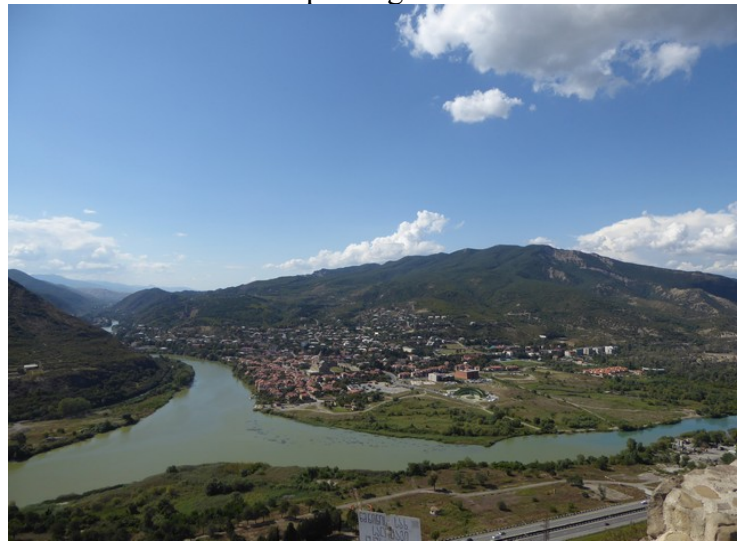
There were good views back towards Mtskheta here.