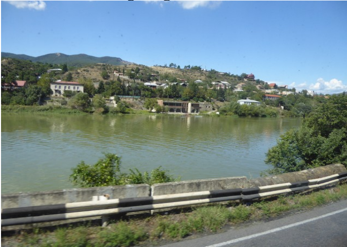
We drive first along the Kura River.