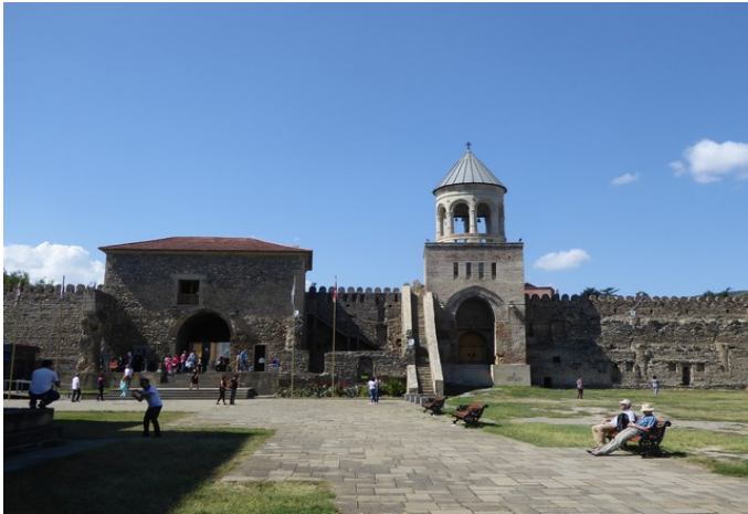
Here we are inside and looking towards the gate where we entered.