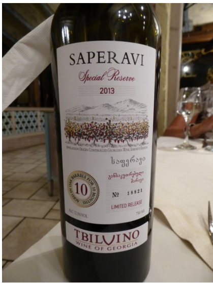
We ordered Georgian wine to the food.