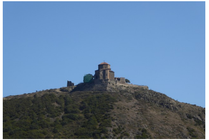
This church is located high above the city. We were going up there after we had been in Mtskheta.