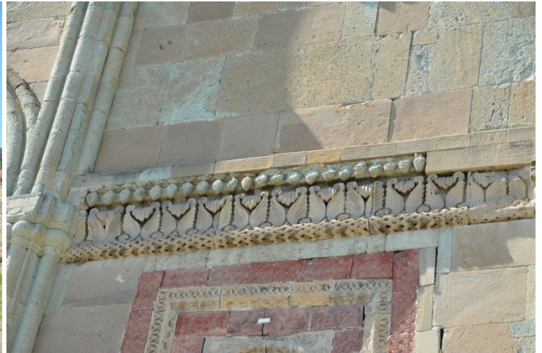
Then some details from the church wall.