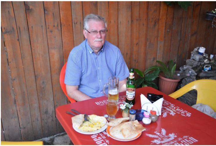
We got a good omelet.