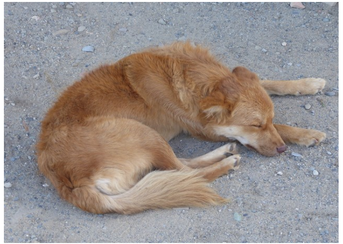
This must be church dog.