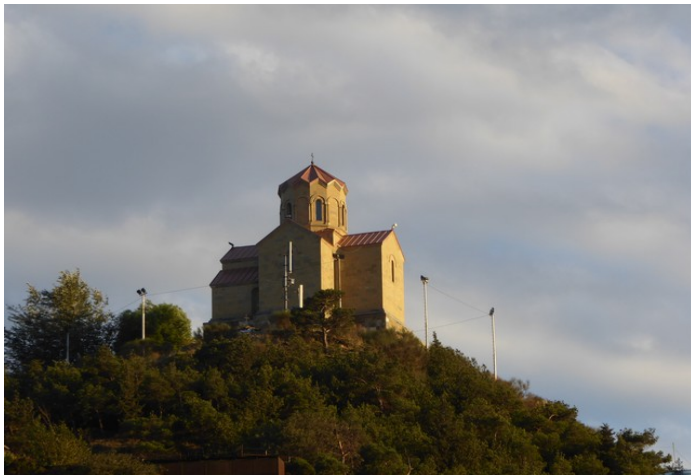
From the hotel we could see up to a monastery called Tabor Monastery .