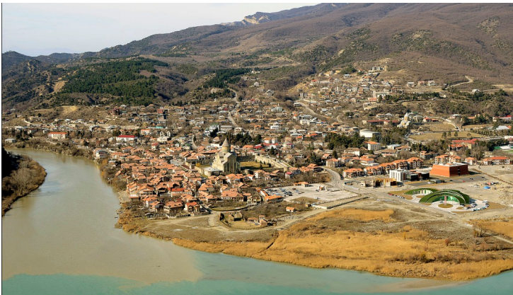
Mtskheta lies where the rivers Aragvi and Kura meet. It was the capital before Tbilisi was.