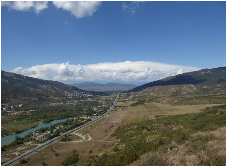
Views south towards Tbilisi.