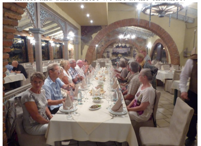
At the table.