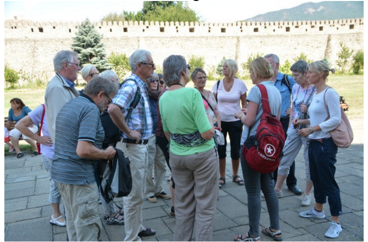
At the back of the church.