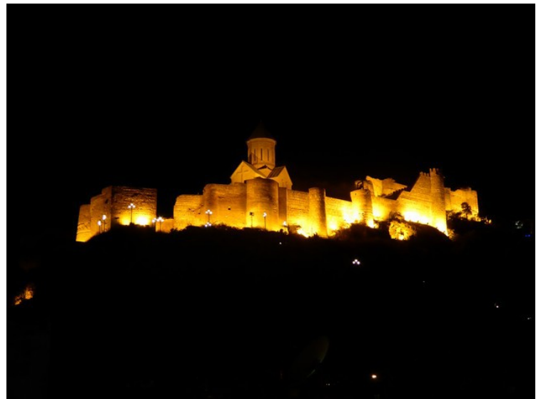
The fortress with evening lighting.