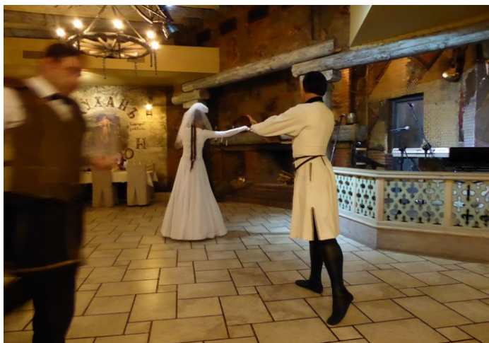
Then came the dancers.