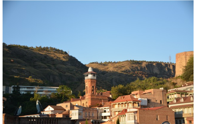
We can also see the Tbilisi Mosque in the middle of the picture.