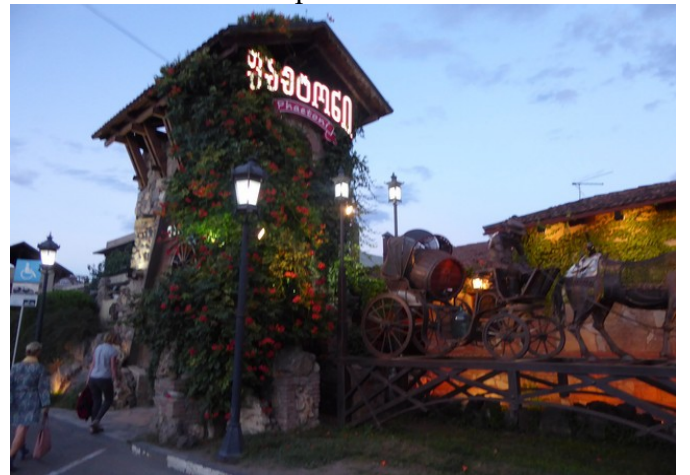
In the evening we were on Georgian Eve with Georgian music and dance. Here we are at the entrance.