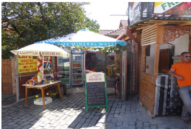
After we were in the church, we ate a light lunch at this cafe. It was a private house. The cooking in the kitchen. We used their private toilet.