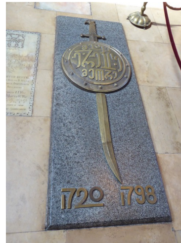
The burial place of Erekle II