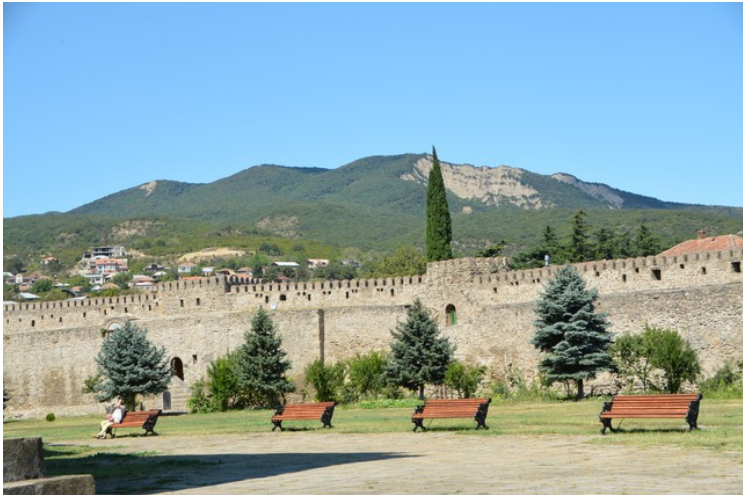
The walls from the inside.