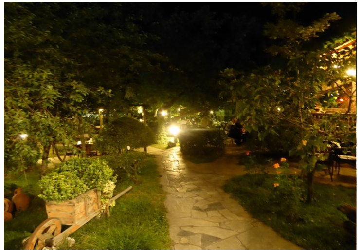
The exit is through the garden.