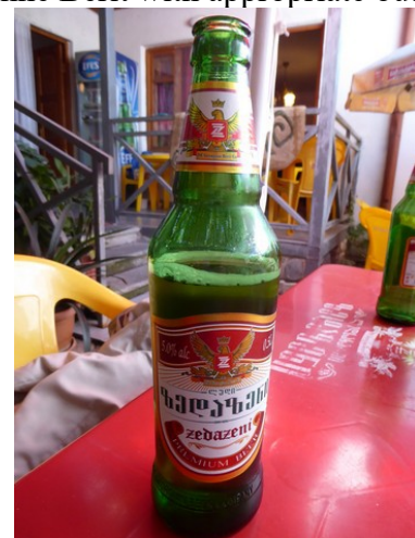
I bought this beer.