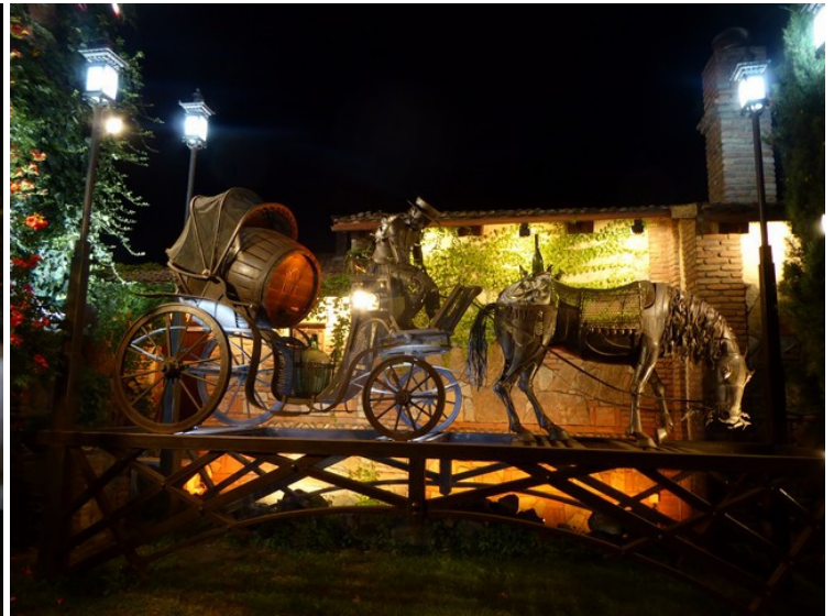
This vehicle is outside the entrance.