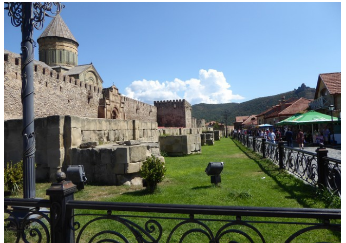
This is outside the walls of the church.