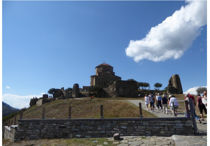
Here we are in the parking lot below the church.