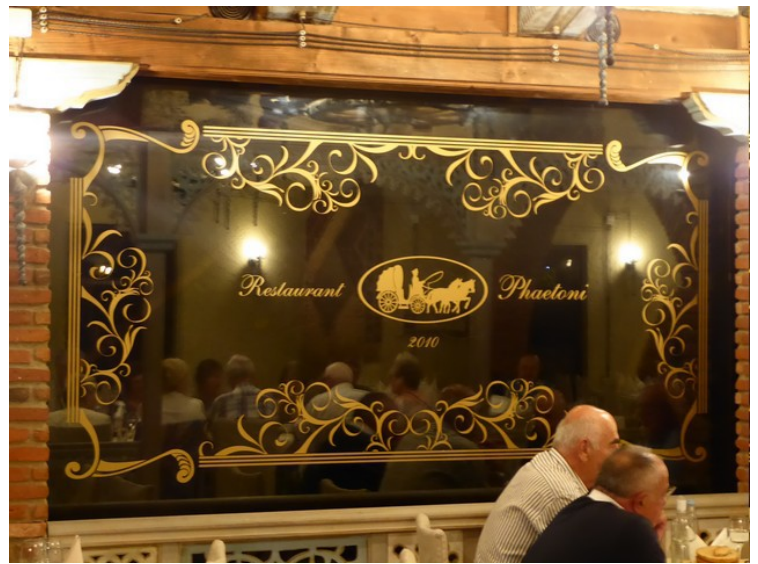
The restaurant is called Restaurant Phaetoni .