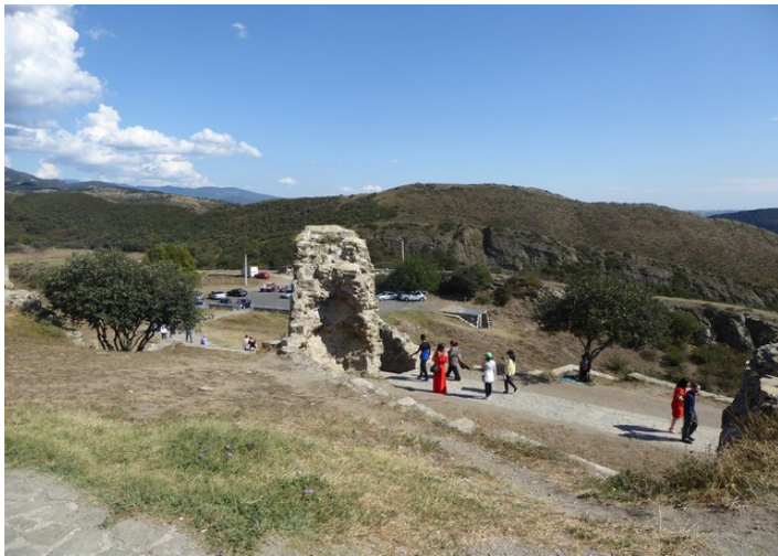
Ruins below the church.