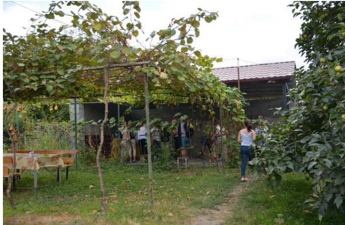
Here we are in the garden of those who we were going to eat at.