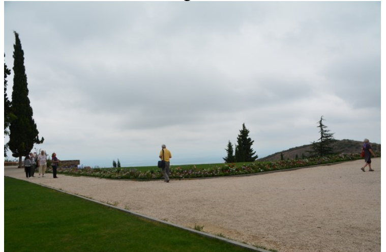
Some of the plantings.