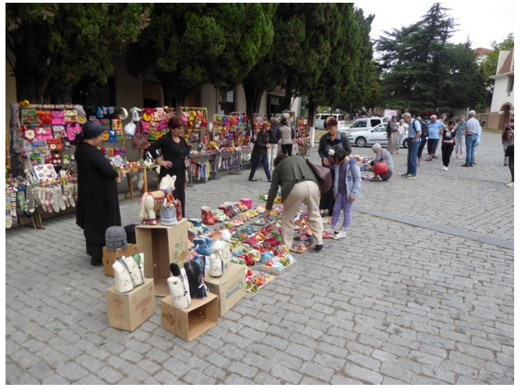
On the square items are put up for sale to tourists.