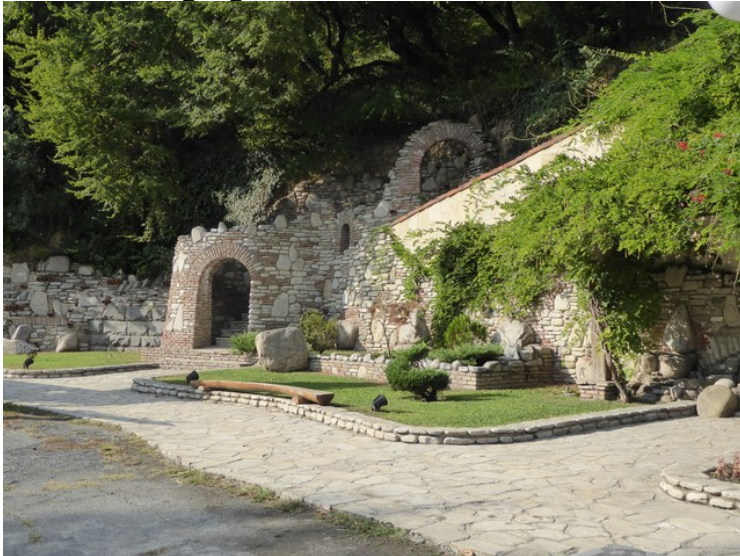
Outside the winery there are nice plantings.