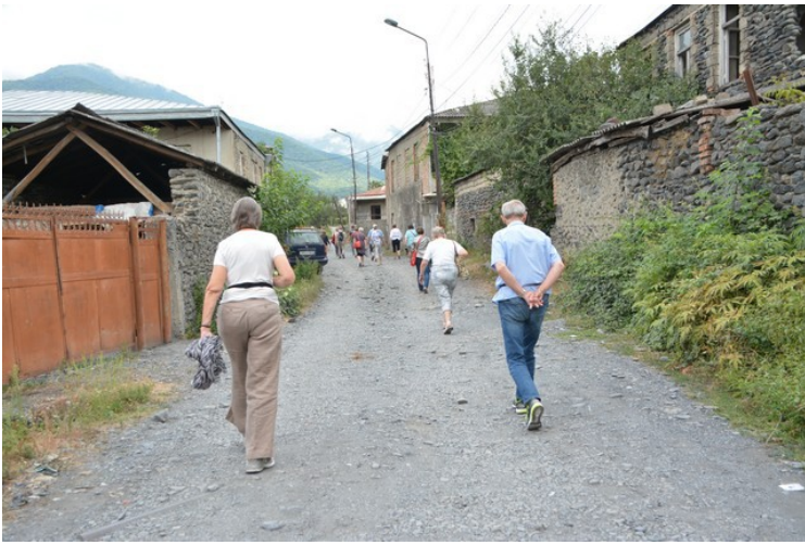
Next stop was for lunch with a family who invested in tourism.