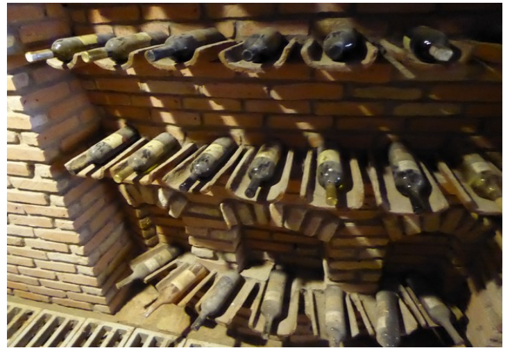
Someone with a lot of dust on.