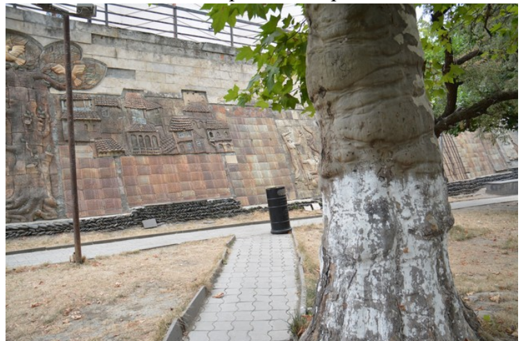
A wall with reliefs on.