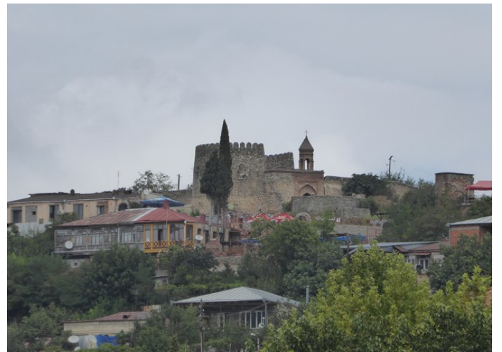
View up towards the town from the parking lot. We see some of the city wall from here.