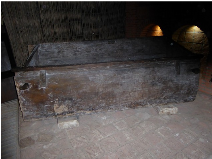
Various tanks that have been used at one time.