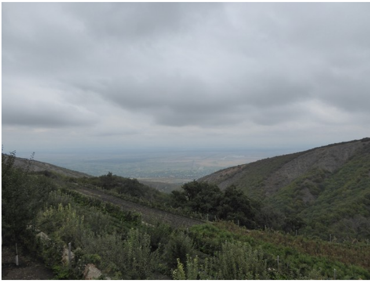
View from the monastery.