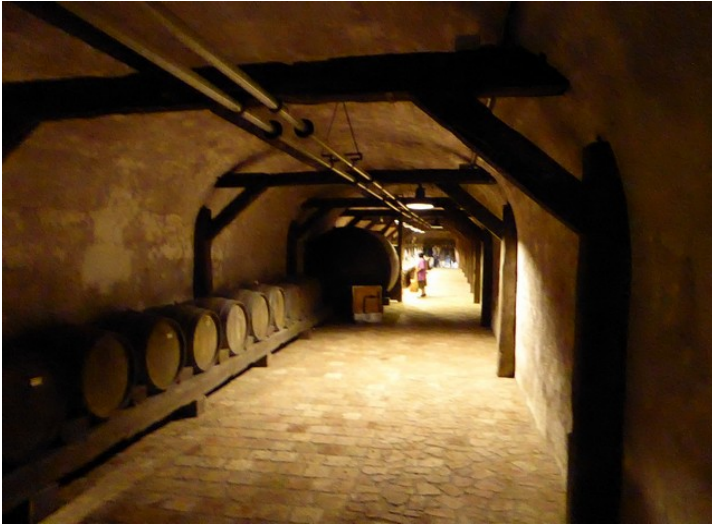
It is 7 km of tunnels, carved into the mountain.