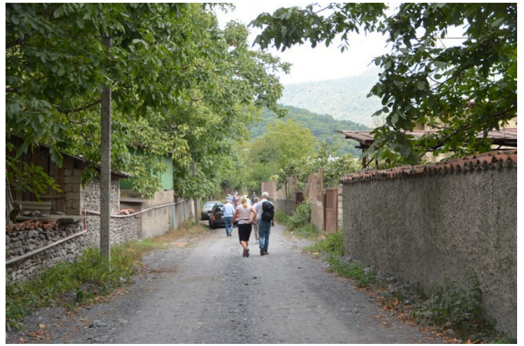
There was roadwork on the road that led up to the place, so we had to walk the last stretch.