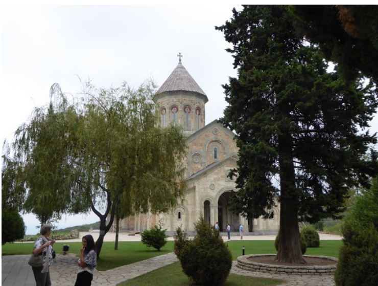
The church was built in 1100-1200's.

We made the first stop by Bodbe Monastery , 2km from Signaghi. The monastery was built where St. Nino was buried in the year 338-340. There is now a nunnery. St. Nino was a woman who preached Christianity in the early 300s, and contributed to that the Christianity became the state religion.