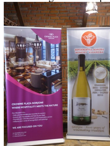
They also have a restaurant here.