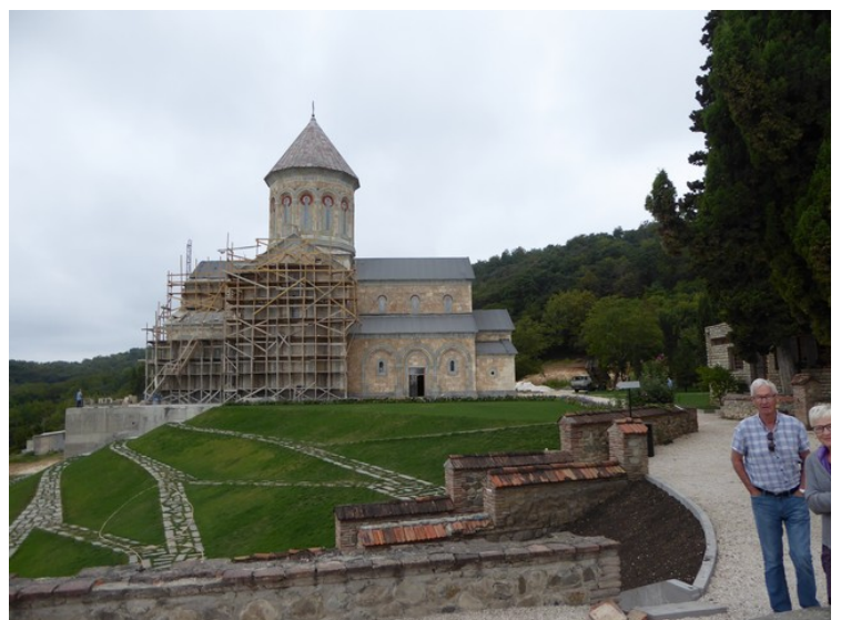
There is created a park around the monastery and church.