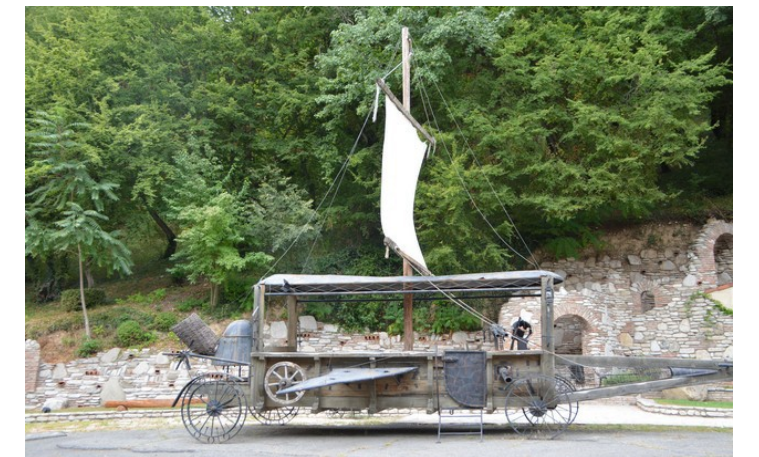
Next stop was the wine tasting at a winery. Original wagon.