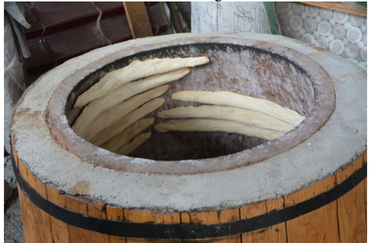
Bread making was done in the traditional way.