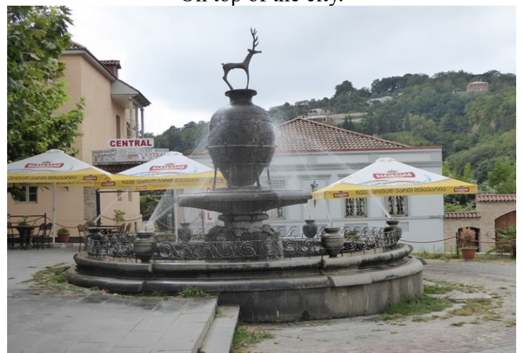
A fountain further down.