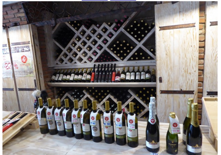
Here are the goods on display.