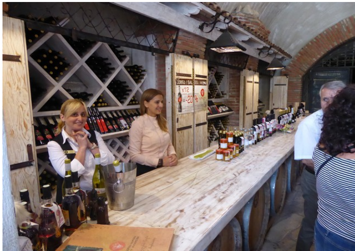
Here it was also possible to buy wine.