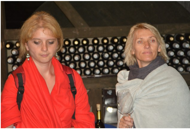
Georgia guide and Guide for Norsk Tur.