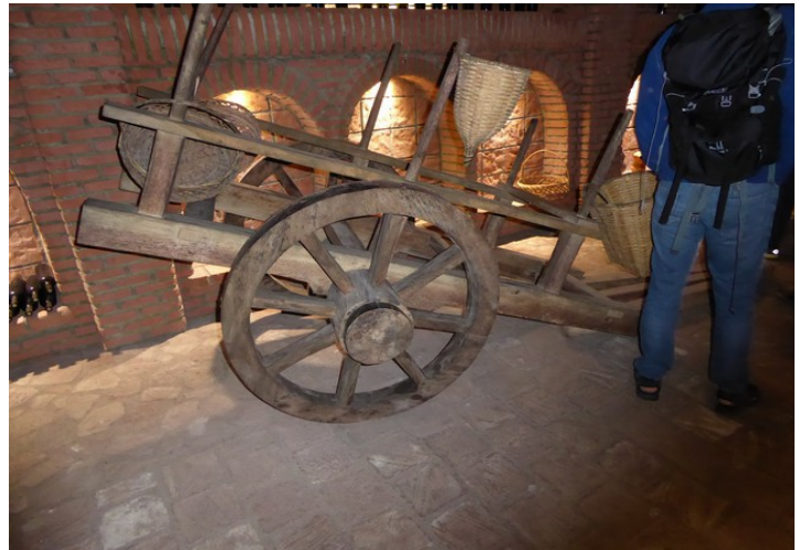
Carriage to transport wine barrels.