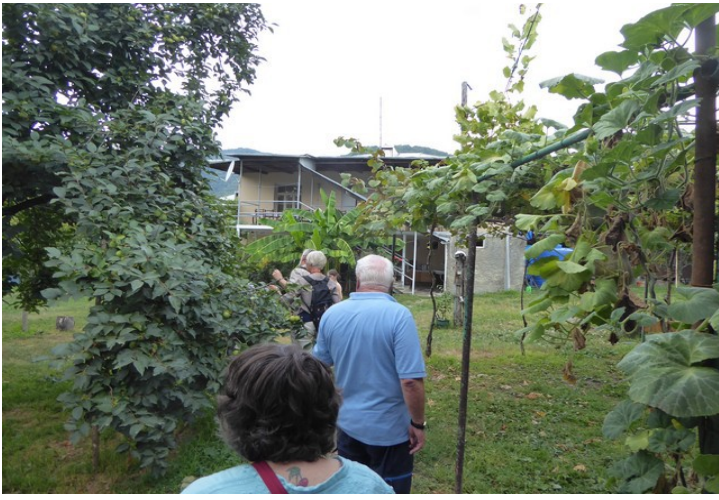
Various trees in the garden.