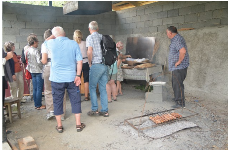
First it was baking bread.