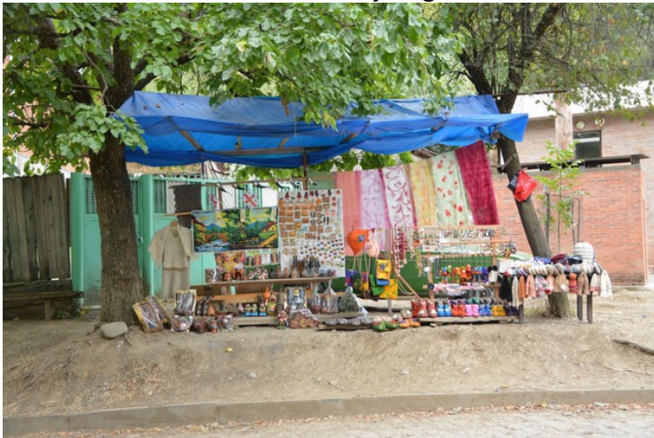
A small souvenir shop.