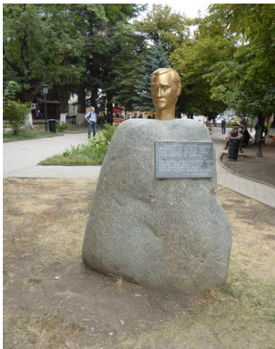
Here is a statue.