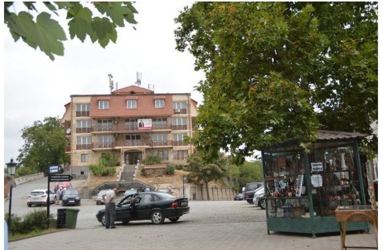
On top of the city.