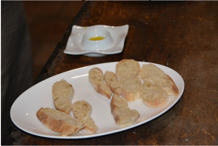
Bread and olive oil.