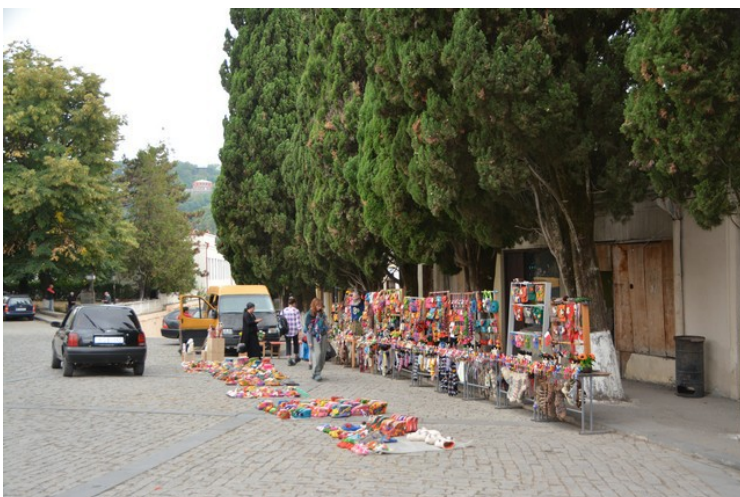
On the way down again.