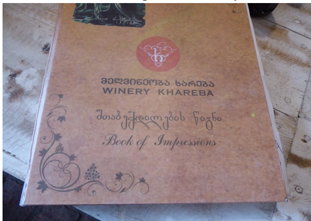
The winery is called Winery Khareba . Link . They own 100 Ha of vineyards.