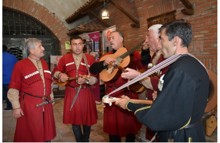
Within the entrance stood musicians and played.