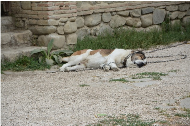
The monastery dog.