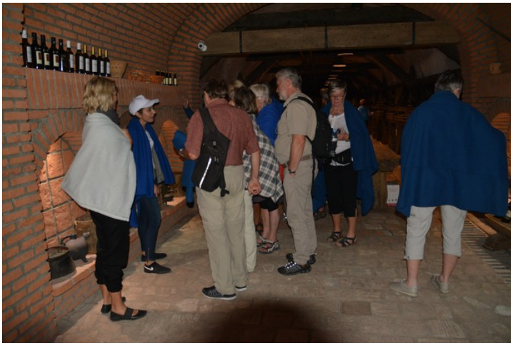
The winery's guide tells about the production.