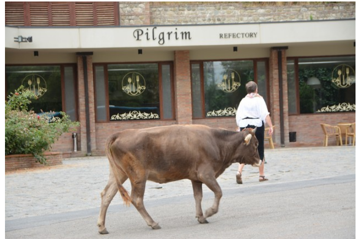
Outside the monastery walls the cows goes on the road.