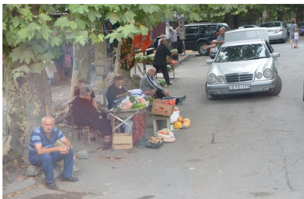
It was common that people stand along the road to sell their products.