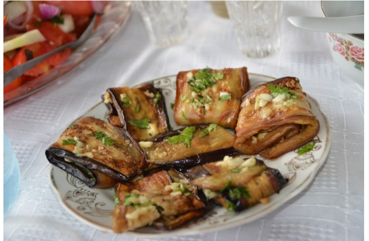
We were served a variety of food.