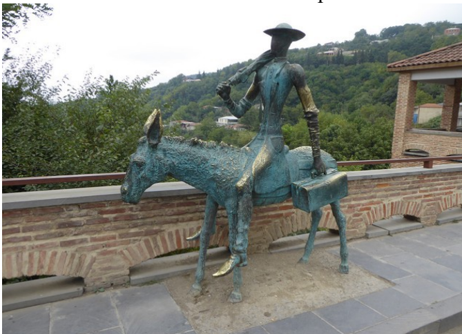
Next stop was in Sighnaki , which is a small town 2km from the monastery. Link . The city was an important fortress in the 1700s with the wall around the entire city.