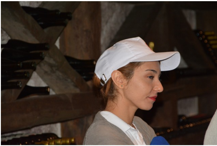
The guide at the winery.