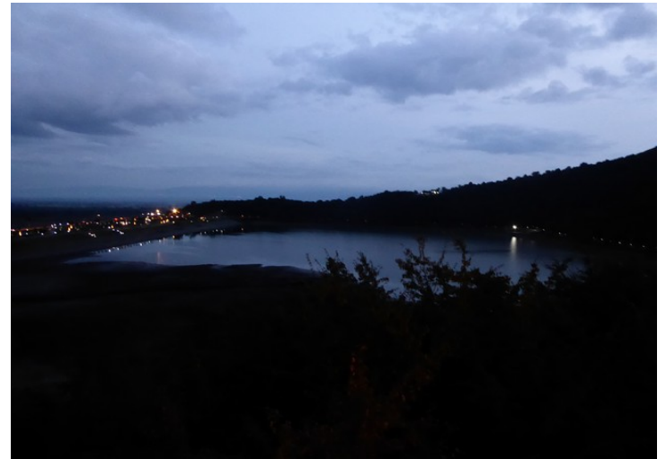
The view from the terrace of the hotel in the evening. We see lights from Kvareli at the left in the image.