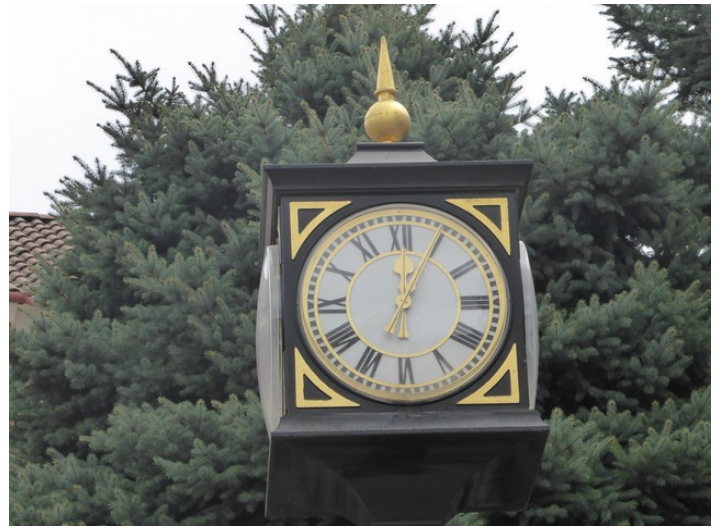
A nice clock next to the fountain.