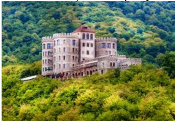
In Kvareli we should stay at Hotel Royal Batoni , opposite a dammed lake outside the city itself.