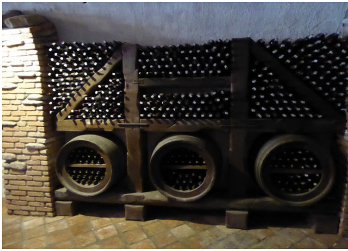
Bottles for storage.