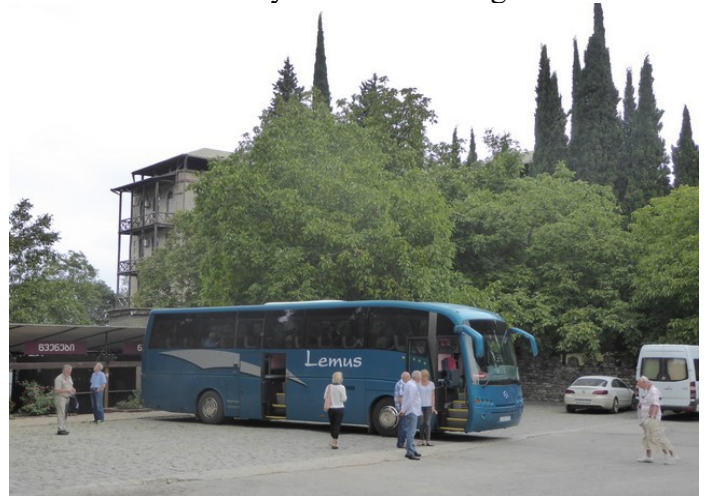
Then we continued driving with the bus.