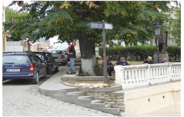
Farther up there is a park.