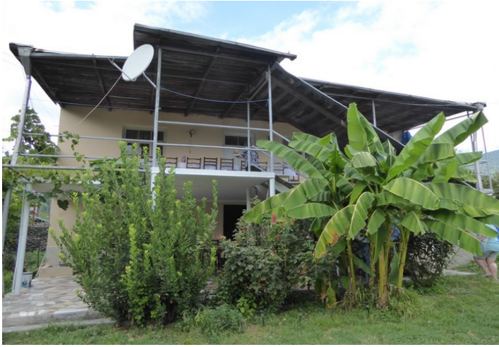
We were going to sit up on this porch.