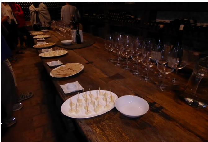
Then the wine tasting.