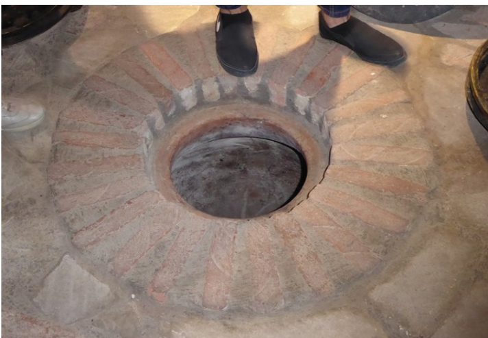
An amphora which is dug into the ground.