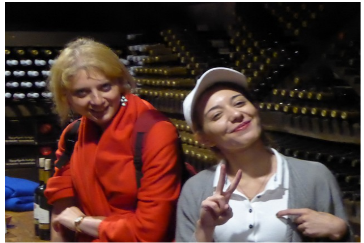
Georgia guide and the winery guide.