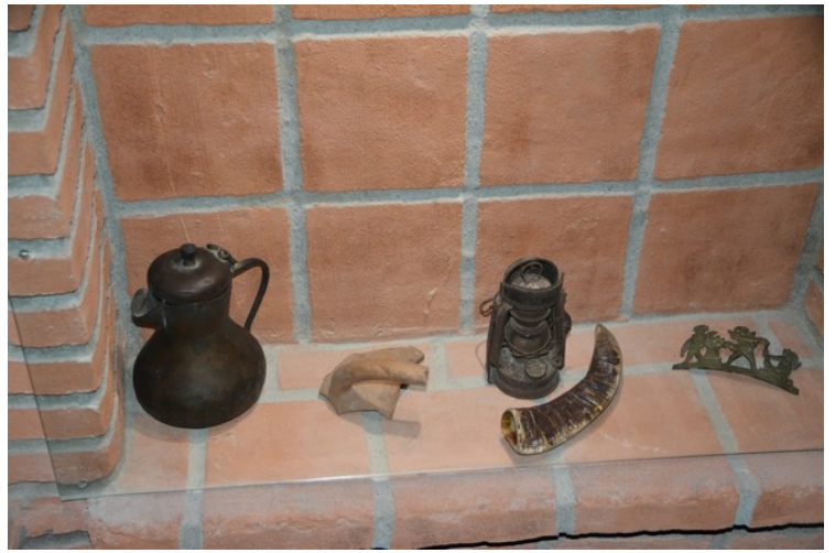
Various objects are exhibited.