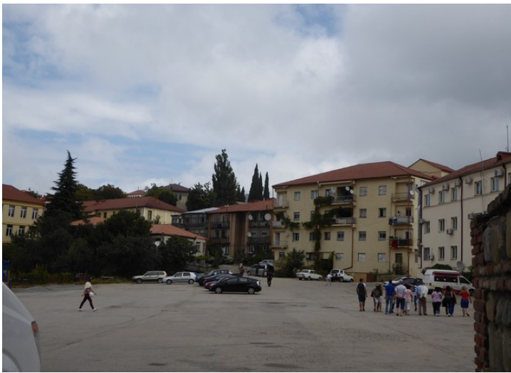
In the parking lot where the bus was.