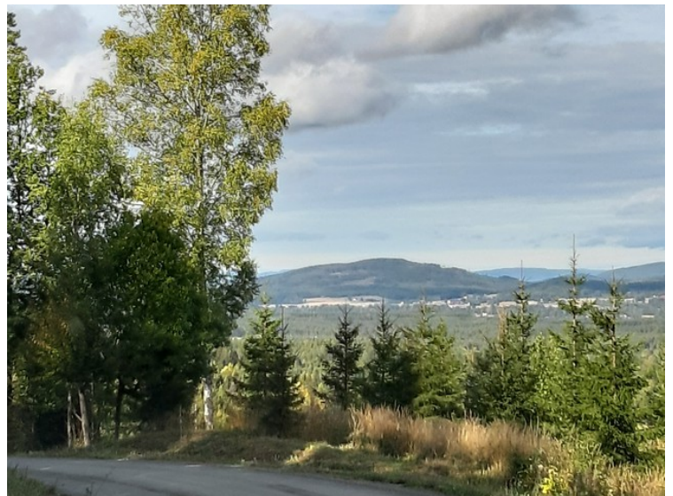
Some pictures of the view.