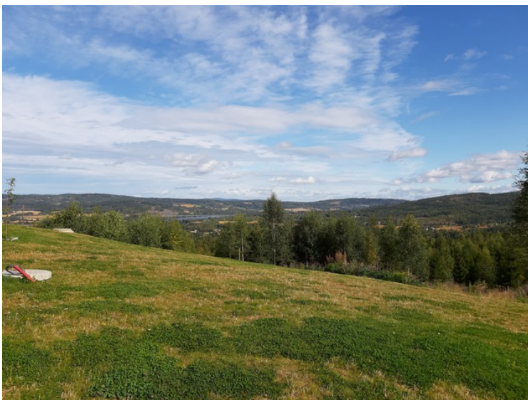
We took a picture of the view.