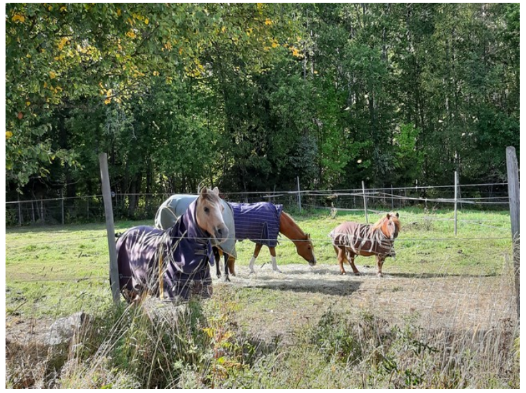
When we came down to Heibergvegen we drove further up. Some horses were grassing here.