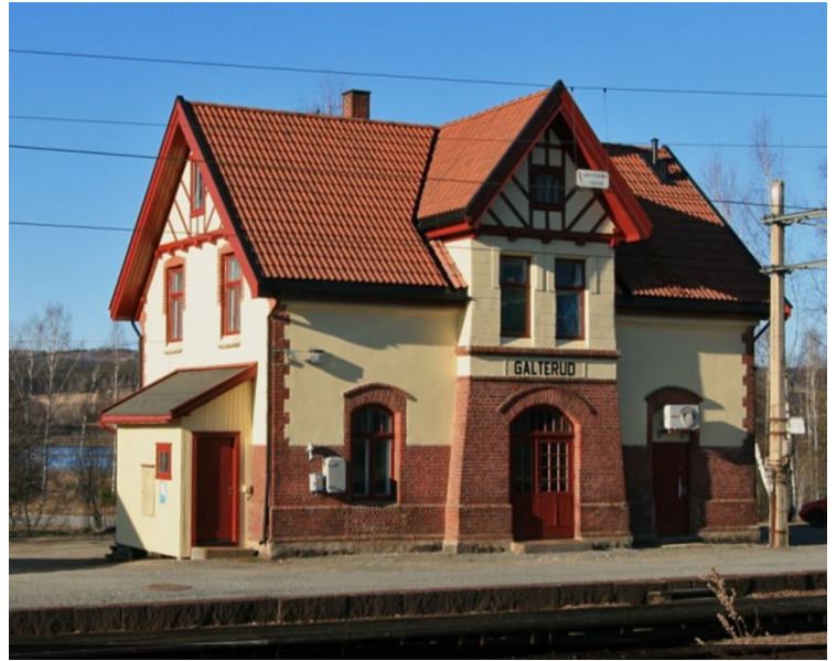
We drove by Galterud Station before going home.