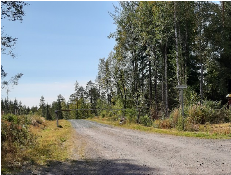
We drove up Heibergvegen until we were stopped by this barrier. Then we were up at 350 meters above sea level.