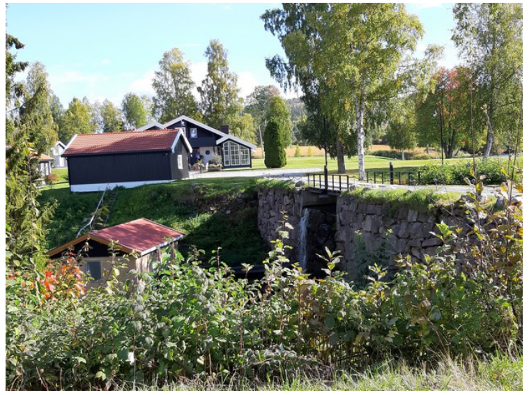
This is the dam.