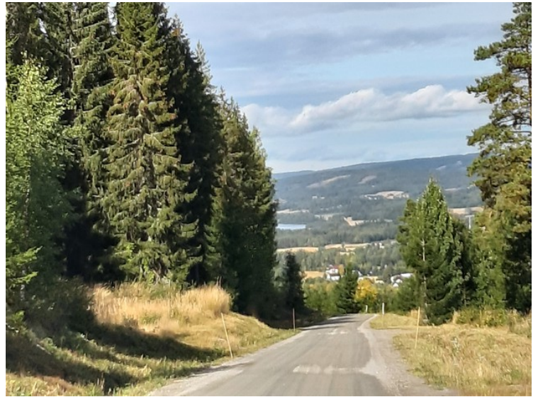
Here it went downwards again.