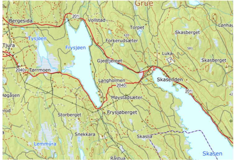
Map of Frysjøen and Tysjøen is copied from Norgeskart .