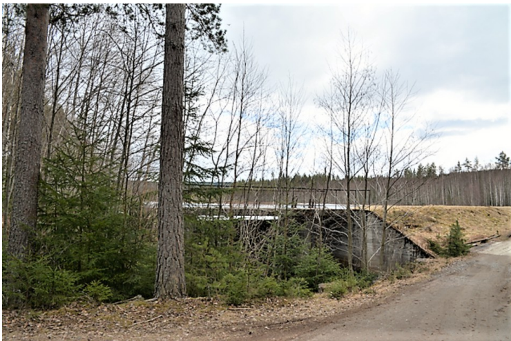
The dam with Frysjøen in the background.