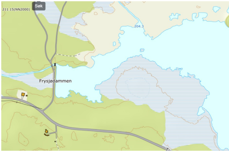
This is the western end of Frysjøen . There is a dam here, Frysjødammen. From here, Tysjøåa flows further west to Tysjøen.