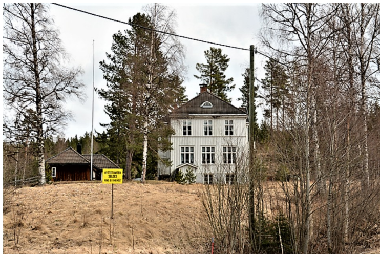
This is the school in Frysjøberget. It was closed down many years ago.