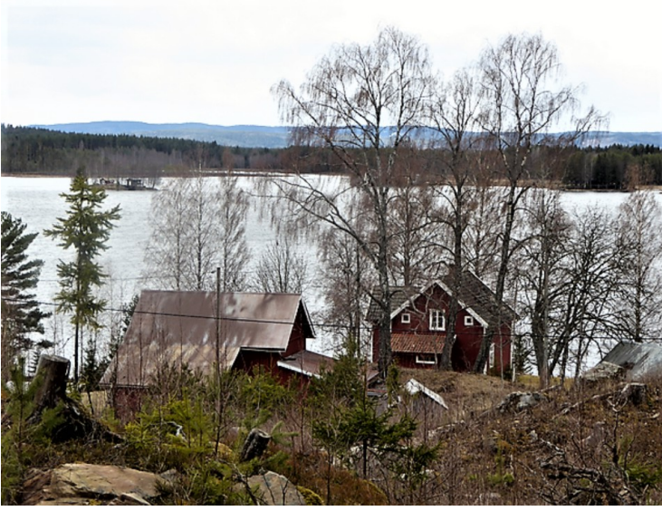
Here we look down on a small farm called Brauter. It was one of the filming locations in FARMEN 2018. It is located on the east side of Frysjøen.