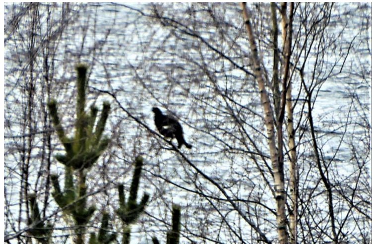
Here we saw a grouse. This is the first time I have seen a grouse. As we went closer to get a better picture, it flew.