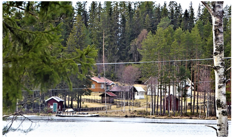
This is Gjedtjernet farm which was the main filming location of FARMEN 2018. It is located by a pond called Gjedtjernet.