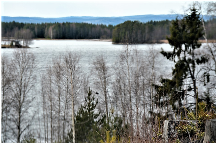
Here we have come a little further north. Mortholmen to the left in the picture.