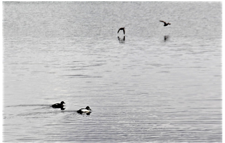
There are a few birds by the dam. We think it is goldeneye ducks .