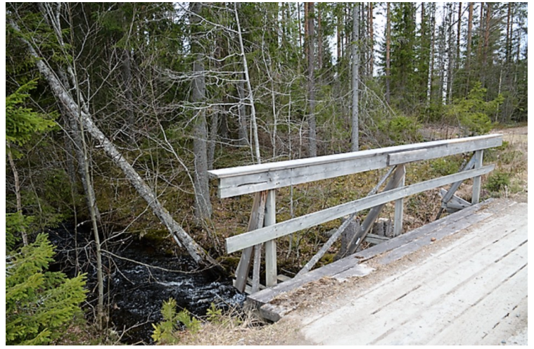
View down Tysjøåa.