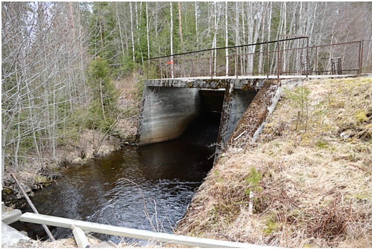
Here we see the dam from the bridge.