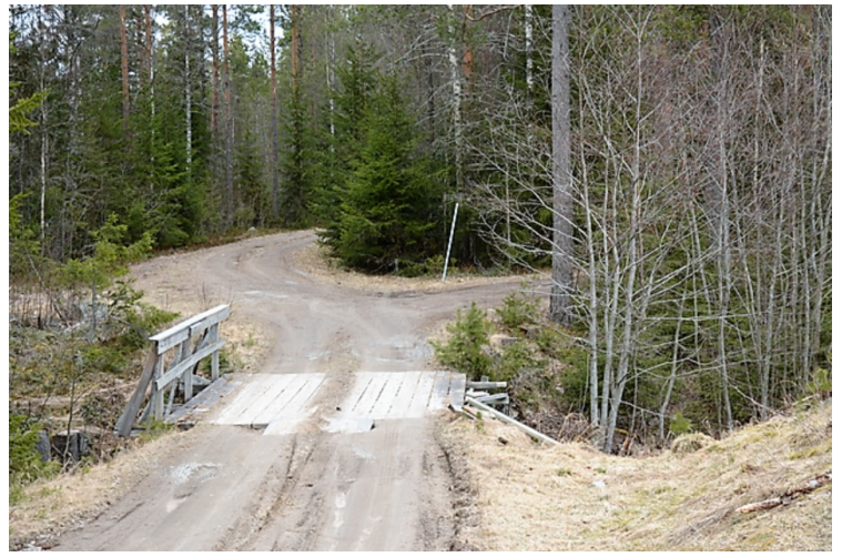
Just below the dam there is a bridge across the creek.