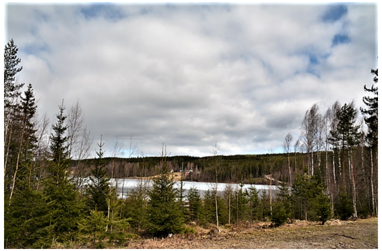
Another picture from the southern end of Frysjøen.