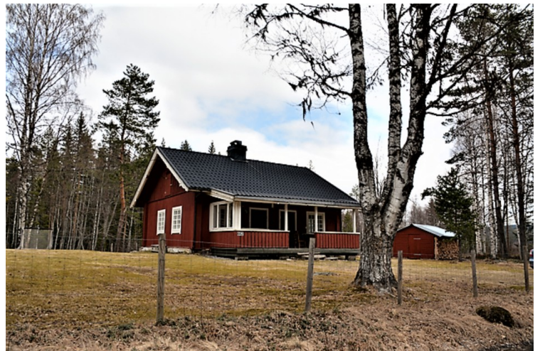
This house is located a short distance from the dam.