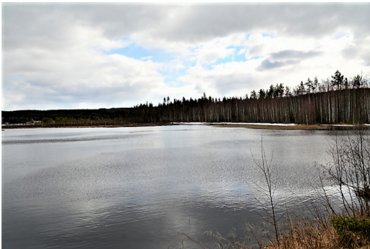
View southeast of Frysjøen.