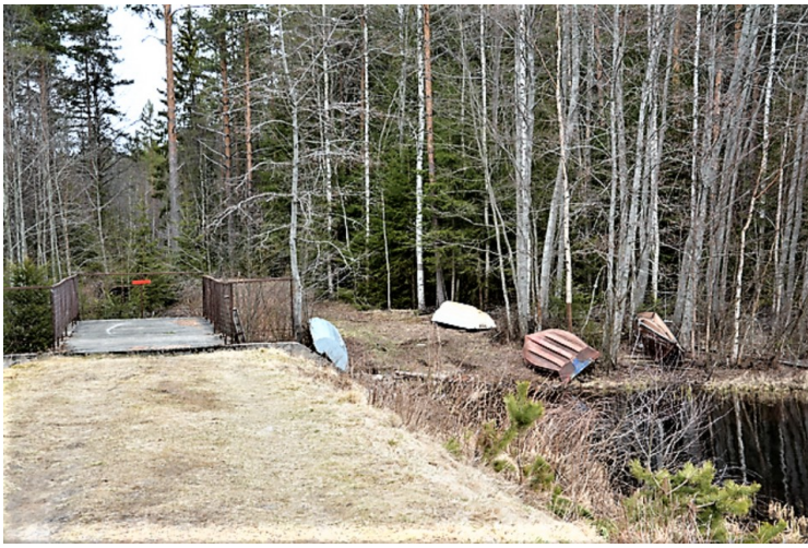
This is the dam.