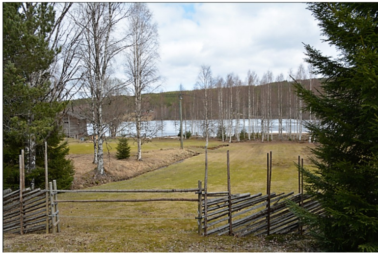
This is a view of Frysjøen from the southern end.