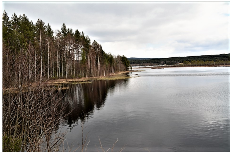
View northeast of Frysjøen.