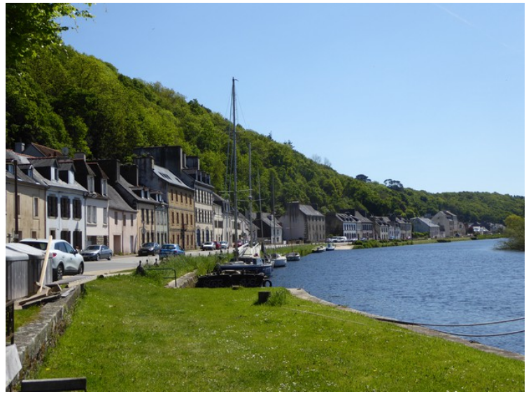
The river Aulne flows through the town. View up the river.