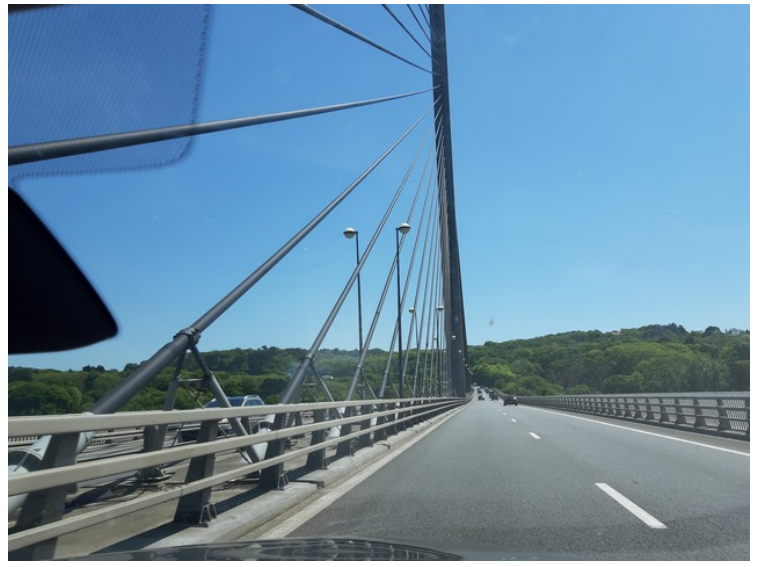
Just after Brest we cross the river Élorn