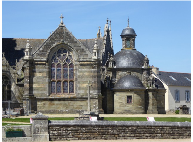
Special church, Paroisse de Pleyben Paroisse .