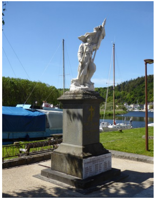
A war memorial.

We had a coffee break at a café in this town.