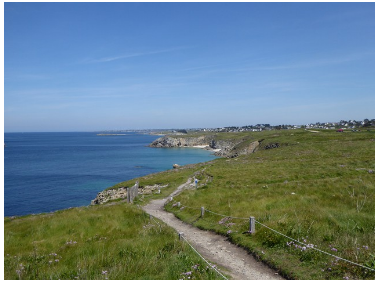
View north from the Corsen.