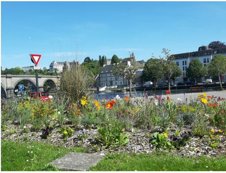
On the way further, we drove back to Port-Launay and further up the Aulne River. Here we are in Châteaulin .