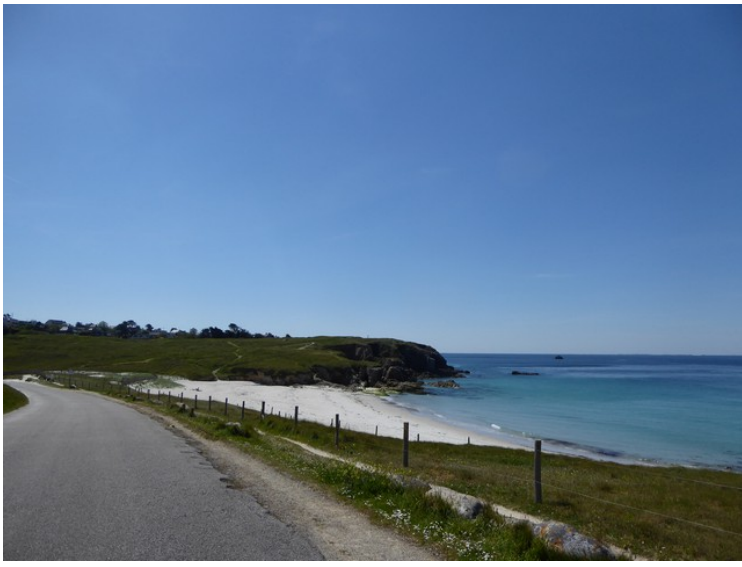
Here we look towards the westernmost point in France.