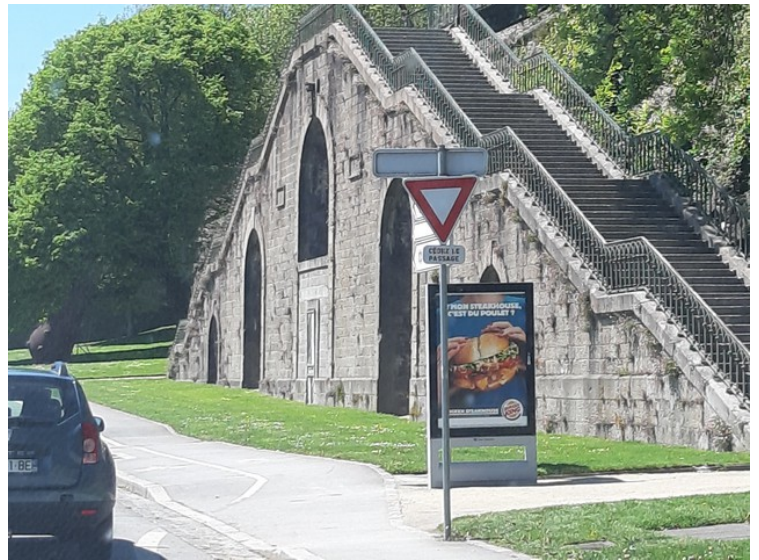
Walls and stairs.