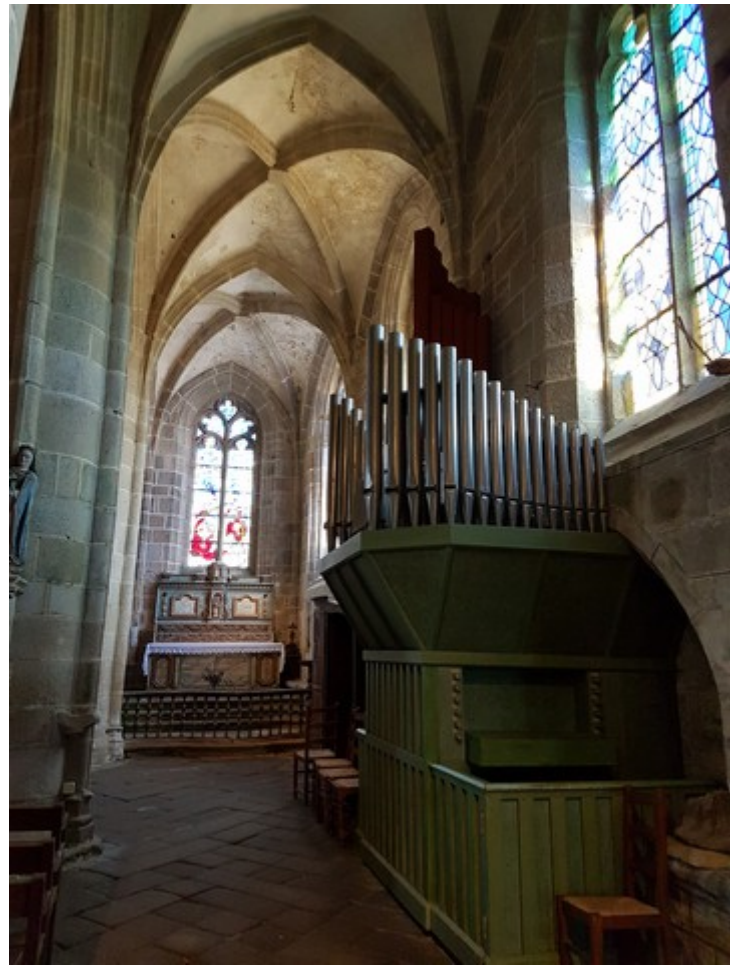
A few pictures from inside the church.