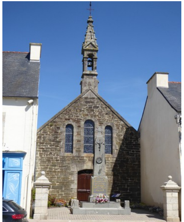
A small church is enclosed in a house row.