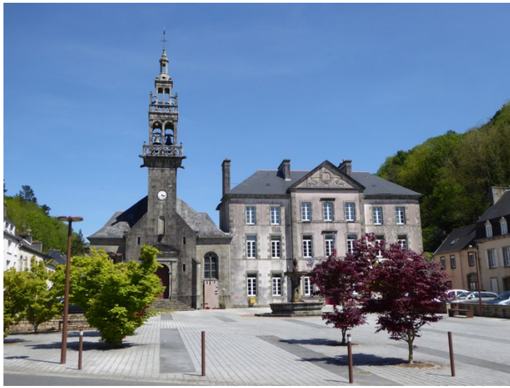
The next stop is in Port-Launay .