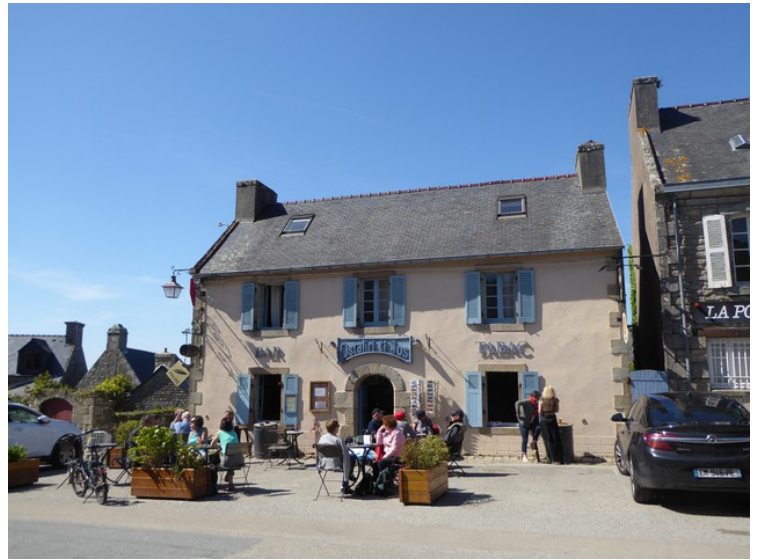
The next stop is in Locronan . Frenchdistrict