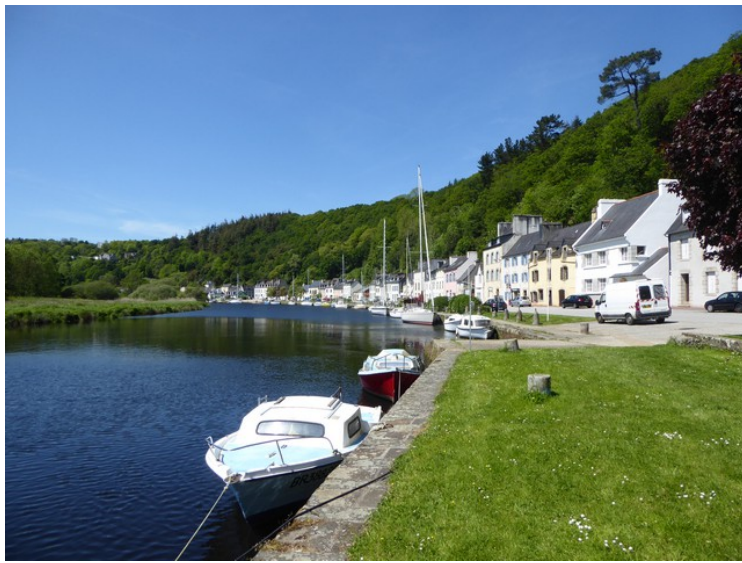
View down the river.

We had a coffee break at a café in this town.