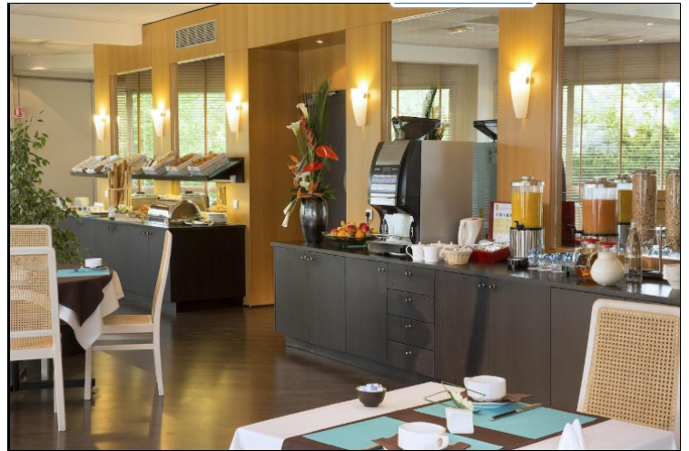
The last stop this day was at Oceania Quimper Hotel .