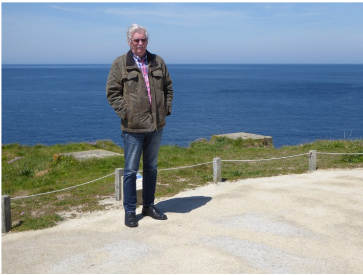
Here I have the Atlantic Ocean in the background. This part is called The Celtic Sea .