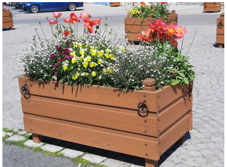
The next stop was in Pleyben . Nice flower boxes in the square.