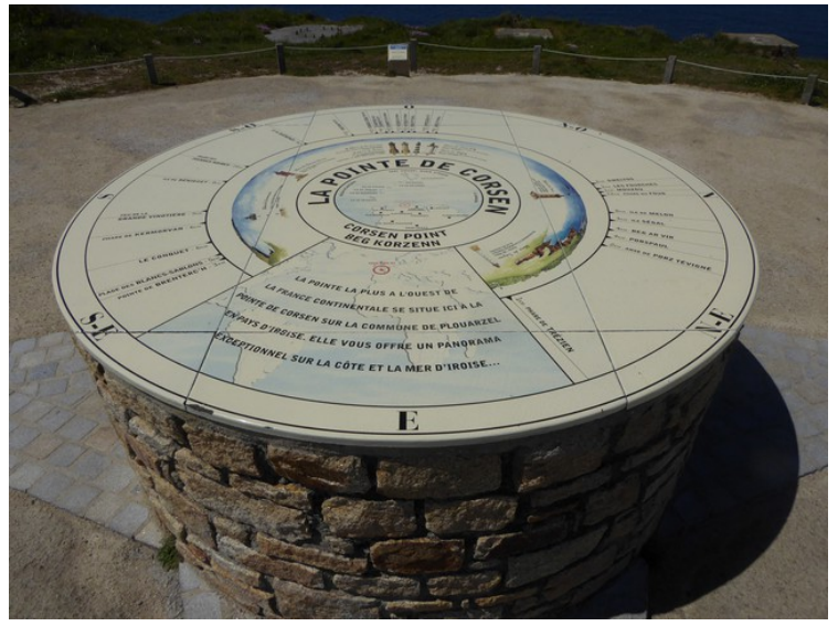
This is the westernmost point, La Pointe de Corsen .