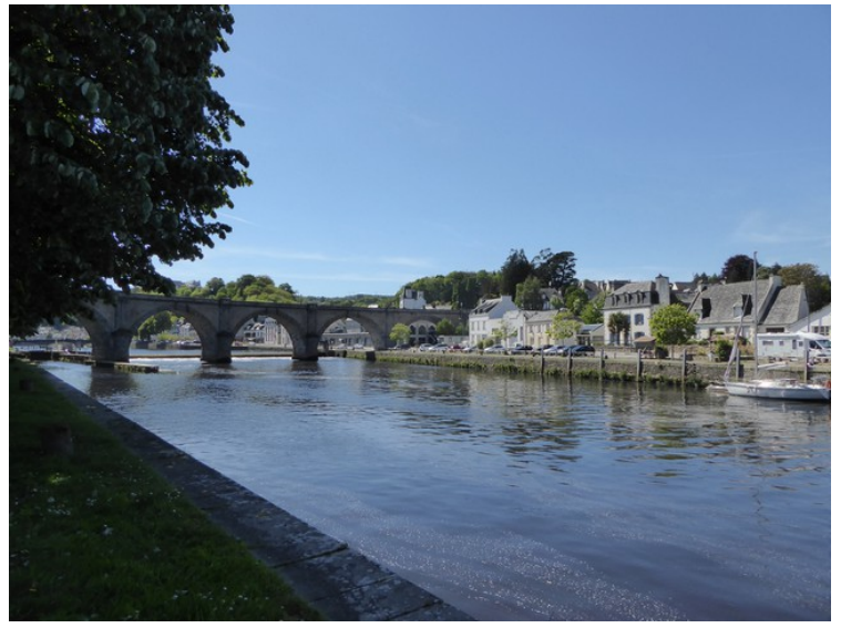
A bridge across the river at Châteaulin.