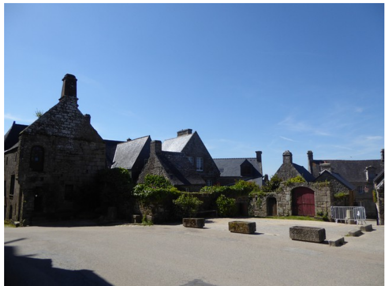
The square below the church.