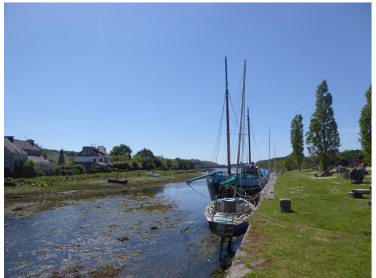
The river Le Camfrou flows through the town.