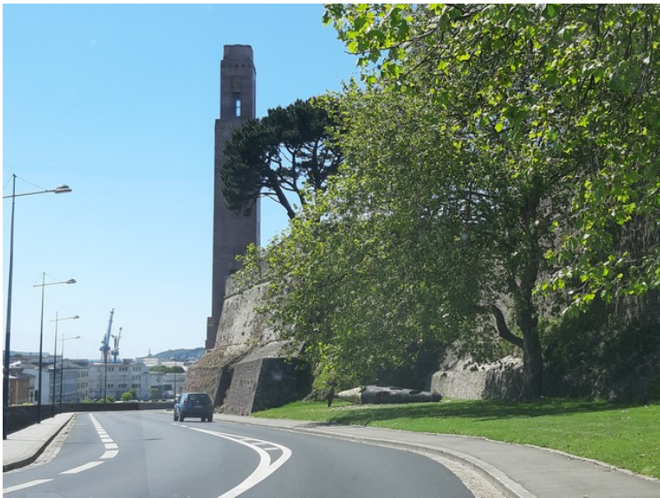
This is US Marine monument i Brest.