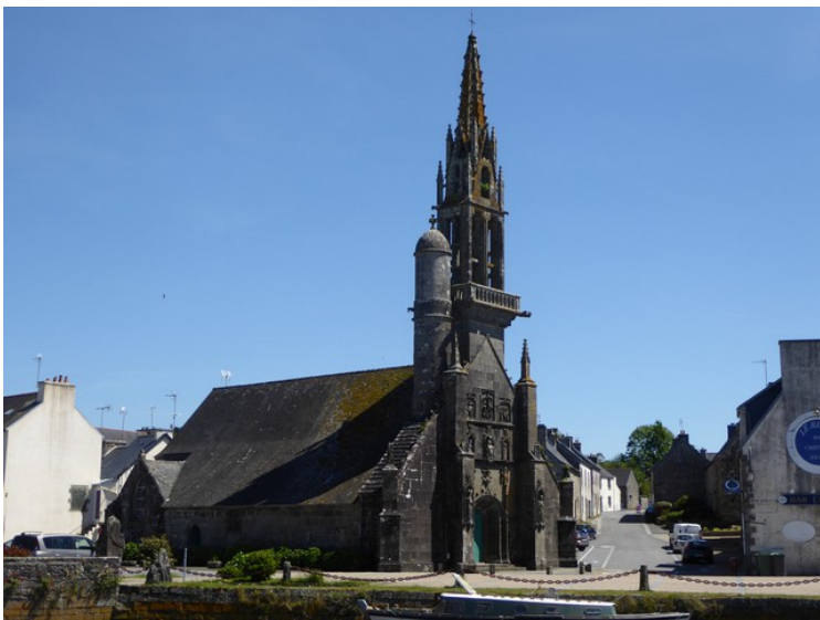
First stop after Brest is in Hopital-Camfrou . This is the church Église Notre-Dame-de-Bonne-Nouvelle .