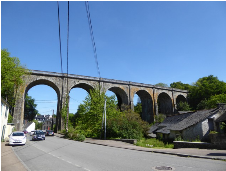
A railway bridge in Châteaulin.