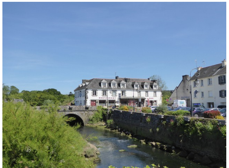
This is a hotel, Auberge du Camfrou