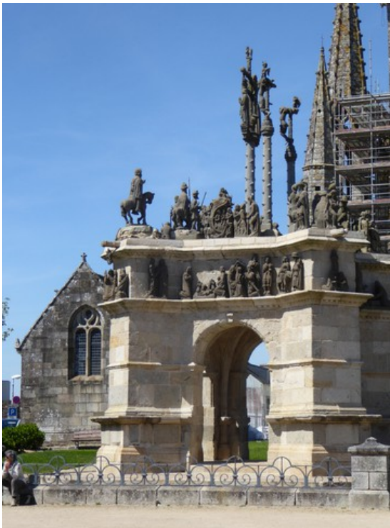
Special entrance portal.