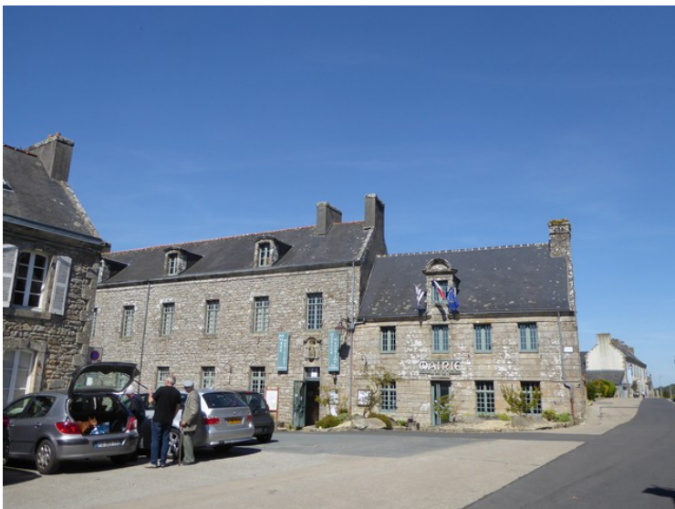
We stopped outside the town hall.