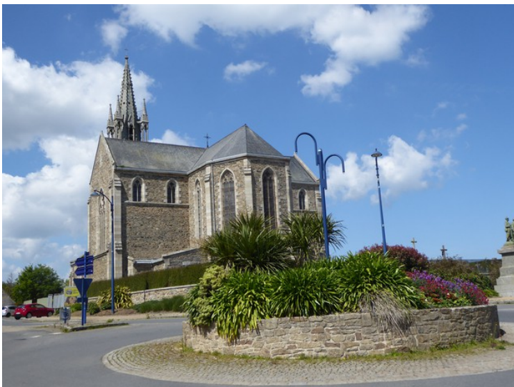
It stood next to this church, Église paroissiale Notre-Dame .