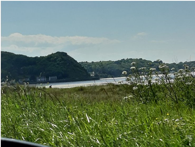
This is at Saint-Michel-en-Grève as well