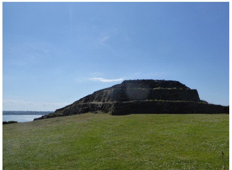
When we arrived at Plouezoc'h , we took a detour to look at the world's largest burial mound.