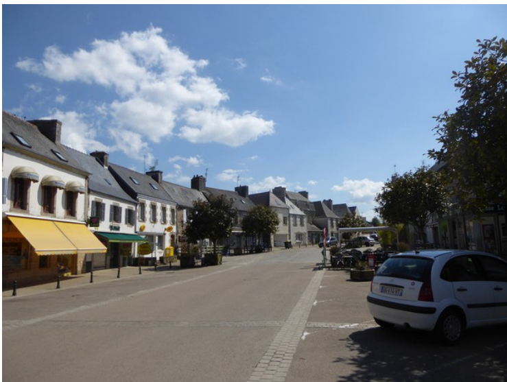
He main street in Lanmeur.