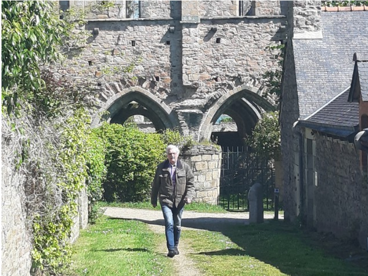
Here I come back after taking the picture.