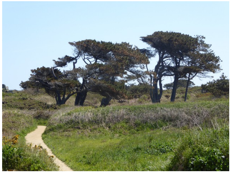
There is special nature out here by the sea.