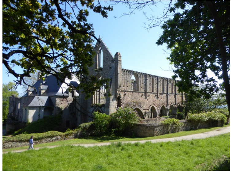
I found these ruins, Abbaye maritime de Beauport . Construction of the monastery started in 1203. The monastery business ended in 1790. Today it is a historical monument and museum.