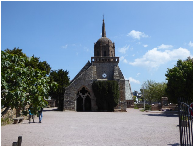
In Perros-Guirec we took a picture of this special church.