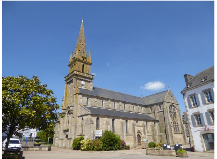
Another church, Église Saint-Mélar de Lanmeur . This one is located in Lanmeur .