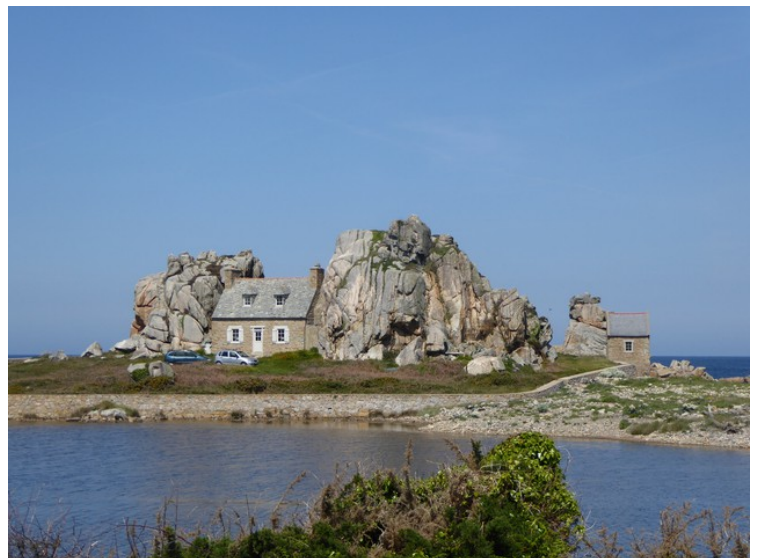
We drove past Plougrescant to see this house, Castle Meur , which stands between two rocks by the sea. It was built in 1861. There are many tourists who come here to see the special house.