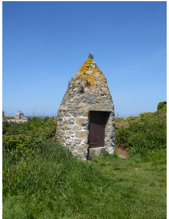
Near the café this house stood.