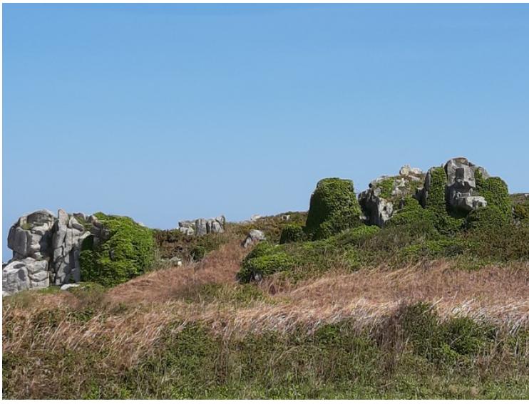
To take the pictures, we parked in a parking lot and walked a bit to see it.