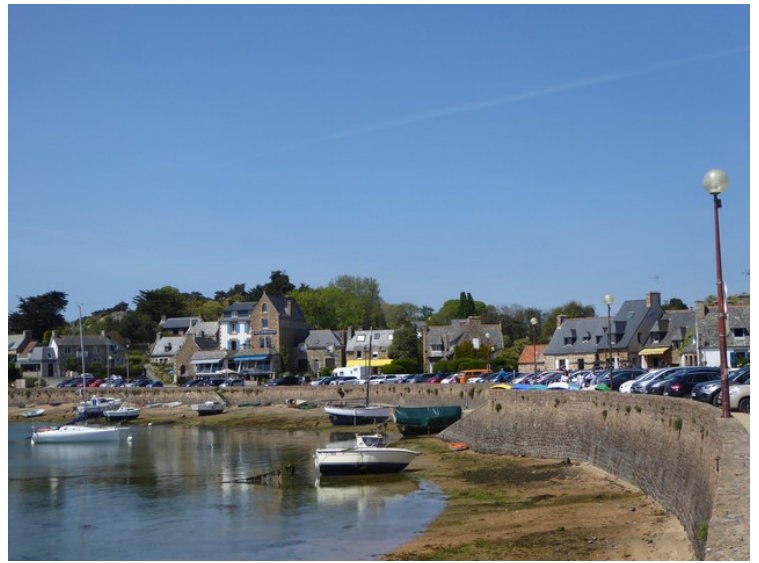
This is in Saint-Guirec

The next stop is in Lannion, located by the river Léguer, Wikipedia France-voyage