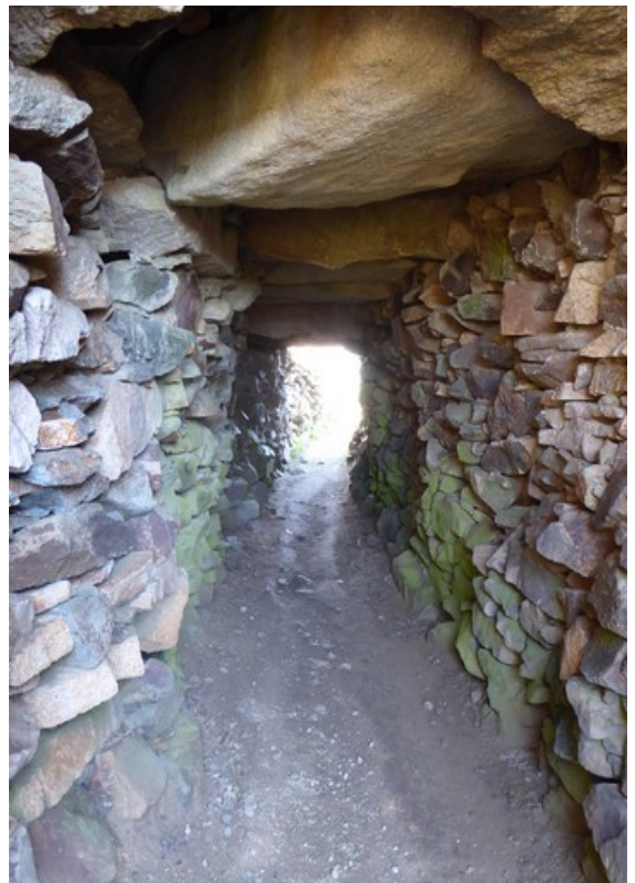
I could see through.