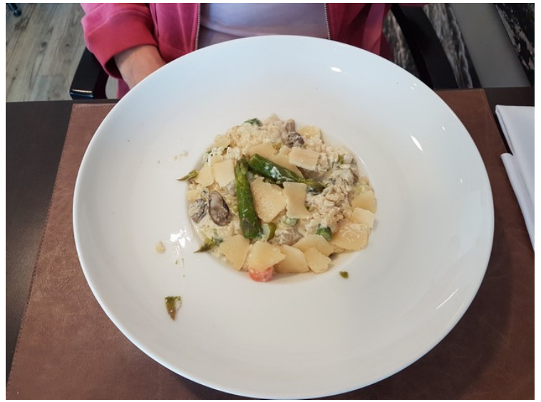
Anne Berit had a mushroom risotto with fish which was very good.