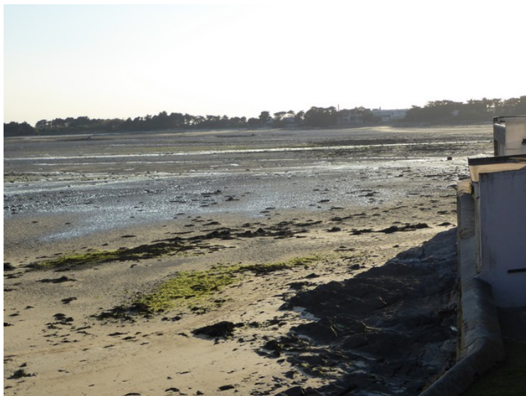
It was low tide, so it didn't look very inviting.