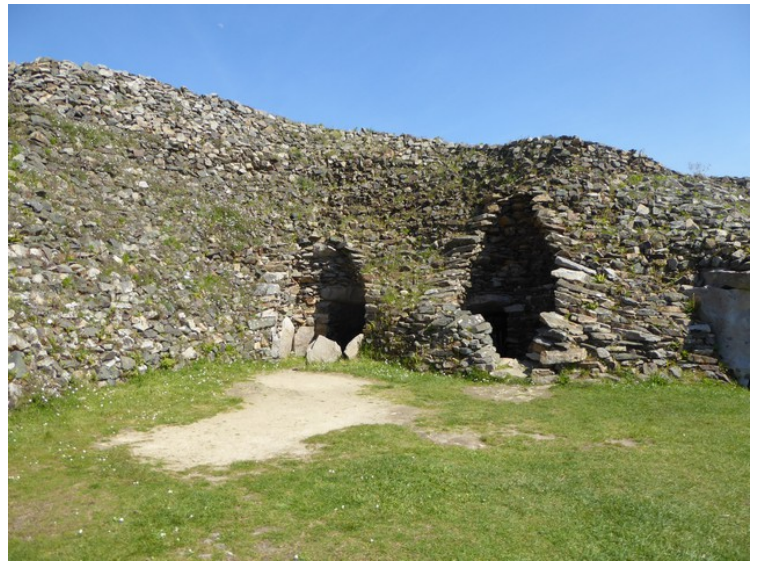
The Barnenez Cairn is 6000 years old. There are 6 tombs inside.