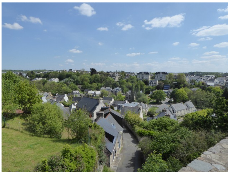
Here we stopped on a hill and had good views of the city. Up to this height there is a staircase from the center of Lannion. It has 142 steps.

The next stop is in Lannion, located by the river Léguer, Wikipedia France-voyage