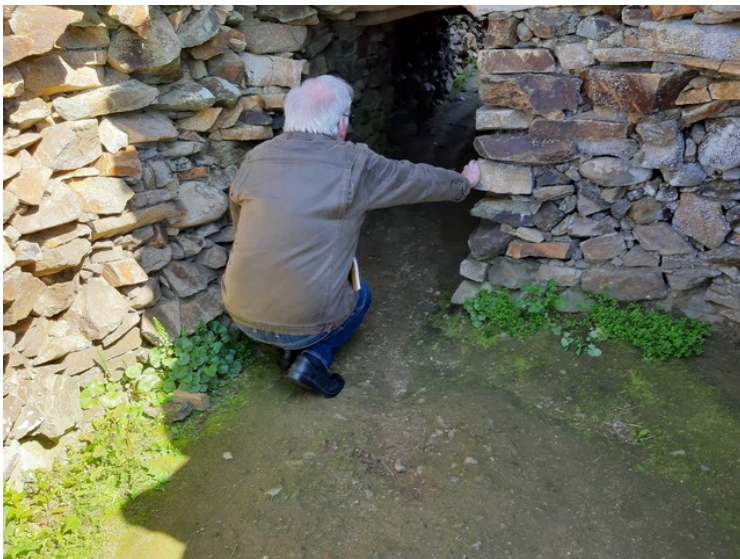
I'm looking inside.