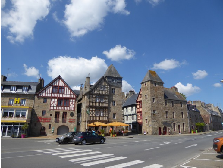
We stopped in Plouguiel to have a cup of coffee at this restaurant, but it was in the middle of lunch time, so we had to eat. We didn't want that, so we left.