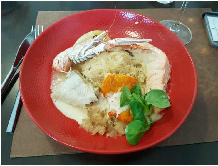
Afterwards we ate dinner at the hotel. I had halibut. It was good, but I didn't like the fermented cabbage.