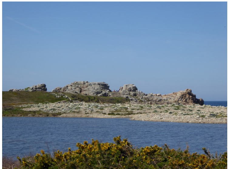
A lot of rock here.