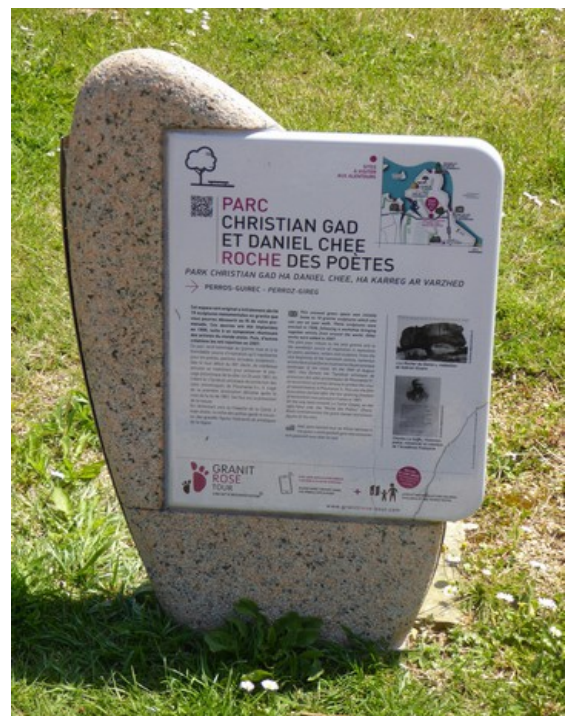
A little later we stopped to take a few pictures in this sculpture park, Parc des sculptures Christian Gad et Daniel Chhé .