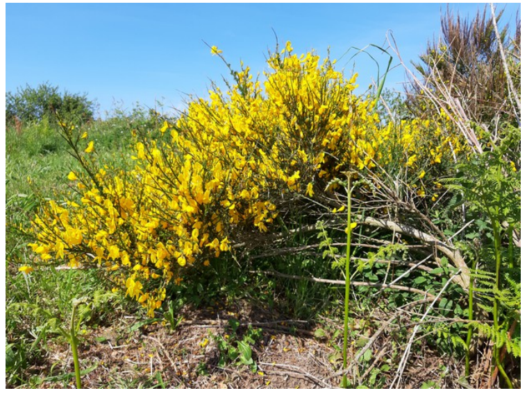
Fine flowering plants.