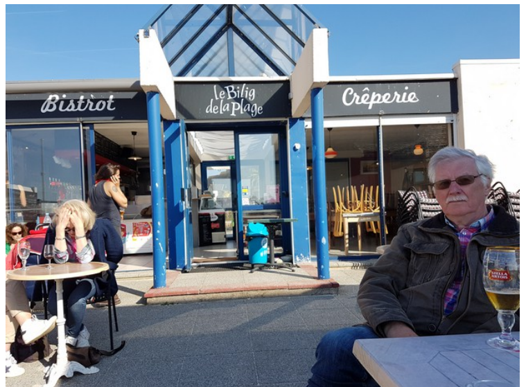
The last stop this day was at Valdys Resort Roscoff . The hotel is almost on the beach.