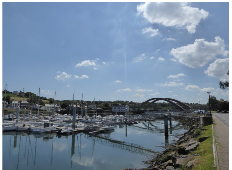
On the other side of the bridge is Tréguier. Here is a marina.