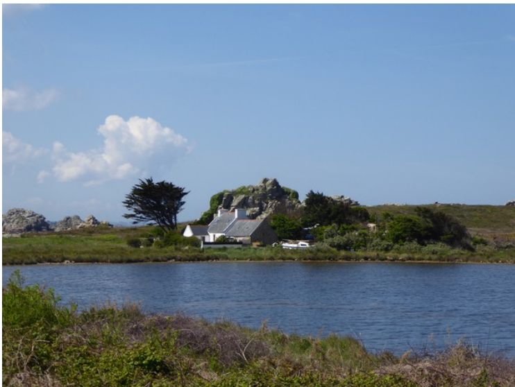
Near the Castle Meur there were several houses, but not so original placed