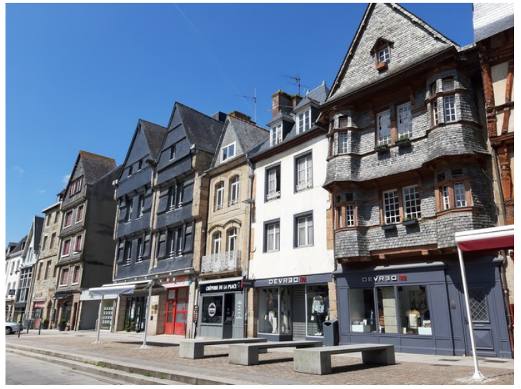
All these houses are around Place du Général Leclerc.