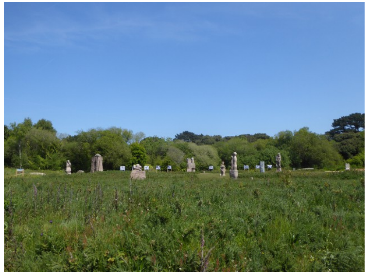
A lot of sculptures.