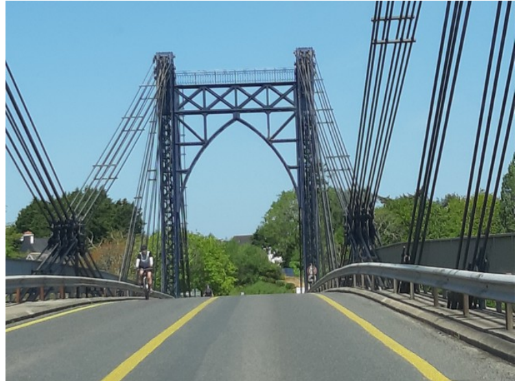
This bridge crosses the river Trieux .