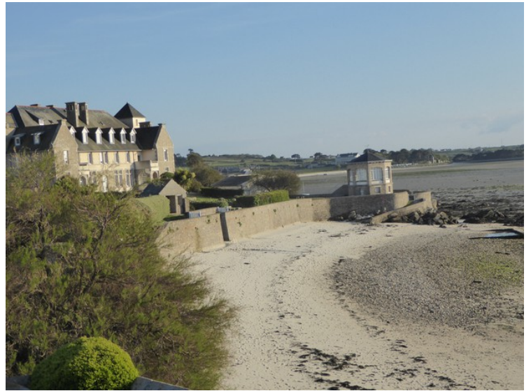
While we were sitting on the balcony we took pictures of the surroundings.