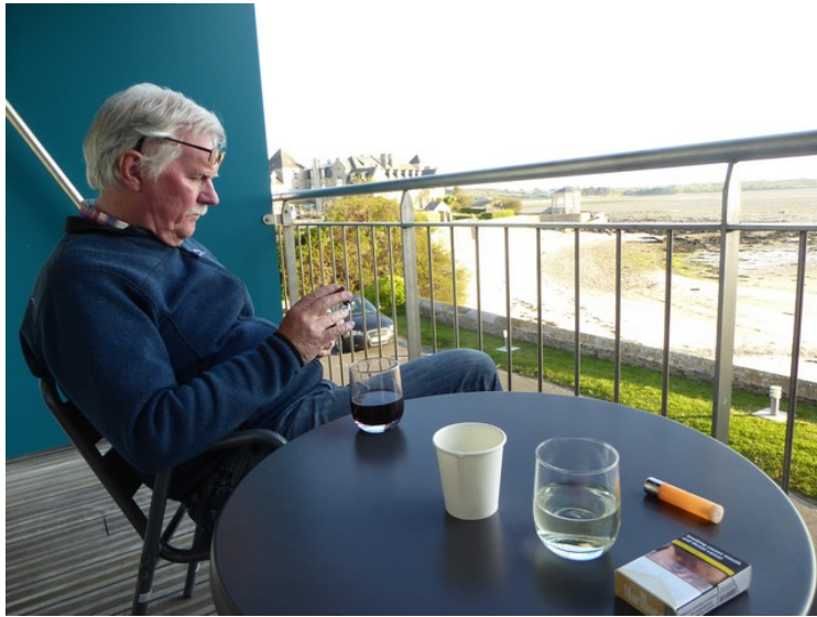
After dinner we had a wine on the balcony.