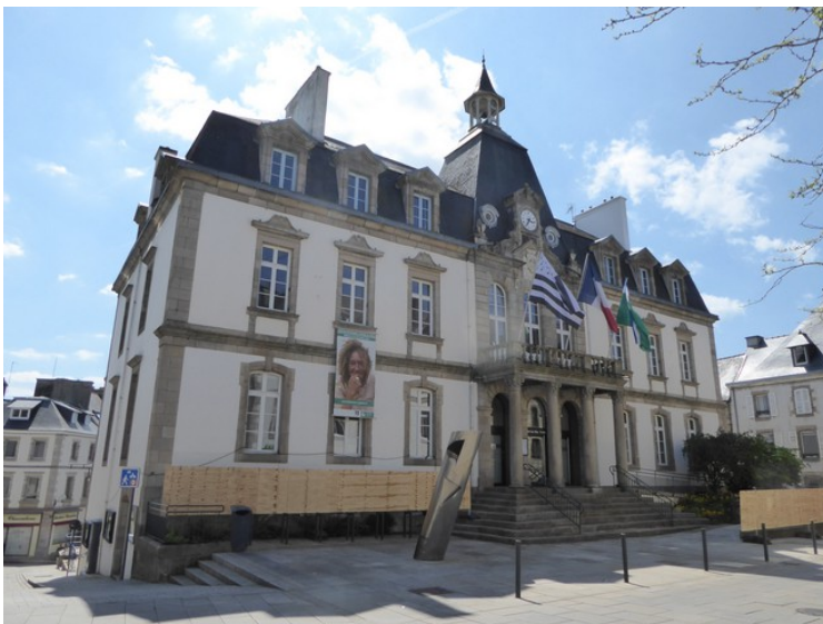
The town hall in Lannion.