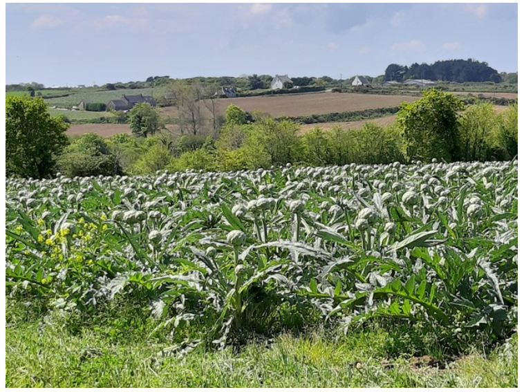
Here we saw the cultivation of artichoke for the first time.