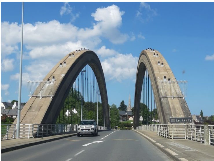
Here we come to a new bridge. This one goes over the river Jaudy.