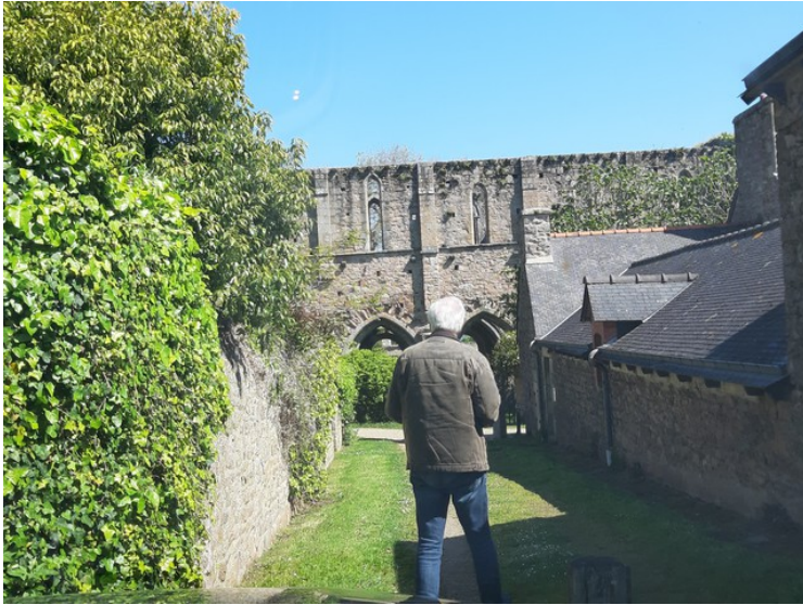
Here I saw some old walls, so I had to stop. Here I go to take a picture.

On the 12 th of May we continued our tour of France.