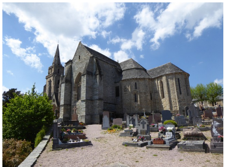
Here lies also this church, Eglise de la Trinité de Brélévenez . Brélévenez is an old district in Lannion.