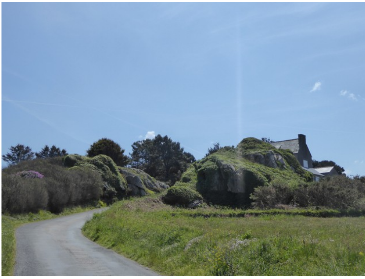
On the way back to Plougrescant.