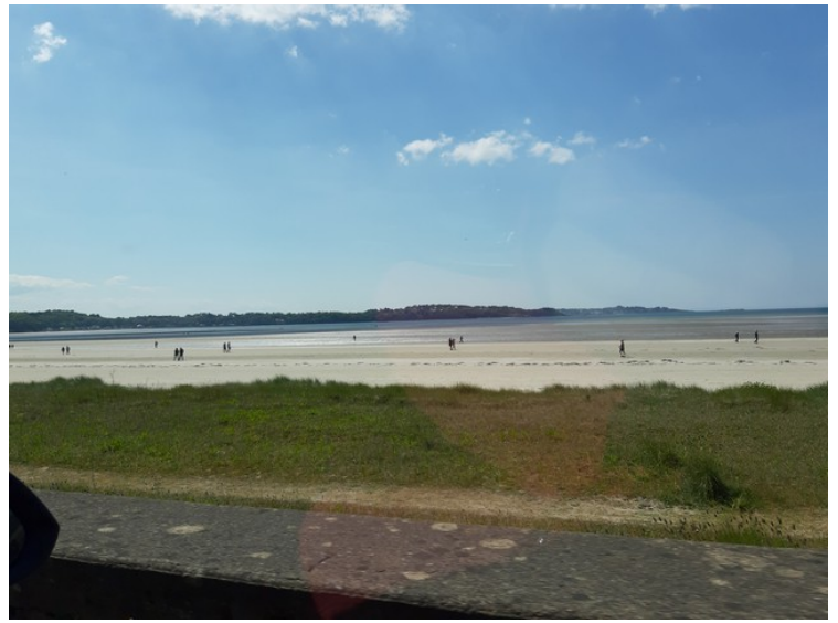
This is at Saint-Michel-en-Grève.