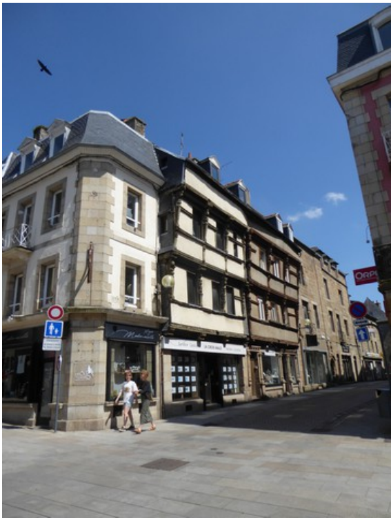
More houses in Lannion.