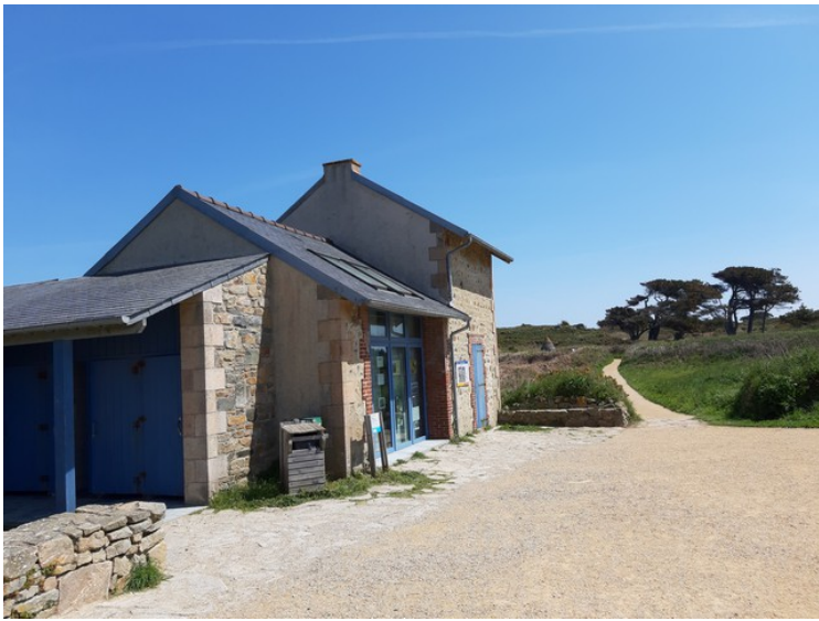
We walked as far as this café. It was closed when we were there.