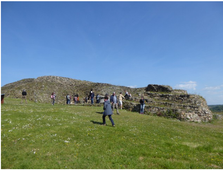
There were more than us two there.