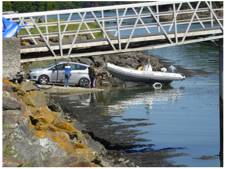
Here is a boat that is going in the water.