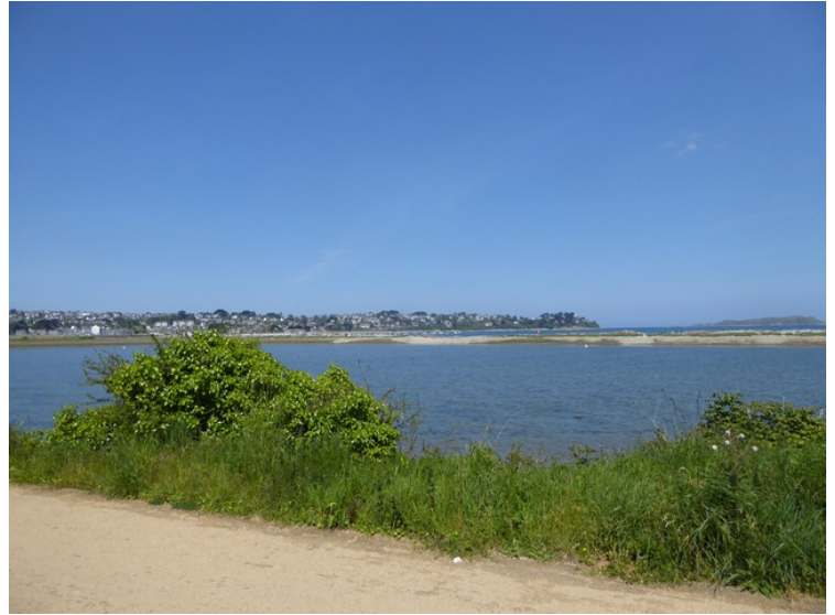
This is right before we get to Perros-Guirec .