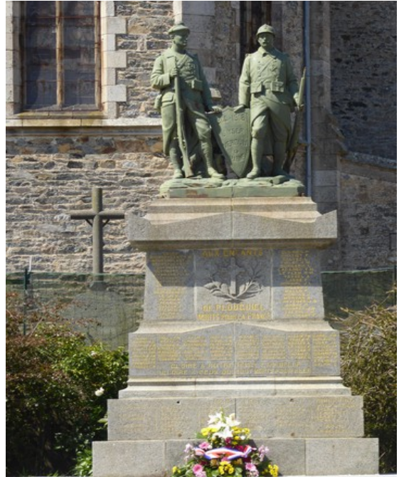
We took a picture of this war memorial, which stood where we had parked the car.