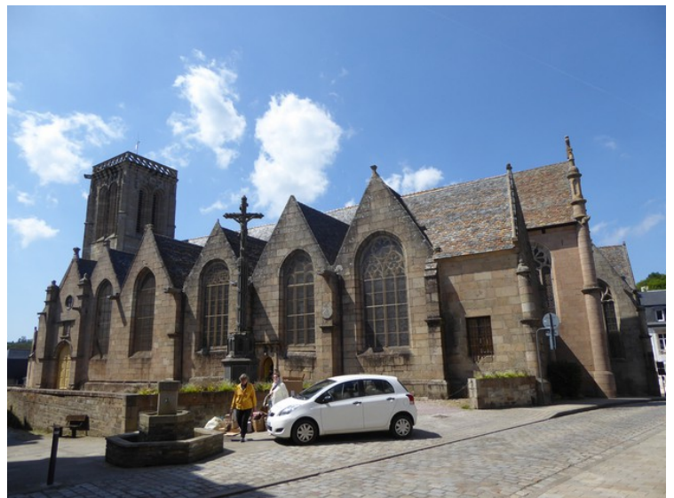
This is a church called Église Saint-Jean-du-Baly .