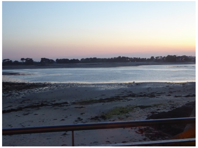
Later in the evening the sea raised a bit.