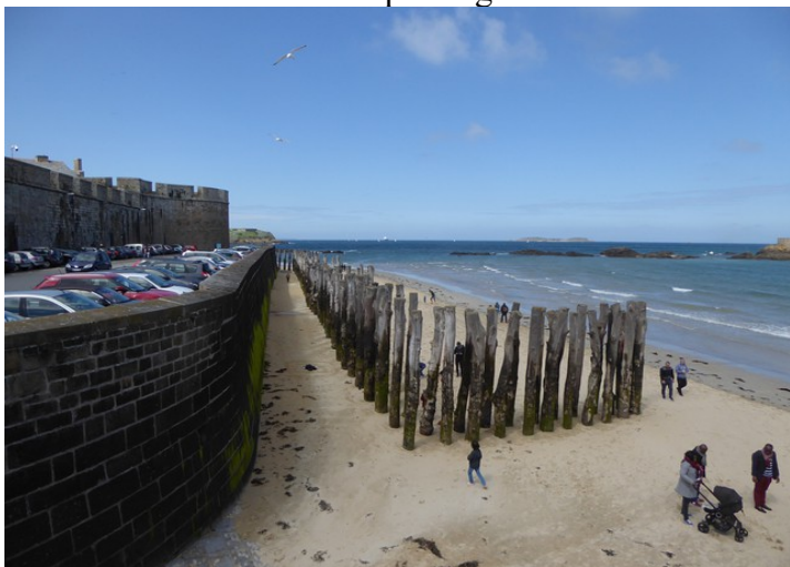
Wooden logs will shield the walls from waves.