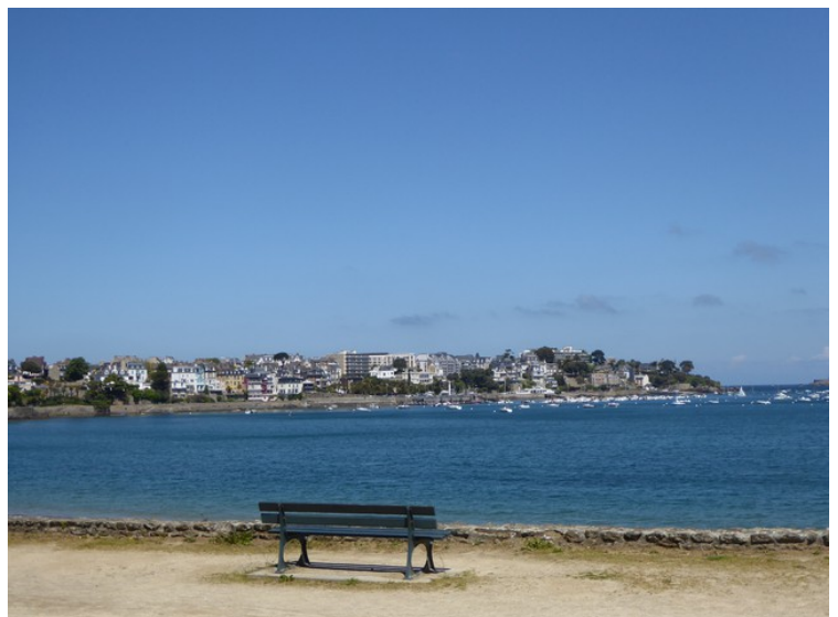
The next stop is in Dinard. Here we are at Plage du Prieuré , before we get into town. The town is a popular resort, especially for Englishmen, and there are many expensive hotels here.