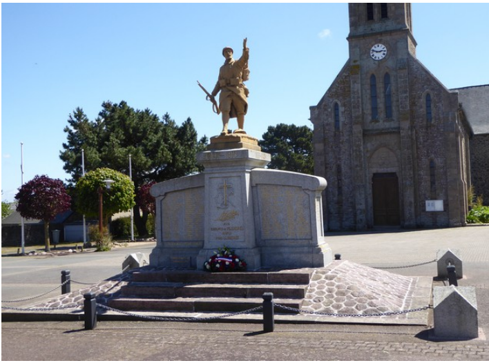
The statue in the front of the church.