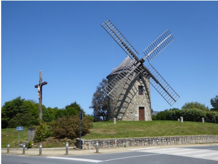
After we had passed Lancieux , we saw this nice windmill.