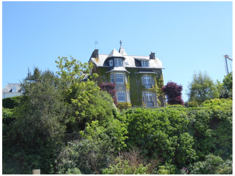
A nice house right above the parking lot, which we stopped on.