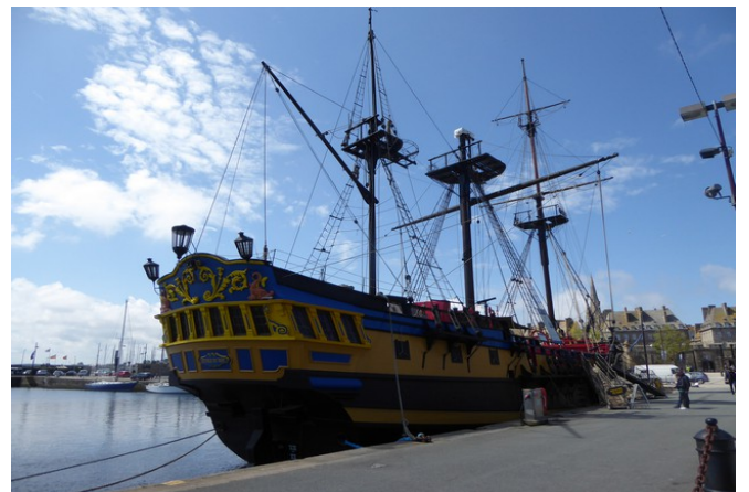
In the inner harbor lies this ship, Etoile du Roy , built to resemble a warship from Admiral Nelson's time.