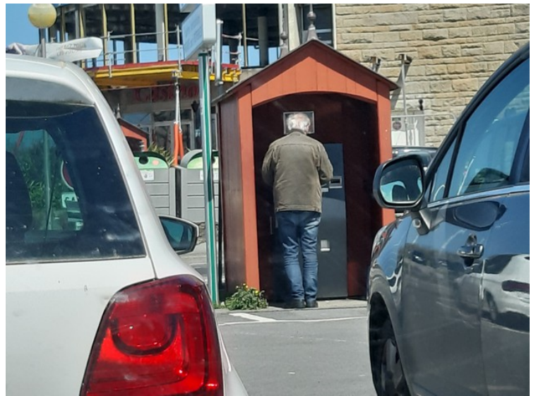
Here I'm paying the parking fee so that we can get out on the road again.