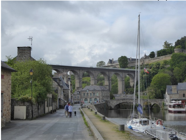
One of the main roads into town goes on this viaduct .

Dinan (Brittany-tourisme) is considered one of the finest cities in Brittany. It has a population of about 10,000.