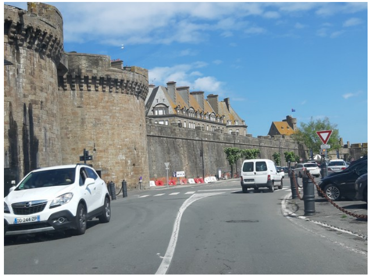
The next stop is in St-Malo. Here we drive along the city walls.

About approx. in 1000 St-Malo was an island where St. Aaron and St. Brendan founded a monastery, where one of the monks later became St. Malo. Hence the name.