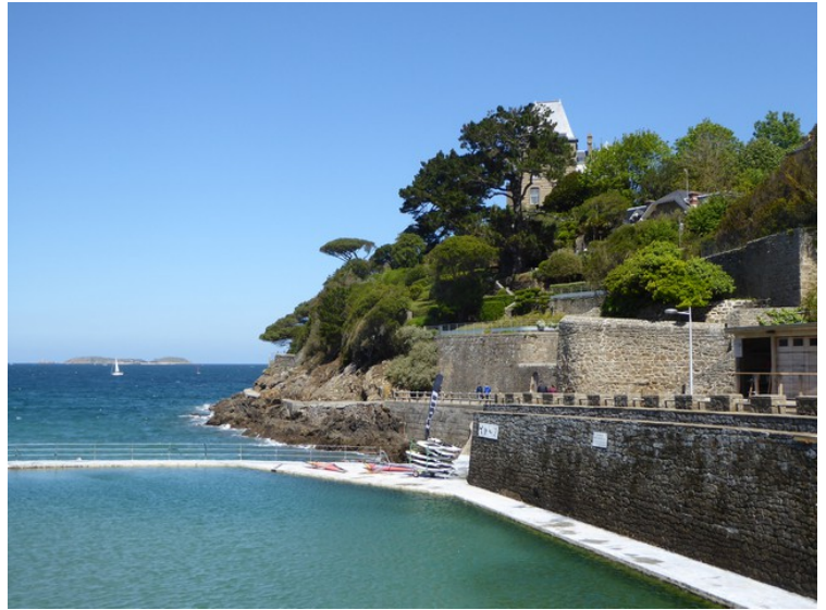
This is near Pointe du Moulinet , which is located on the peninsula as we can see to the right. Here is a public sea bath, or pool, that is filled with sea water even when it is low tide.