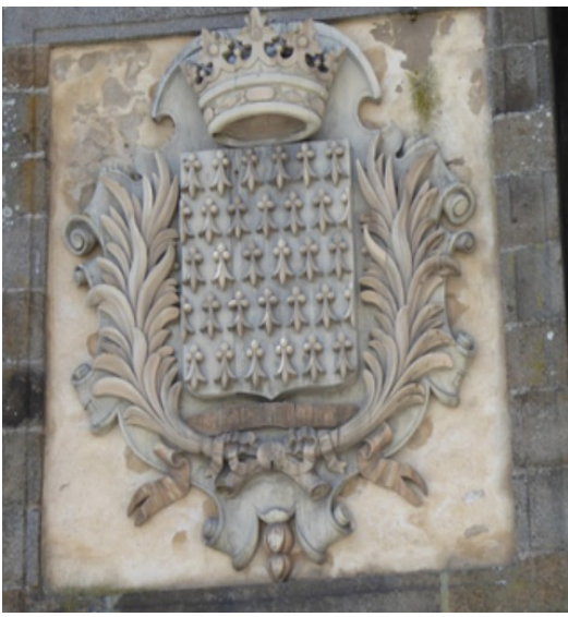
Coat of arms over the gate.