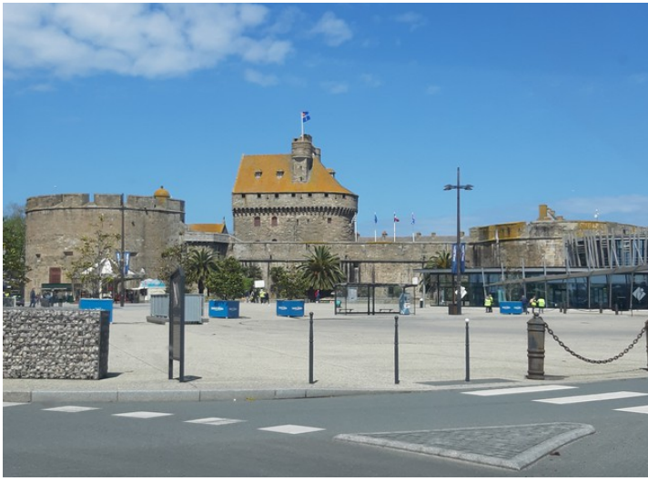
This is part of the city museum.