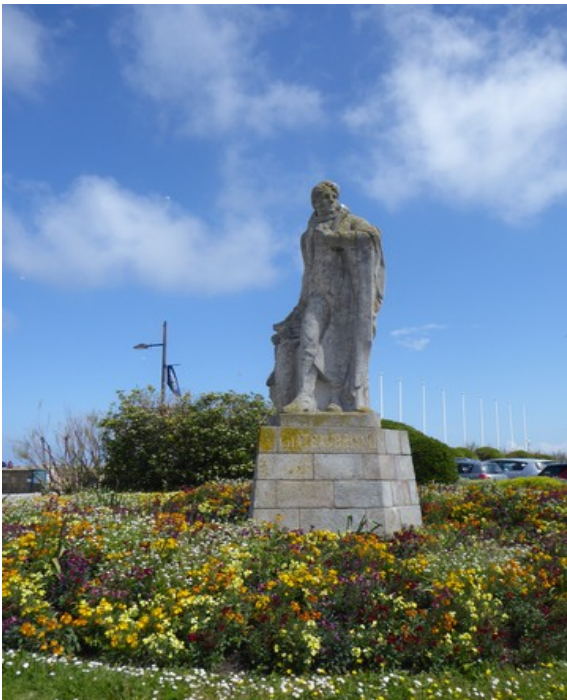
On our way back to the car we passed a statue of François-René de Chateaubriand .