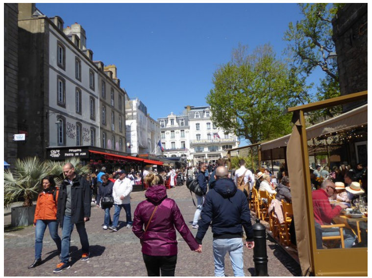
Within the walls there are many restaurants.