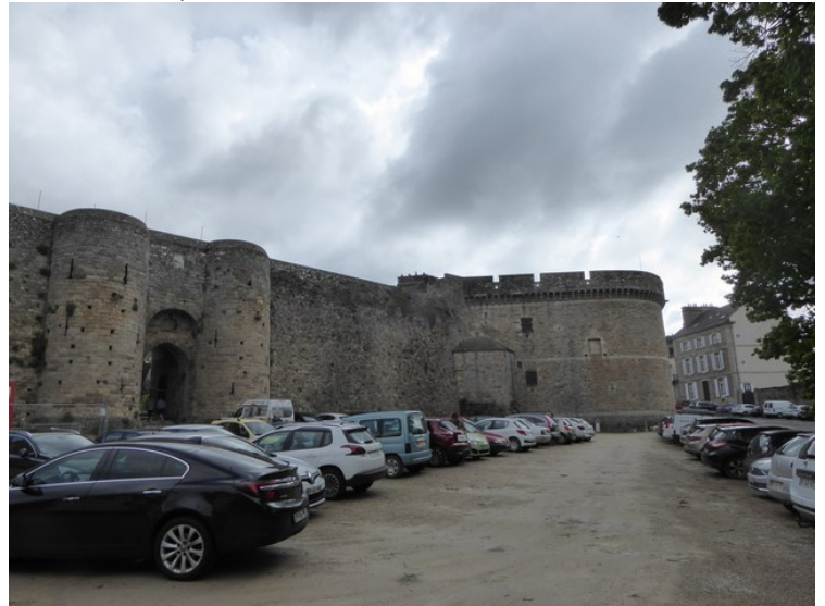
We drove up to the old town and took some pictures of the walls around the old castle, Dinan Castle.