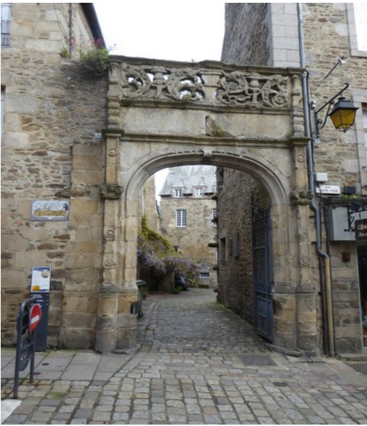
An old gateway in Dinan.