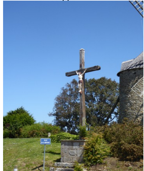
A crucifix outside the mill.