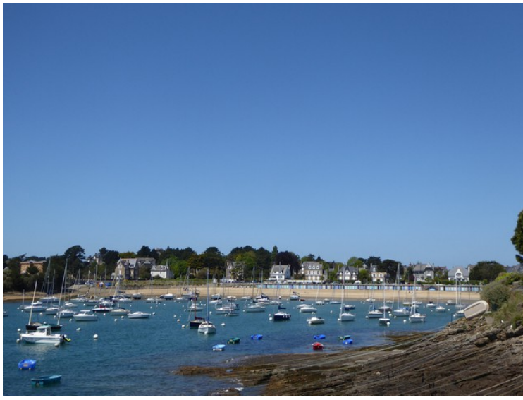
Plage Du Bechet