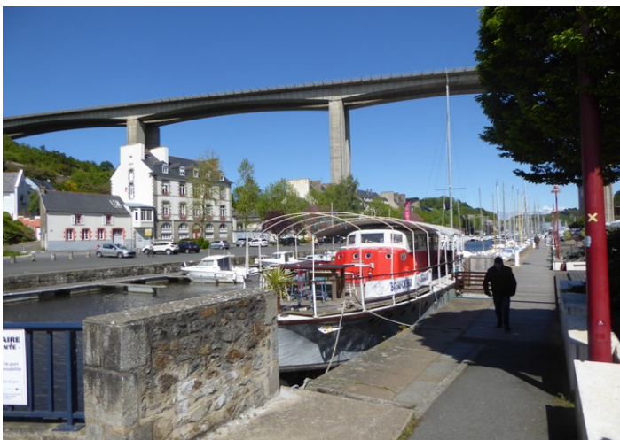
This is in Saint Brieu at the river Gouët .