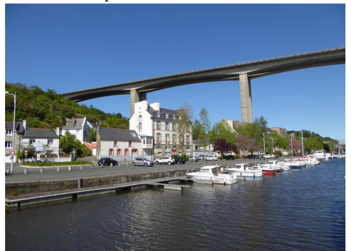
It is nice here.