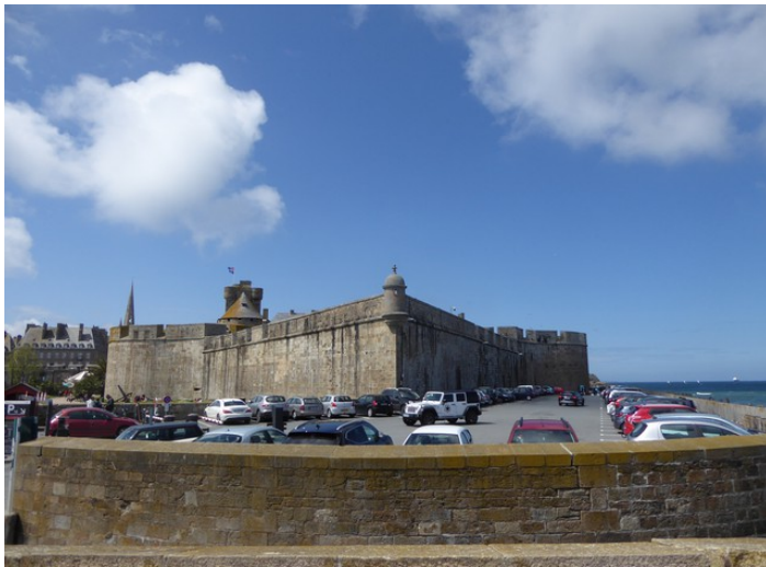
Here is a parking lot.