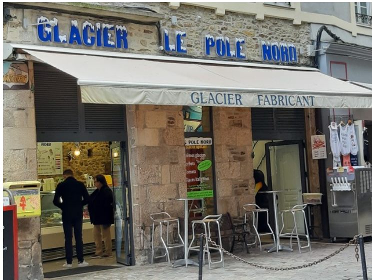
Sale of ice cream. Inventive text.