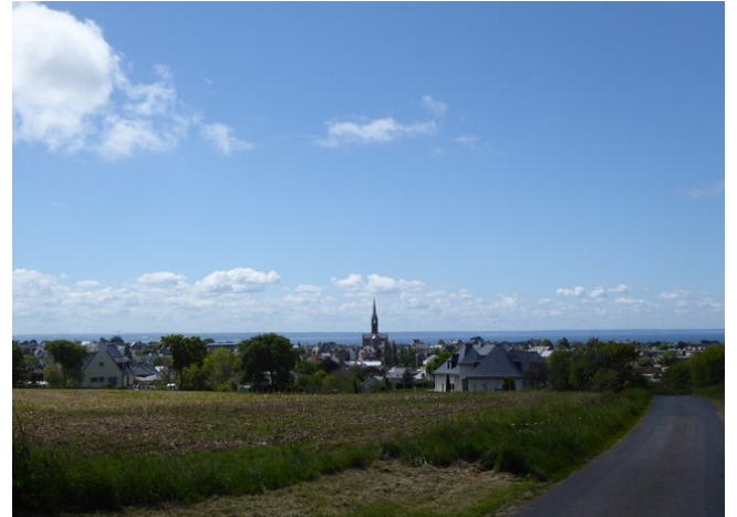
Here we are passing Pleneuf-Val-Andre . We took a picture from the road.