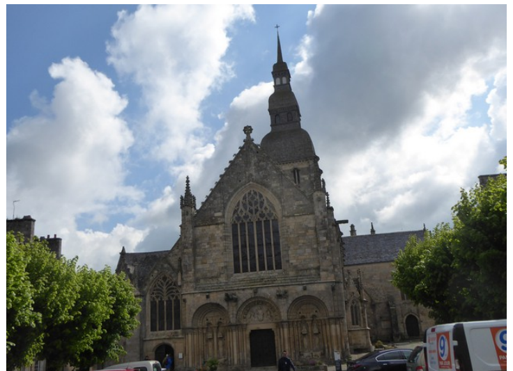
This is the church of basilica Basilique Saint Sauveur de Dinan (Travelguide) seen from two directions.