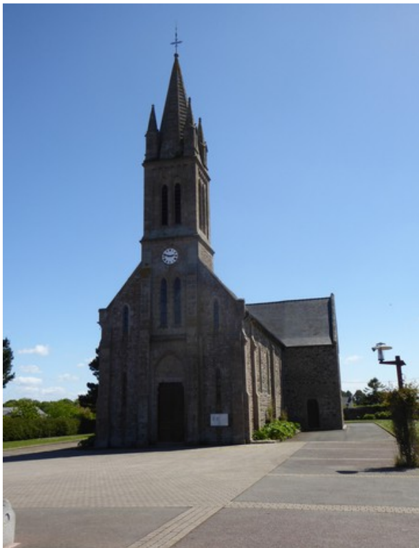
Here we are in Frehel .