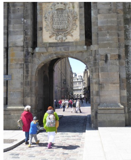
Gate through the wall.