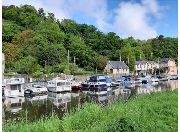
Picture of the harbor outside the hotel. The river is called La Ranche .

Dinan (Brittany-tourisme) is considered one of the finest cities in Brittany. It has a population of about 10,000.