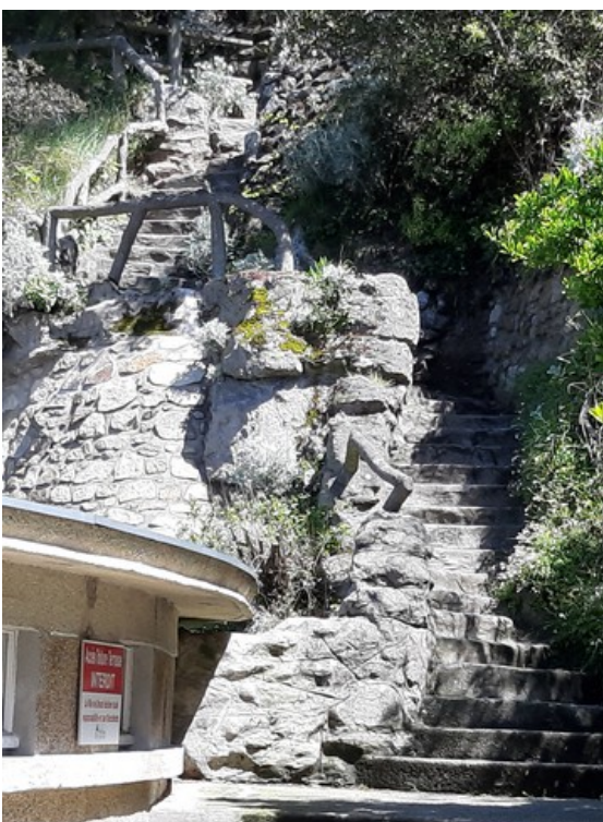
A staircase goes up from the sea bath.