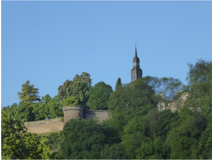
This is a picture taken from the hotel room up to the old town of Dinan. We see the city walls and the spire of the church tower.

On the 11 th of May, we continued our tour of France.