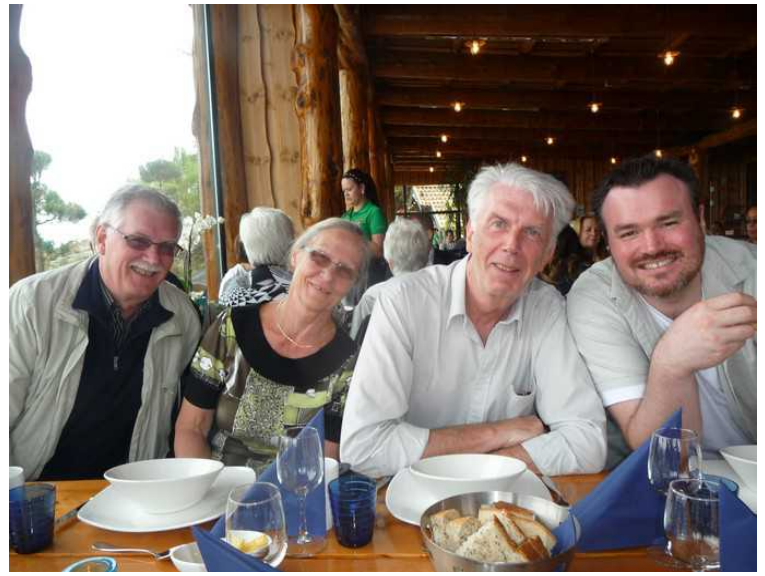
A jolly bunch.