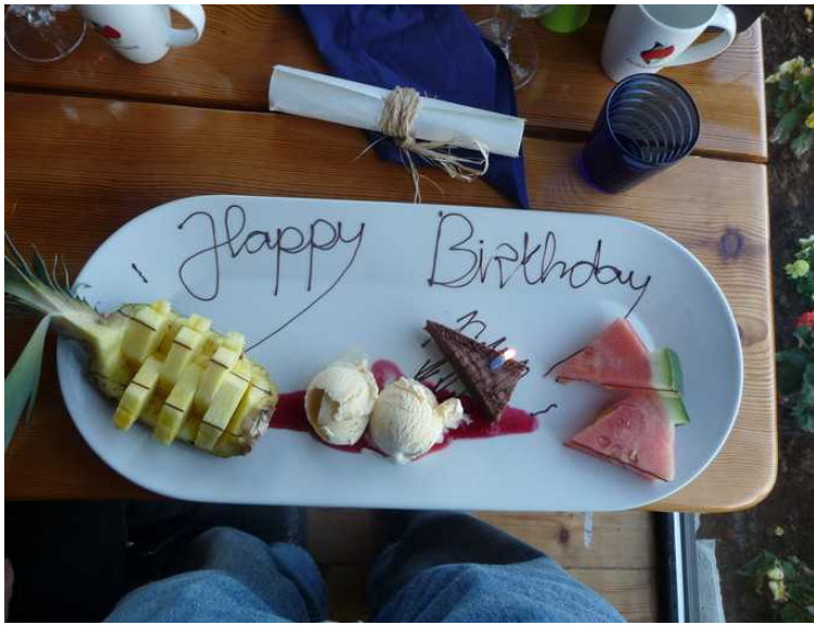
They knew it was a birthday celebration, so they had made a special dessert.