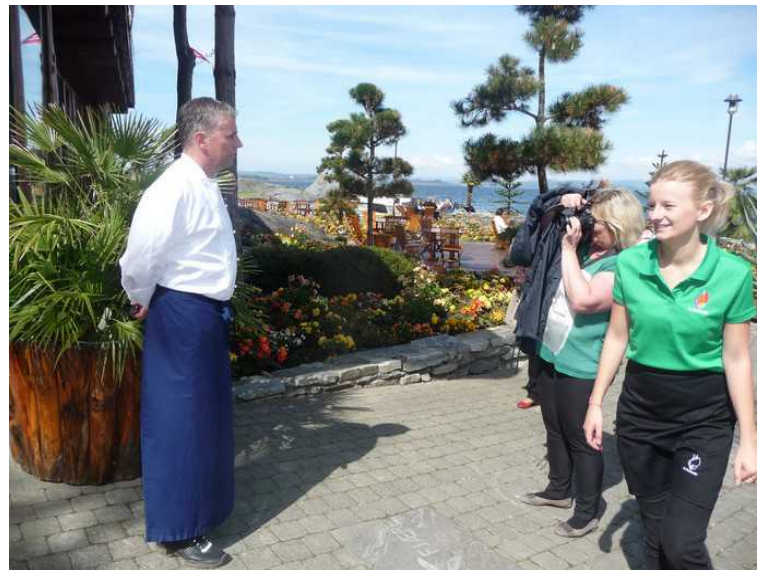
Here is the cook.