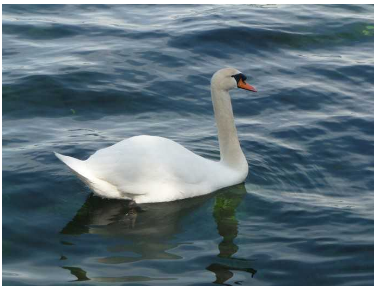
Here we have been visited by a swan.