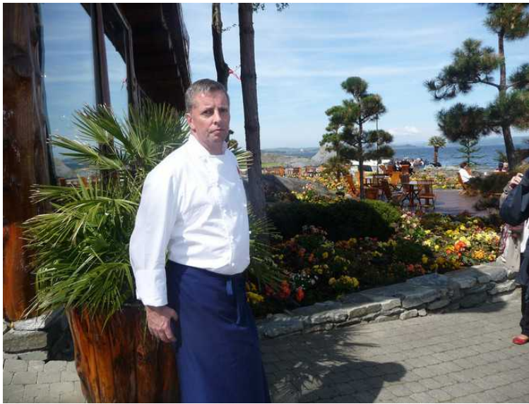
Here's the cook again. He looks a little severe, and he claimed that he never smiled.