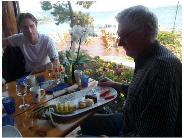
The birthday child starts eating the dessert.