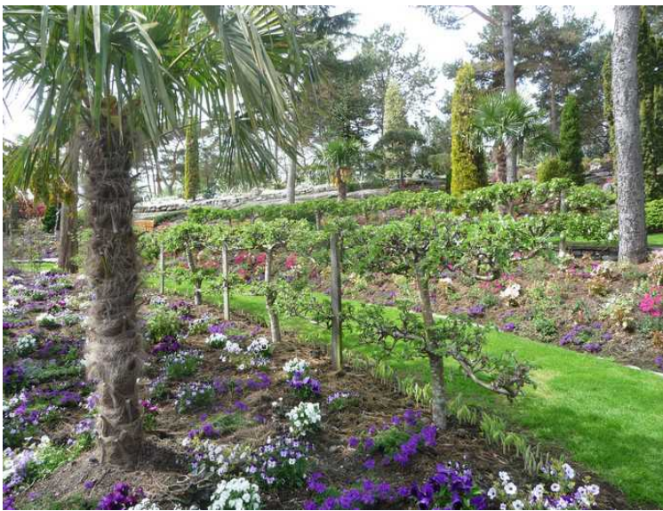
Apple trees shaped like a hedge.