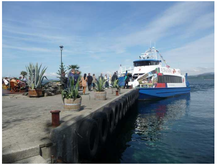
Here is the boat back with more guests. Last year there had been over 35,000 during the season May to September.