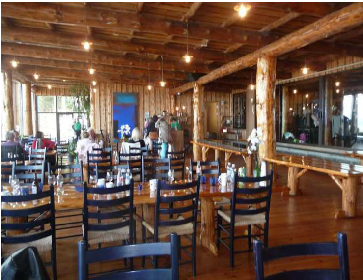
The restaurant is quite large, and it filled up. There was a similar restaurant in the next room, which also was full when we were there.