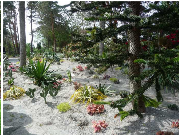
The cactus department.