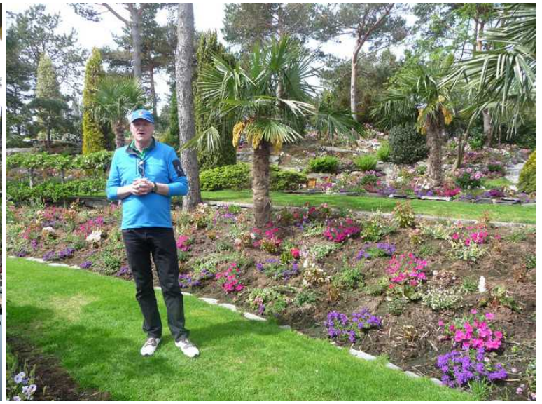
He who runs the place showed us around.