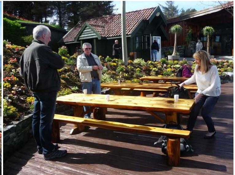
Afterwards we took the coffee out in the garden.