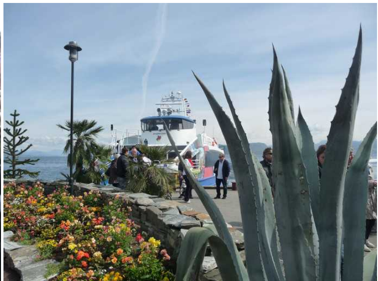
Here we arrive. There was at first a tour of the garden, and here follows a series of pictures from there.