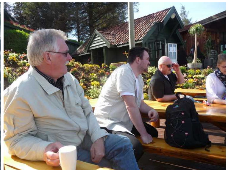
The weather was nice that day and nice and warm in the sun. There were many degrees warmer here than in Stavanger.