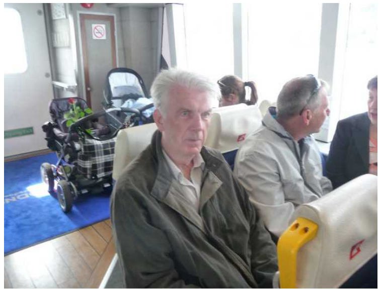
Aboard. The boat takes 97 passengers and it was almost full.