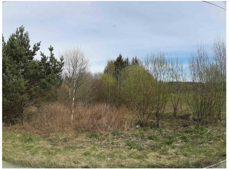
The birches are starting to turn green.