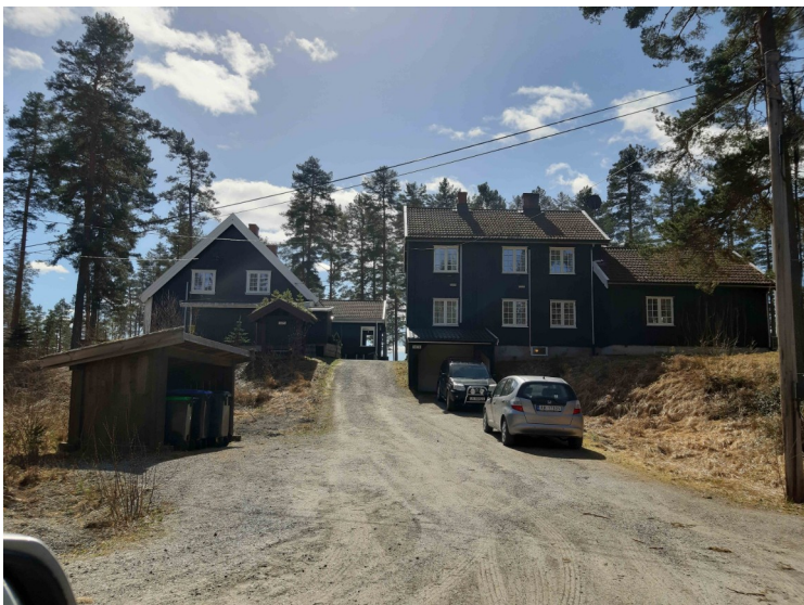
Just beyond is Maarud Gjestegaard . It is a place that facilitates group gatherings.