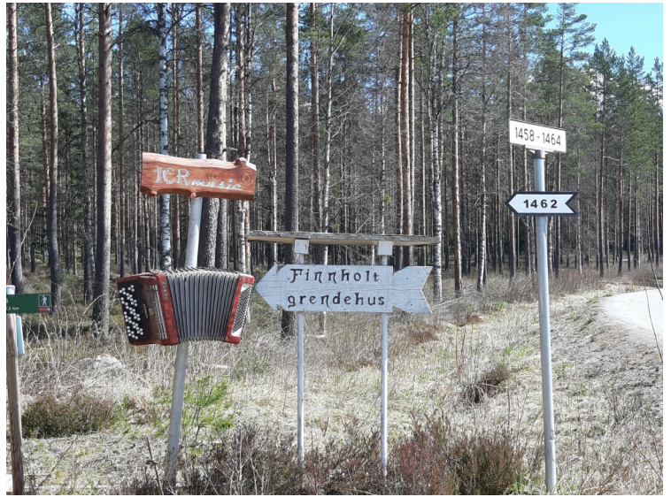
Then we arrive at Finnholt community center. This sign shows the way.