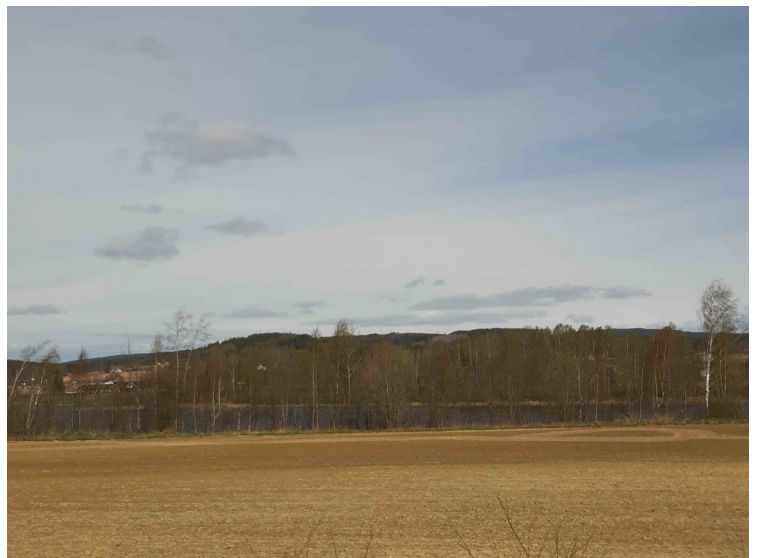
It is dry on the autumn-ploughed fields and the sand blows in the wind.