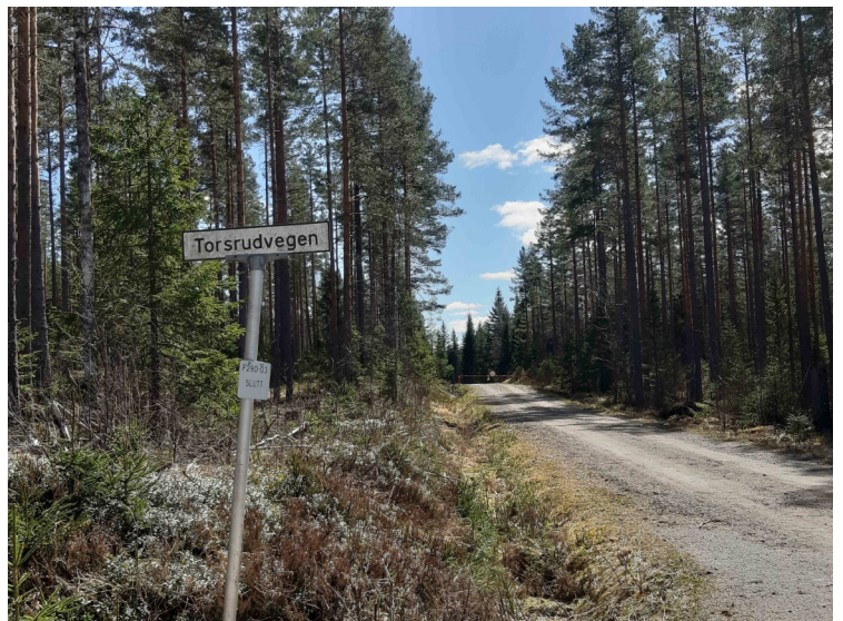
This is where the paved road ends. There are several dirt roads further into the forest.