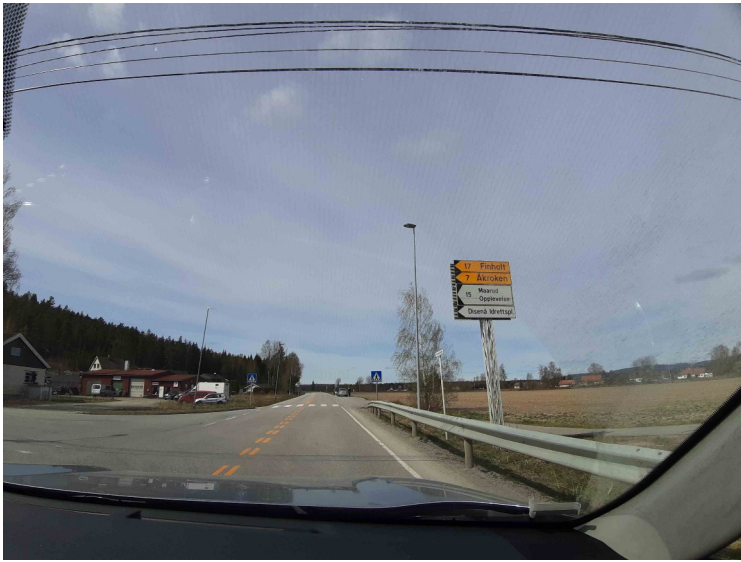
Then we shall turn towards Finnholt by Disenå . Finnholt is a hamlet with 5 small farms approximately 18 km south of Disenå. Disenå had 273 inhabitants as of 1 January 2025.