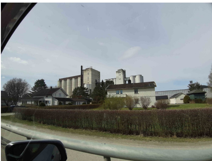
Skarnes mill with grain silos.