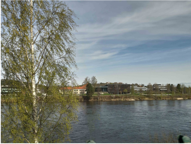
Glomma at Kongsvinger. We see Sentrum videregående skole and Høgskolesenteret in the right of the picture.

We drove a round trip, on the south side of Glomma to start with and the E16 on the north side from Skarnes on the return.