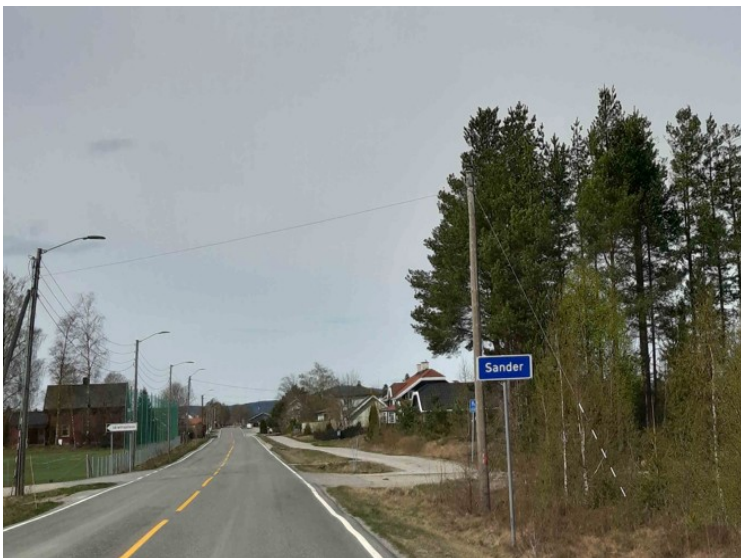
The sign says Sander .