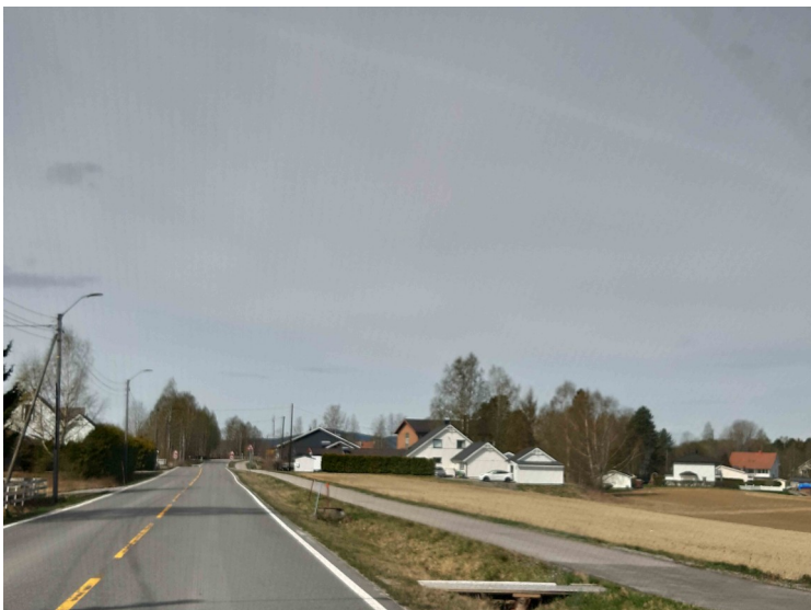
Houses in Sander.