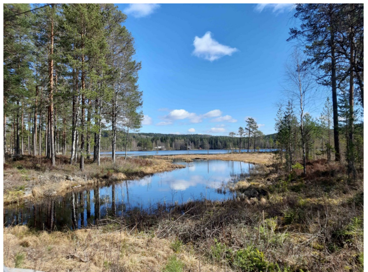
The lake is called Sæterlisjøen.