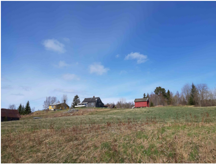
This is Østgarden The eastern farm) at Finnholt.