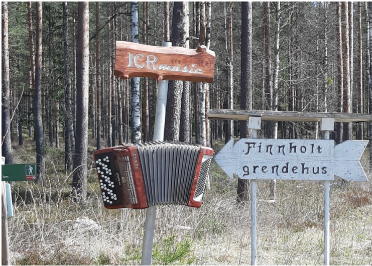
We also see signs for ICR Music, which is a small local music company. Then it fits with an accordion under the sign.