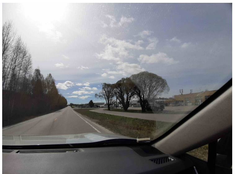
Then followed some straight stretches of road.