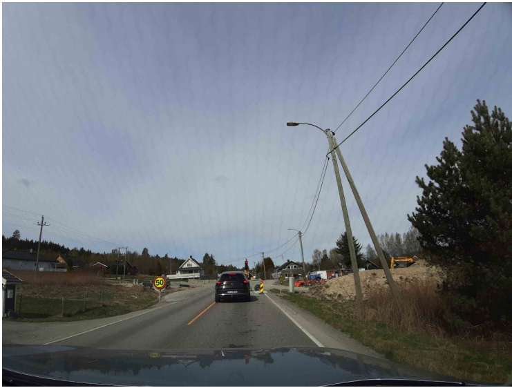
A little after Sander, we had to stop at a red light due to roadworks.