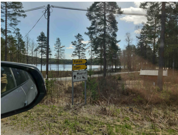
When we drove back we took a small detour here where the sign says Rakeie og Flaen. Rakeie is a listed burial ground that was used in the years from 1887 to 1927.