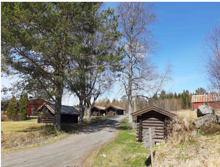
This is Vestgarden (the western farm).