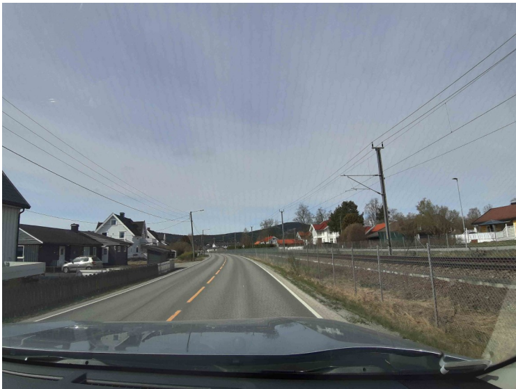
Soon at Skarnes , which is the administration center in Sør-Odal municipality.