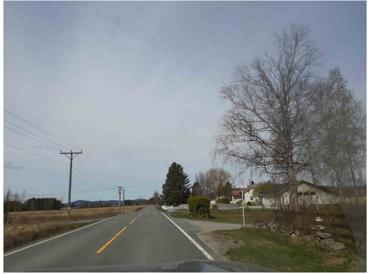
This is at Hærnesmoen, just before we get to Sander.