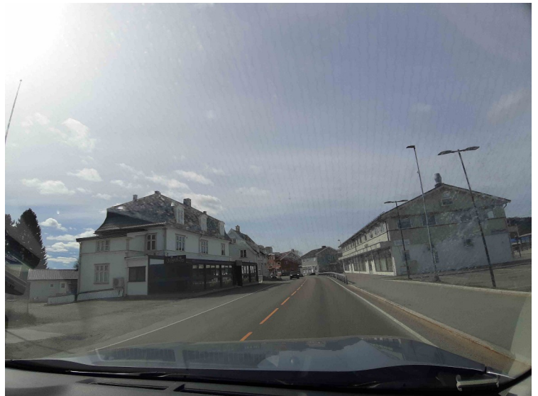
Through Skarnes center.