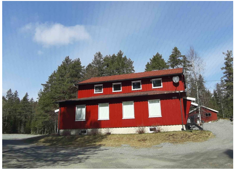
Here is the community center.