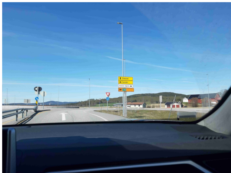
The sign shows to Slåstad .