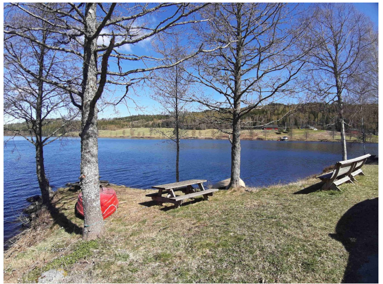
Benches were set out here.