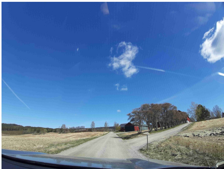
Here we have reached Storsjøveien and will take the road to the right, Tronsbuvegen, which goes to the north side of Dølisjøen.