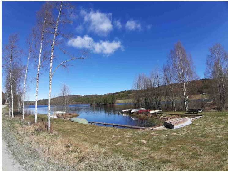
There were quite a few dinghies on land.