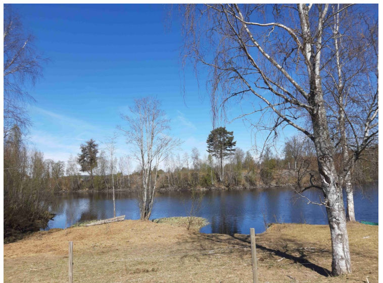
Here we have passed Skarnes and are looking down towards Glomma .