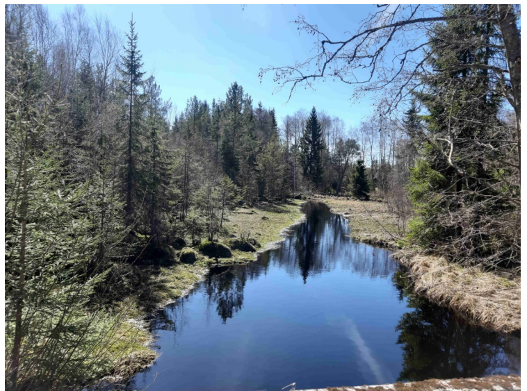
Here we are north of the sea. This is Trondsåa, which comes from the north and flows into the sea a little further down.