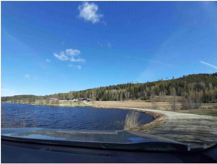
Here we turned around. We see Døli further away.