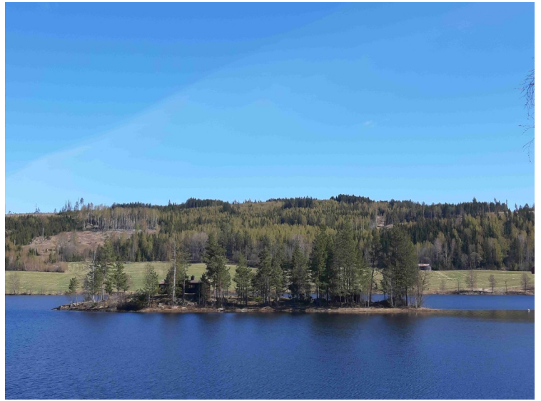
Here there was a small island with a cabin on it.