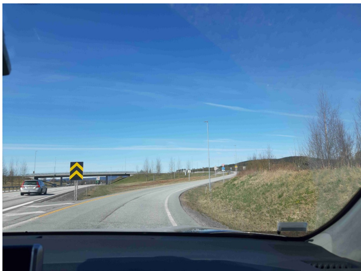
We then drove a short distance on the E16. Here we turn off the motorway towards Slåstad.