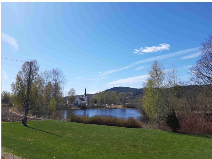
We drove a little round to the west and drive down here along Oppstadåa . We see Oppstad church .