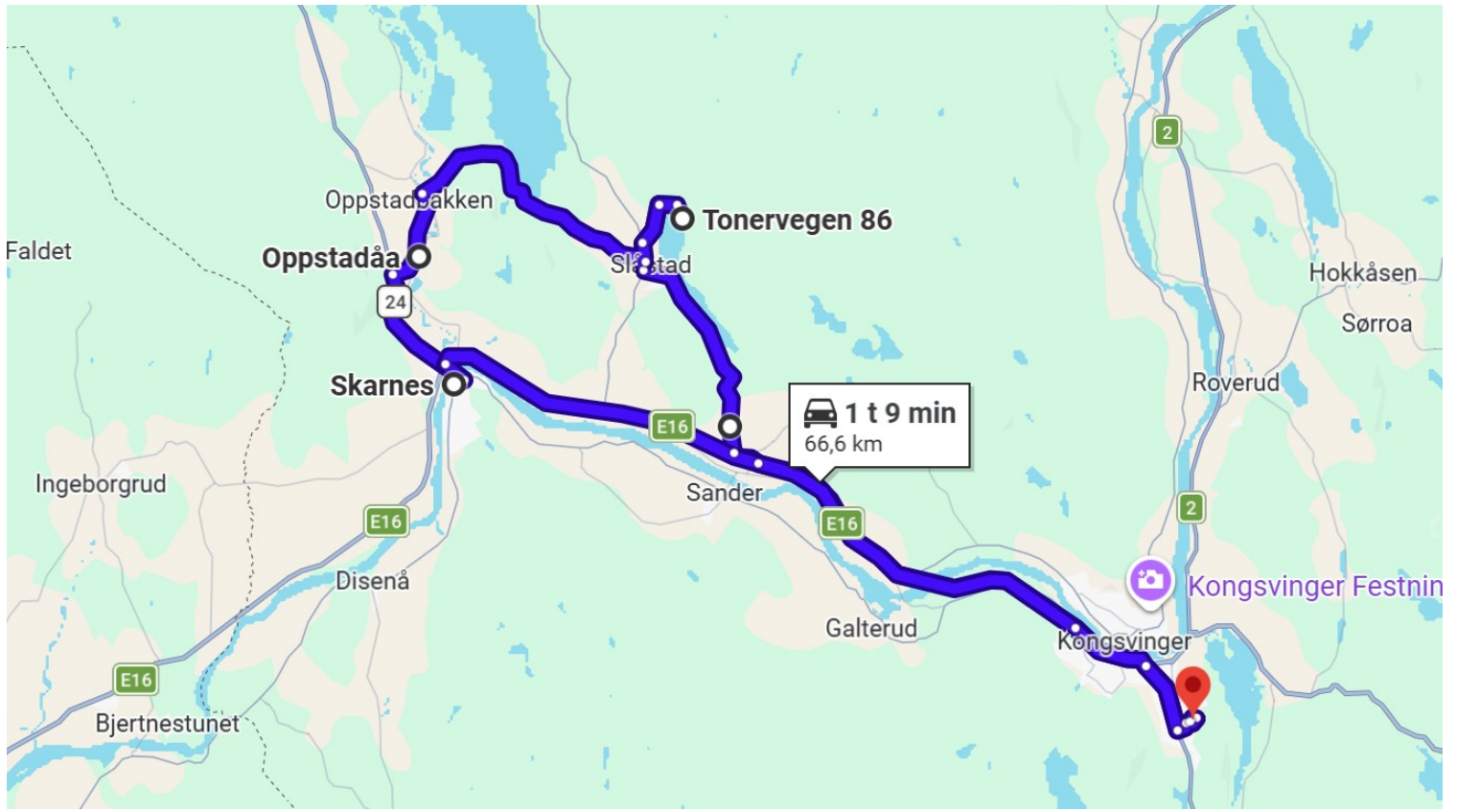
We drove this stretch.