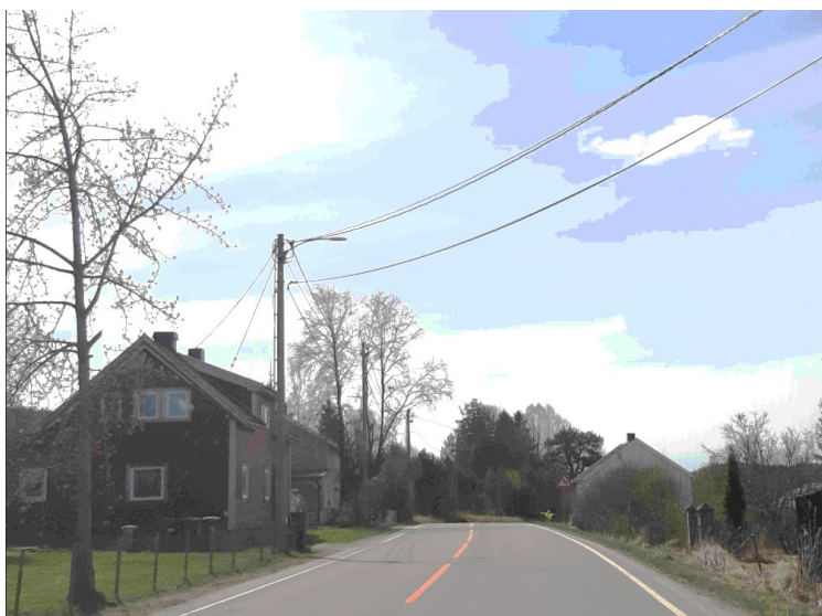
Between Matrand and Hesbøl.

The church was built in 1665, but there have been churches here since the 11th century.