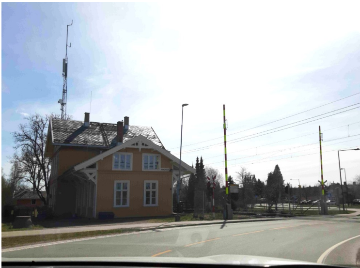
A fine old house across the road from Magnor Glassverk.