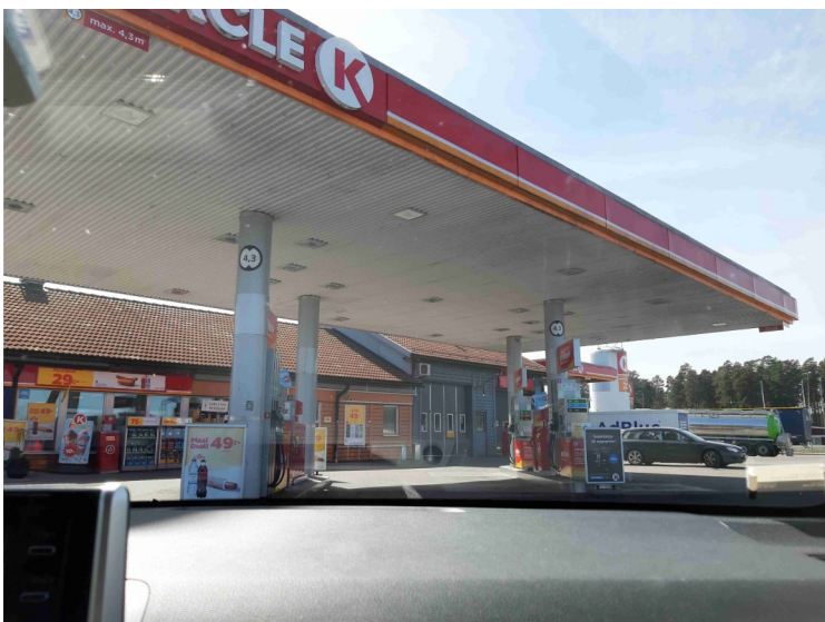
We filled up with gas before driving back. The petrol here cost just SEK 16.44 compared to over NOK 19 in Norway. The currency is almost the same at the moment.