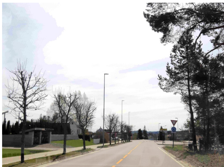
Then we reach Skotterud .