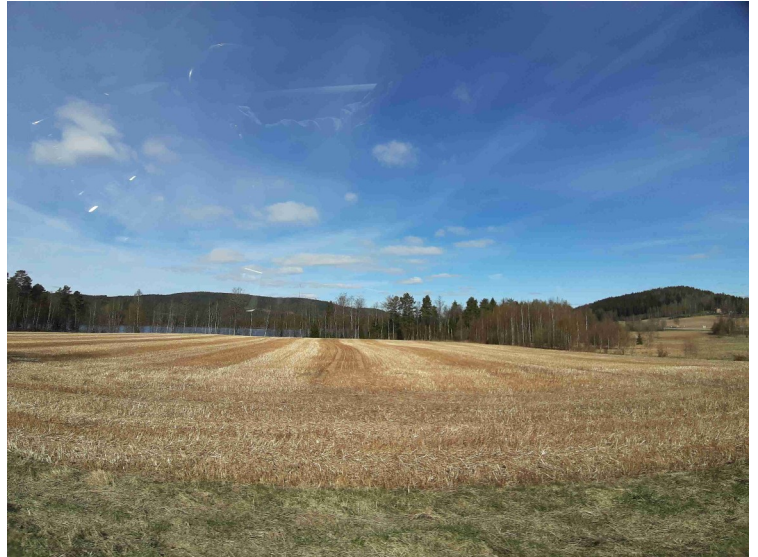
There are still stubble from last year.