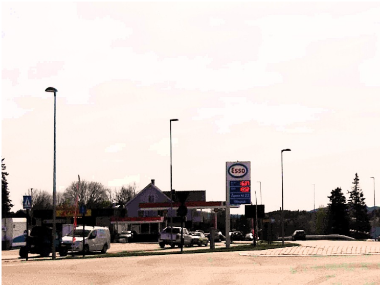
Gas station in Skotterud. Skotterud is the administrative center in Eidskog municipality.