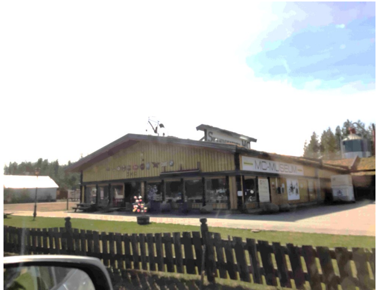
This is Skandinavisk Motorcykel Center . Here there is a museum with vintage bicycles, workshop, shop, cafe, etc.