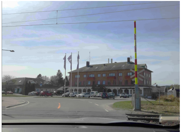
The main building at Magnor Glassverk.