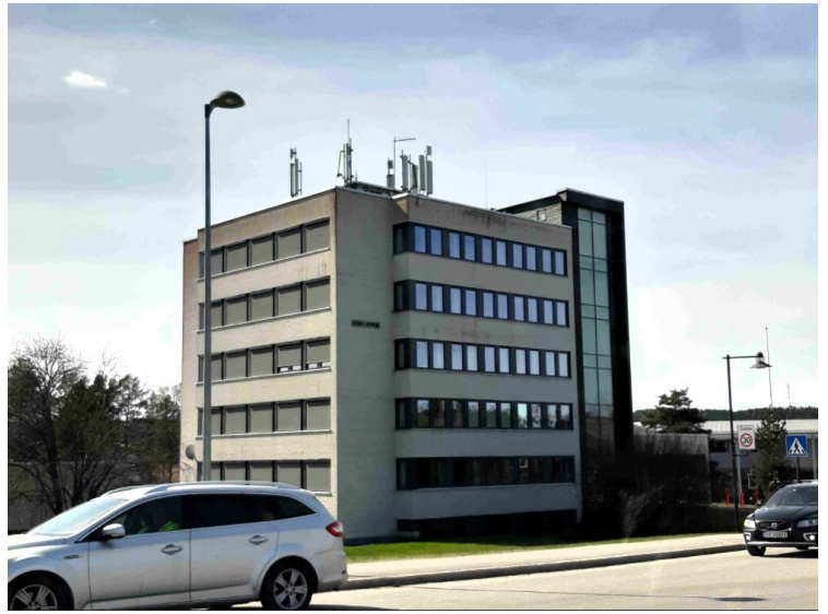
The town hall in Eidskog . It is located in Skotterud.