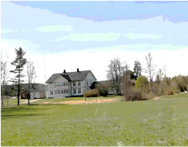
Just south of the center on Magnor we see Maridal Gård. Maridal Søm is located there. They are specialists in everything to do with undergarment production.