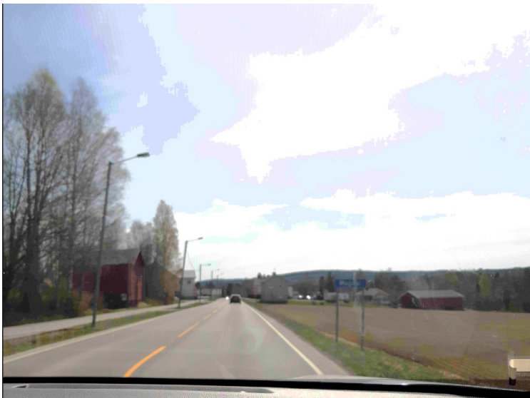
Then we are on Grensevegen towards Magnor . Straight road ahead.