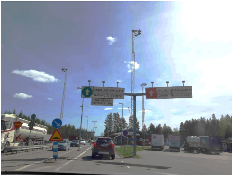
Then we have passed the border and drive through the customs station in Eda .