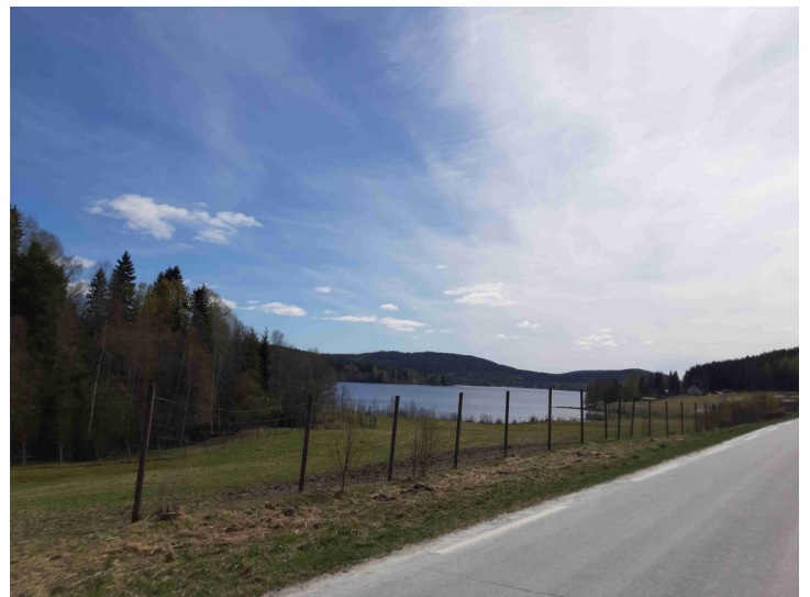
Here we arrive at the west side of Sigernessjøen.