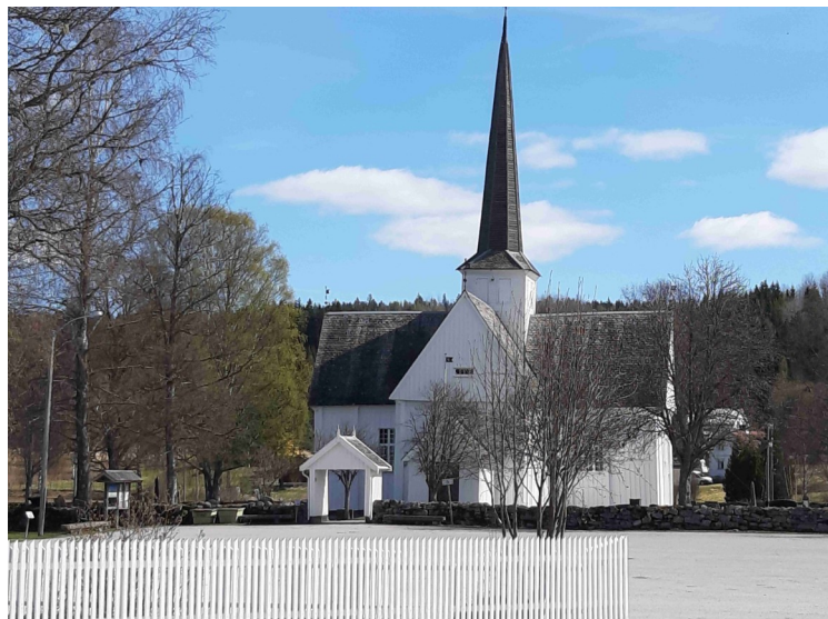
Eidskog kirke in Matrand .

The church was built in 1665, but there have been churches here since the 11th century.