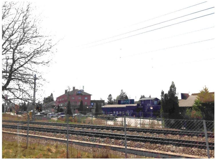
Magnor and Magnor Glassverk . The company's homepage . The glass factory was established in 1896. In the beginning, mostly utility glass was produced, but eventually a number of designers have contributed to the product range.