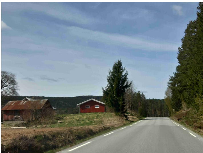
Here we are at Bergersrud.