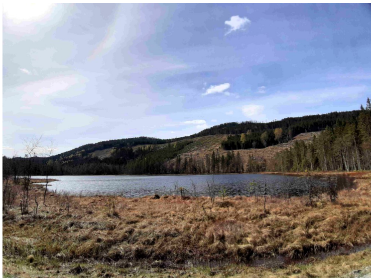
Motjennet at Matrandvegen.