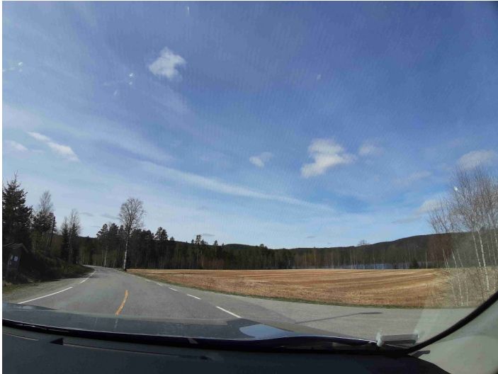
We drove a short distance on the main road until we reached Rauhallavegen.

The main road is Highway 2, which runs between Elverum , along the east side of the Glomma , through Kongsvinger to the Swedish border just north of Charlottenberg. South of the border, the road is called Highway 61. Between Kongsvinger and the border, the road is called Arkovegen. It got that name in 1971 because it runs between Arvika and Kongsvinger .