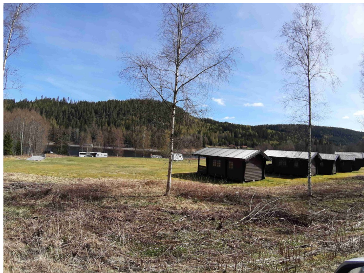
Here we come to Sjøstrand Camping at Børslungvegen at the south end of Sigernessjøen.