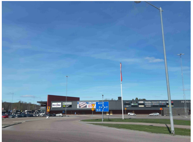
We are going to Charlottenbergs Shoppingcenter . It was built by Olav Thon in 2005-2006. The center has over 50 shops and restaurants.