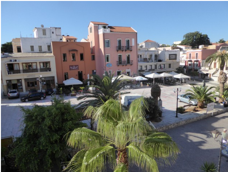
This is the cathedral square, Plateia Athinagora .