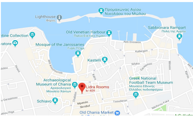
The hotel is called Lidra Rooms and it is located centrally in the old town.