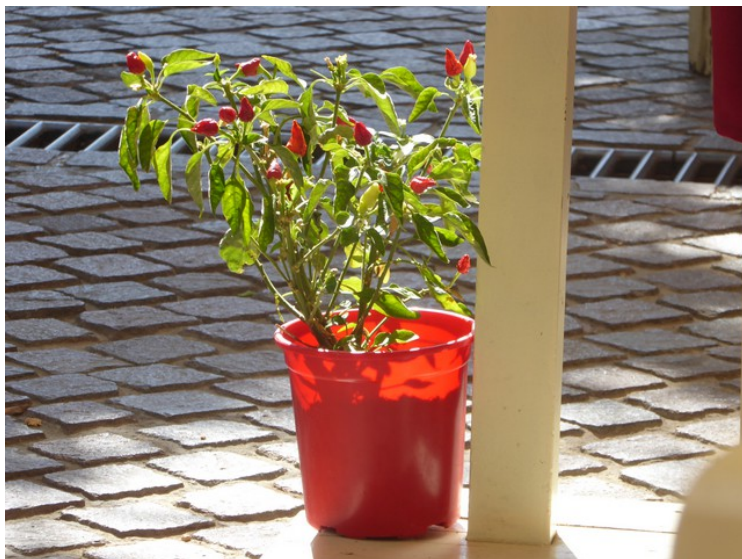
Chili plant as decoration.