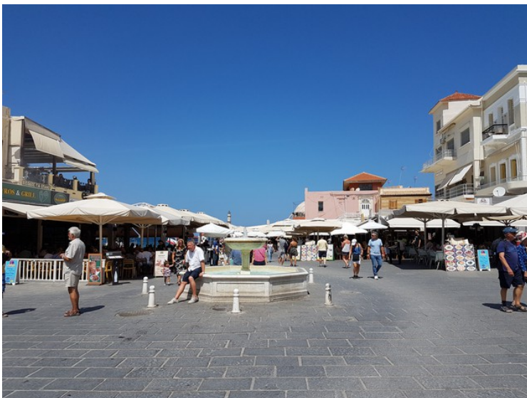
This is at the Sintrivani square by the harbor. There is a fountain in the middle of the square.