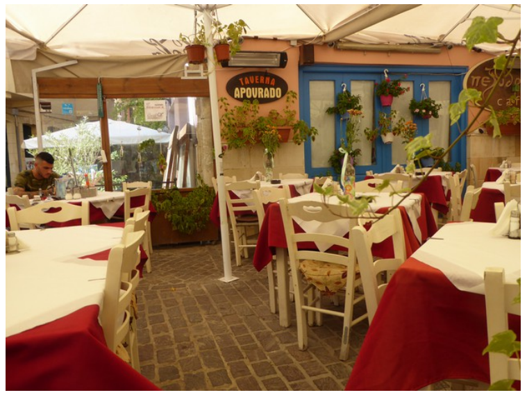
We also ate sometimes at Apovrado which was right next to our hotel. The food here was not so much to brag about, but it was a short way to go.