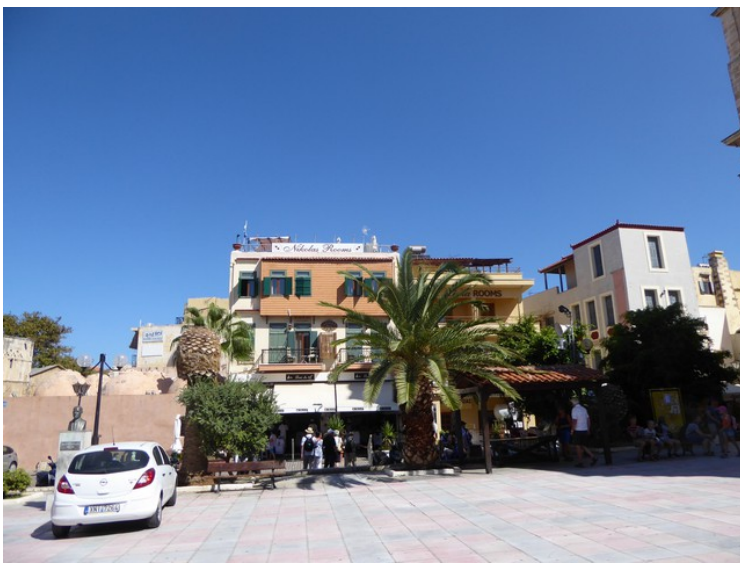
While I was waiting for the breakfast, I took a picture of the cathedral square, Plateia Mitropoleos (Plateia Athinagora) . Our hotel is partially hidden by a palm tree.