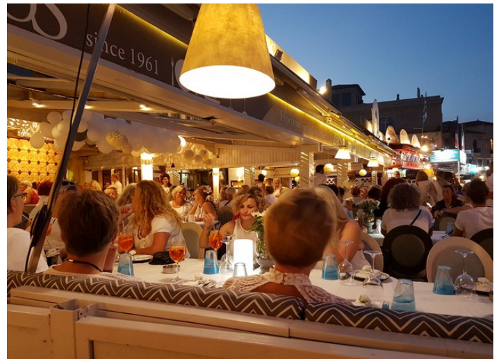
In the neighboring restaurant there were a group of ladies who would celebrate that it was a year since they had gone to school together here in Chania.

We were early that evening and we sat down at Korali because it looked like the chairs were good to sit on. There were no more guests while we were there, but all the neighboring restaurants were filling up. We thought it was weird, so we checked on Tripadvisor. There it has got awful reviews, so that was probably the explanation. For our part, we thought the waiter was nice, the food was good and the chairs were good to sit on. We ate fish. It is expensive in Greece so we were not surprised that it was the most expensive dinner we ate when we were in Chania this time.