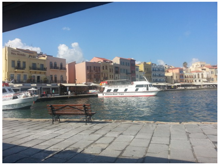
View across the harbor as seen from Taverna Kavouras.