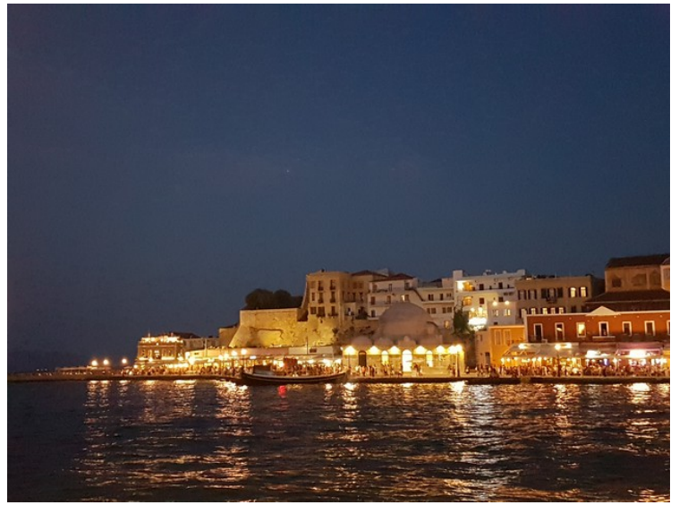
Finally a few evening pictures before we left the restaurant.