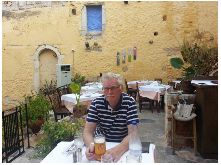
Here I have got a beer.