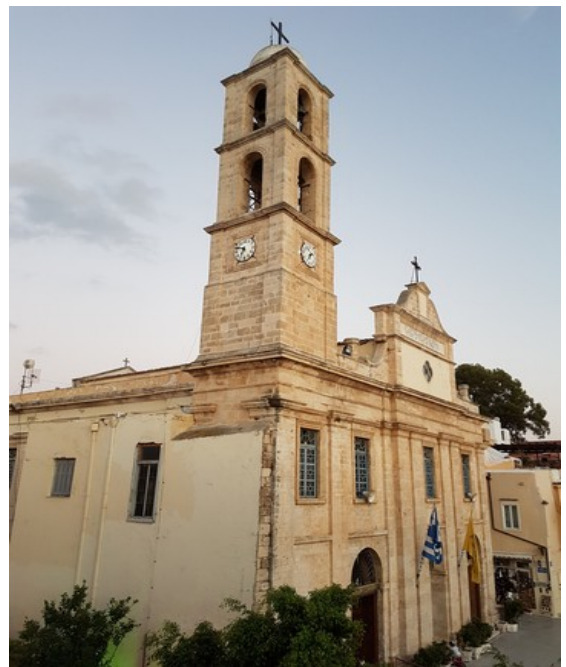
The hotel is located just beside Chania Cathedral .