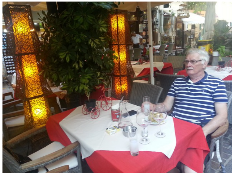
Here we are at a restaurant which is called The red bicycle .