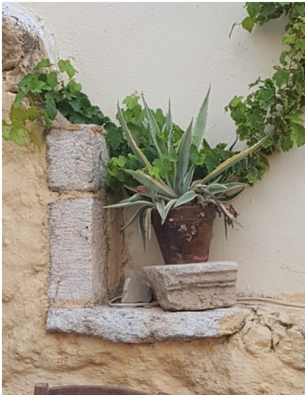
Decoration at Tholos restaurant.