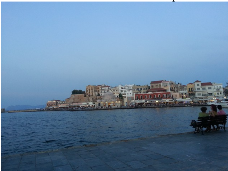
The sun went down eventually.