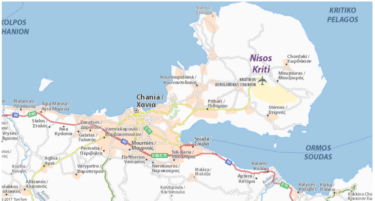
The airport in Chania is located at the Akrotiri peninsula.