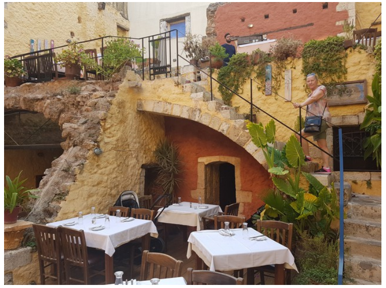
It is housed in the ruins of an old Venetian building.