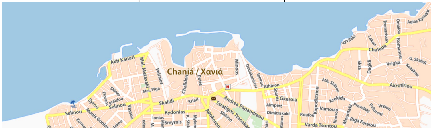
We chose to stay in the old town this time.