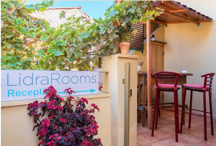
The reception is quite simple. It is outside with just a little roof over.