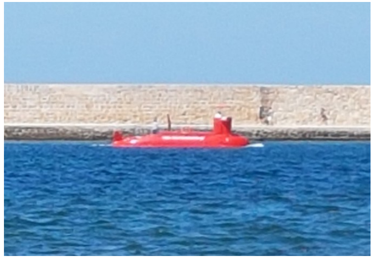
We took a few pictures while we drank the beer.