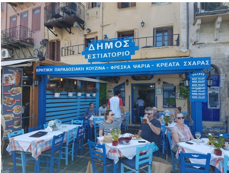
The restaurant is called Demos.