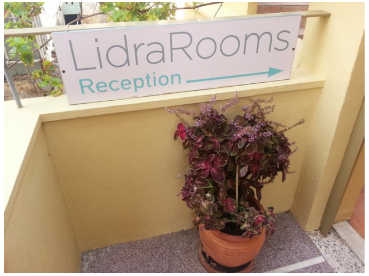
This is into the reception where we stayed.