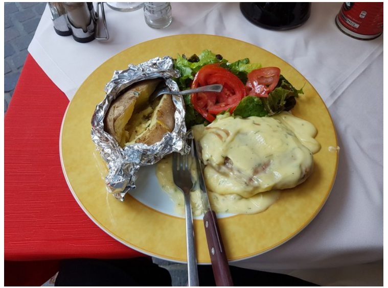
I had a steak with Bearnaise sauce. That was good too.