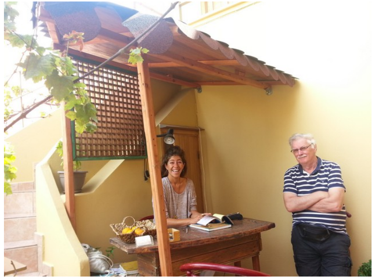
We paid the bill the day before we went home again.