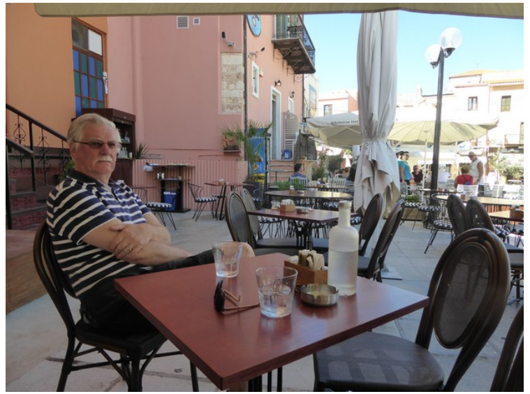
Here I'm waiting for my breakfast.