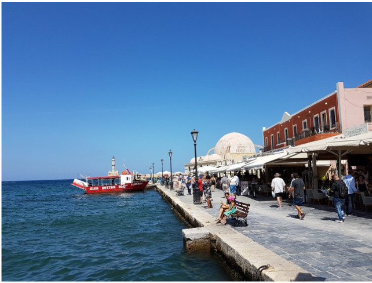
Eastern part of the harbor.