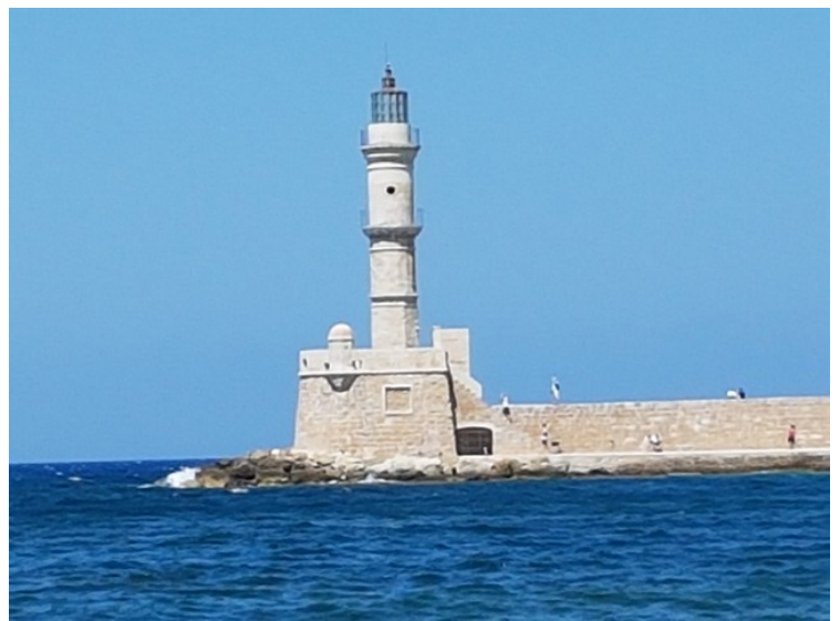
From there there is a view to the lighthouse that is no longer in use.