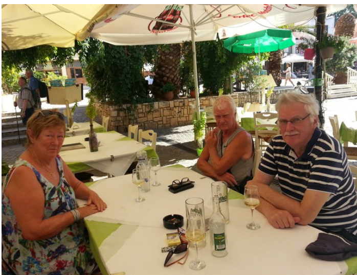
Here we are sitting at the restaurant just outside the hotel.