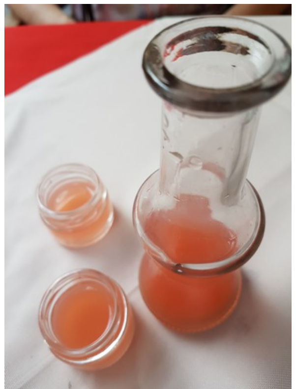
To finish we got peach raki.