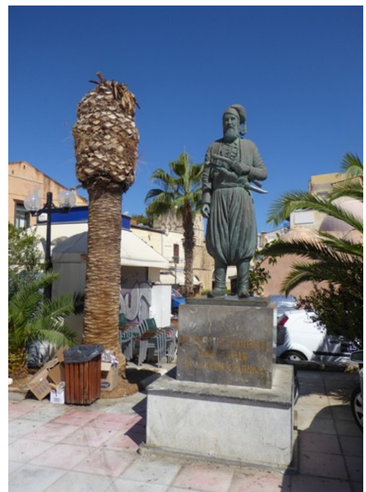
The freedom fighter Agnostis Mantakas .