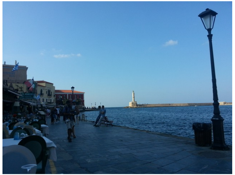
View across the harbor towards the lighthouse.