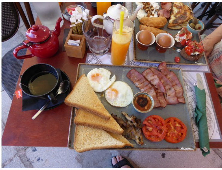
Then we got the breakfast. I had English and Anne Berit had Greek breakfast.