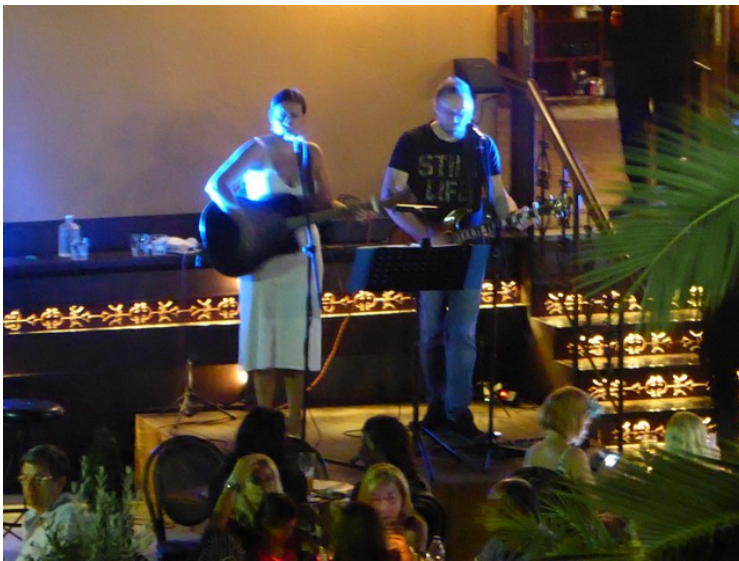
Several evenings there was live music at the restaurant across the cathedral square.