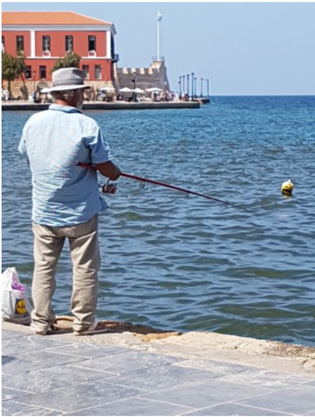
We did not see him catch any fish.