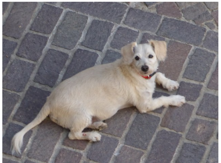
The restaurant dog was 11 years old.