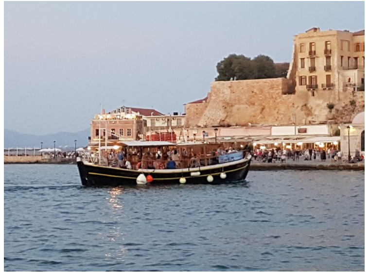
More pictures seen in direction of Kasteli.