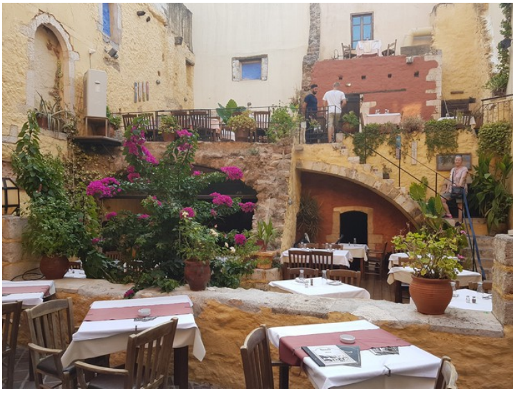
One evening we ate at Tholos Restaurant .