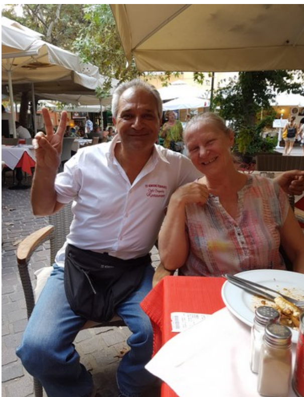
This is the waiter.