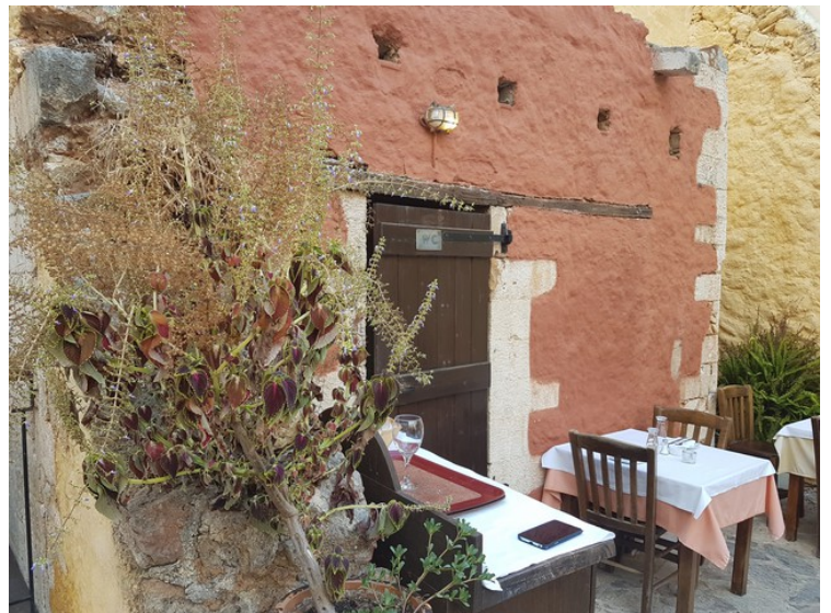
This is the door to the toilet.