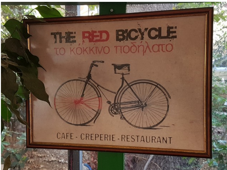
A picture in the restaurant.