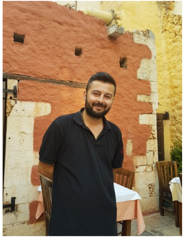
We were welcomed by one of the staff.