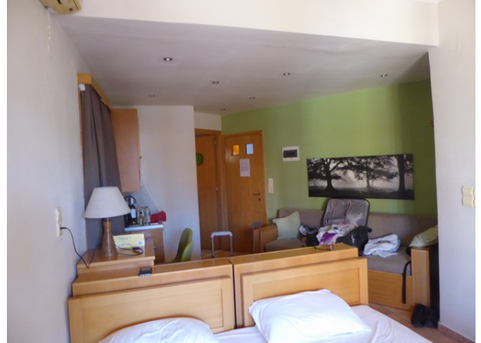
This is inside the room.