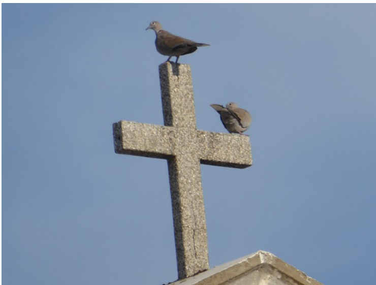
Many pigeons in the town.