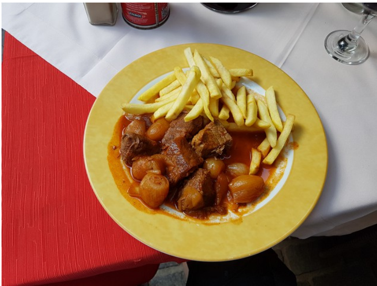
We ate at the sane restaurant the next evening also. Then I had Stifado .