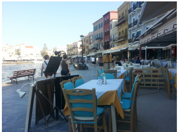
View across the harbor.