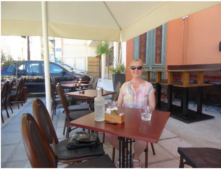
We ate breakfast a couple of times at the cafe located across the cathedral square. It's called Typografeion .