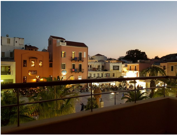
Evening picture from the balcony.