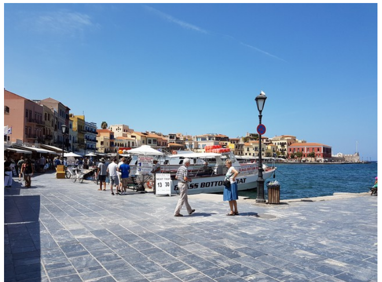
This is the western side of the harbor.