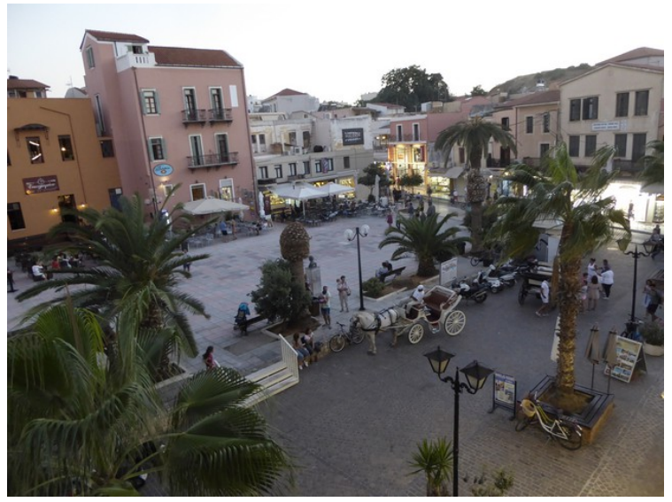
A couple of pictures taken from the balcony.