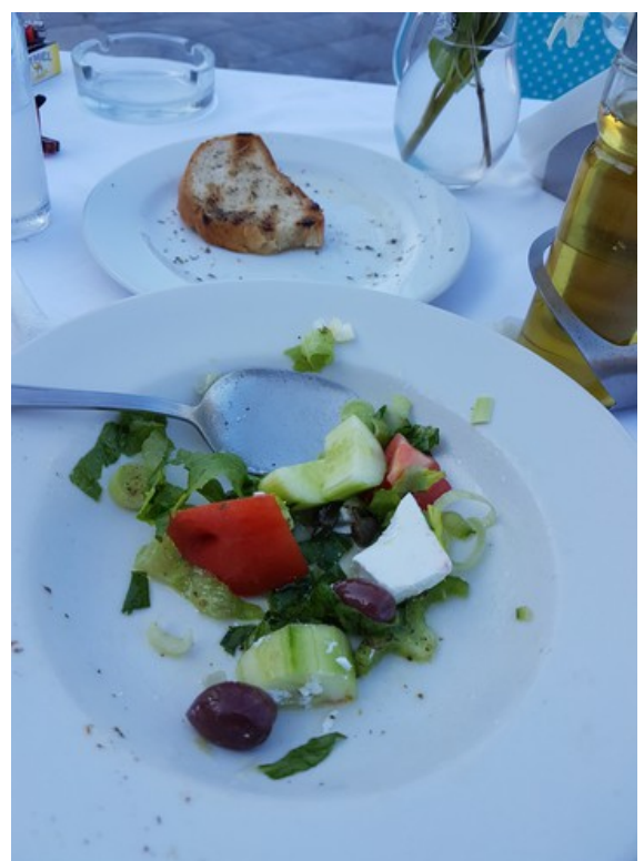
Then a Greek salad. Then we had fish ( Dorada ). It was very good.