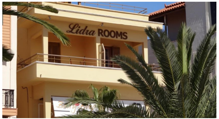
We had the room on the left.