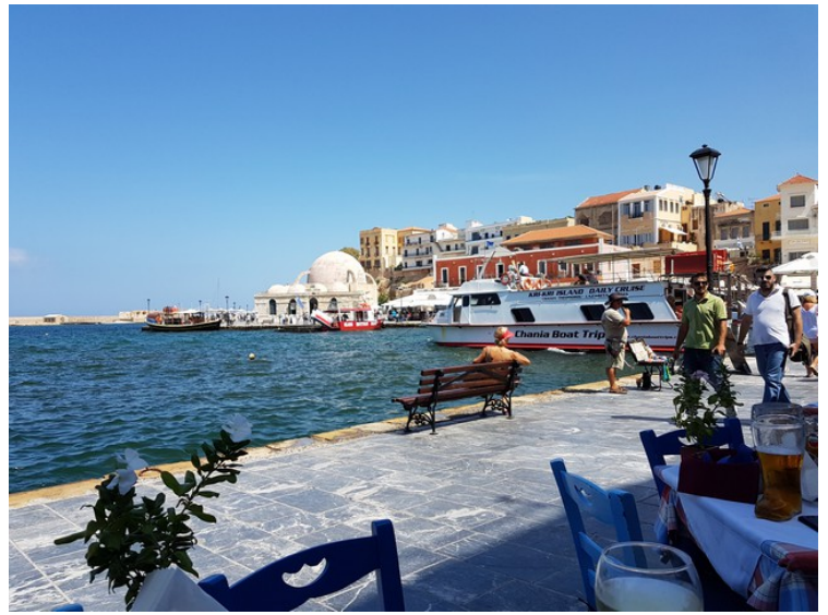
Here we have walked west along the quay and sat at one of the restaurants there.