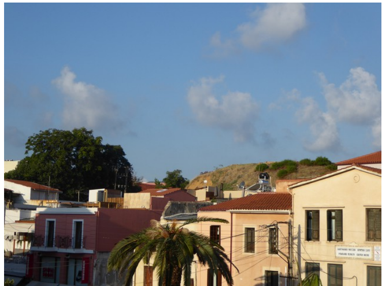
Here we see from the balcony towards Schiavo which was part of the fortifications around Chania.