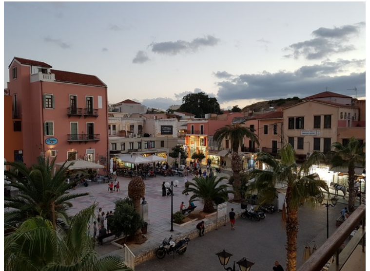
That's how it looks in the evening.