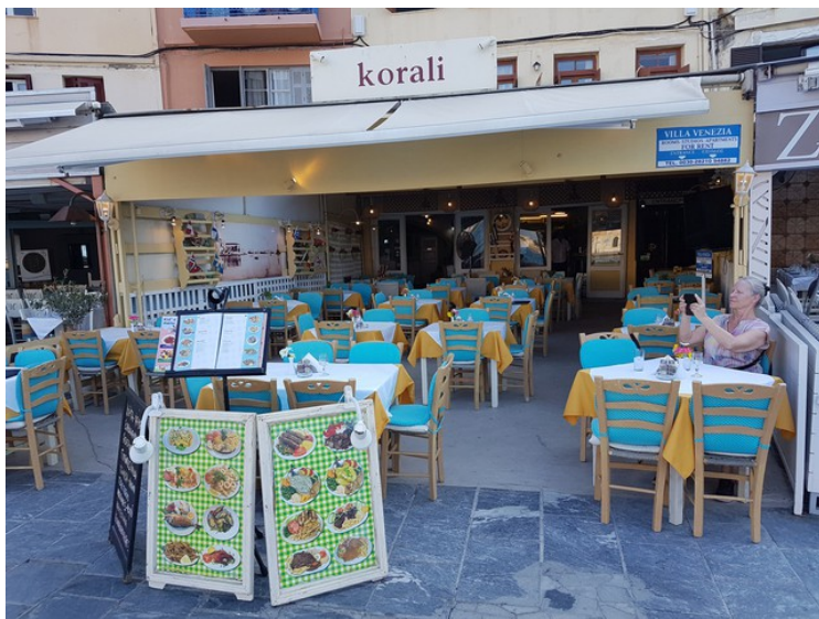
Another evening we ate at Restaurant Korali .