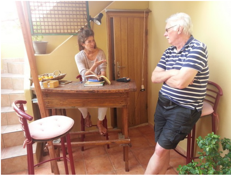
In the reception.