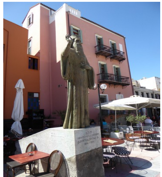
A statue of ecumenical patriarch Atenagoras I, patriarch of Constantinople . The place has been named after him.