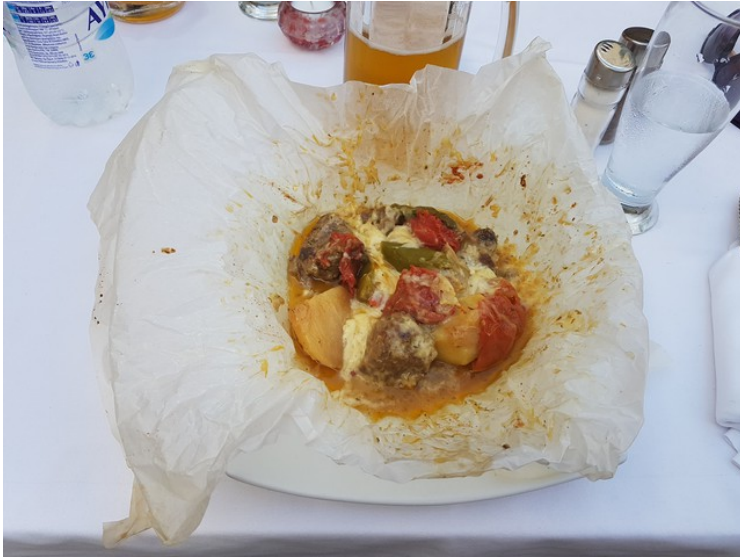
Then the food came on the table. I had Kleftiko which is baked in paper.