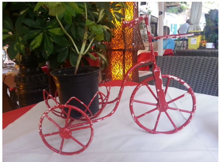
A such bicycles was on all the tables.