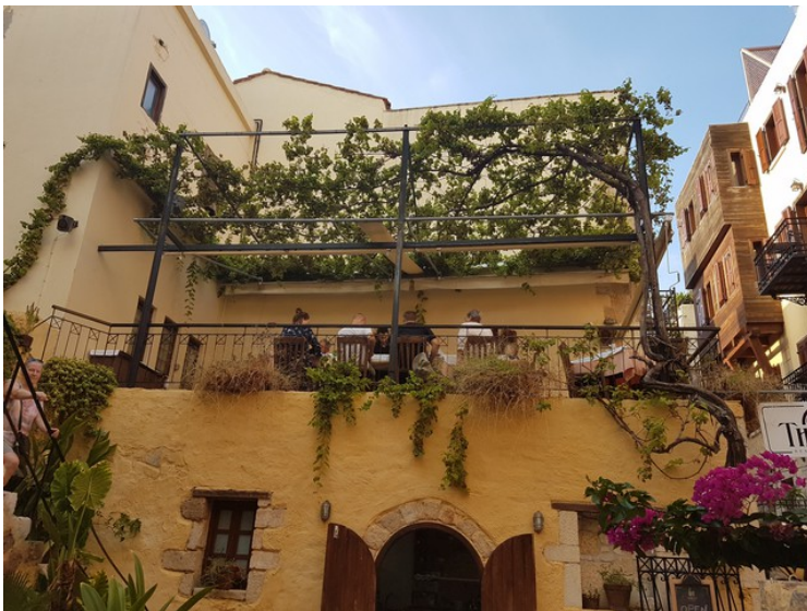
Restaurant in three floors.