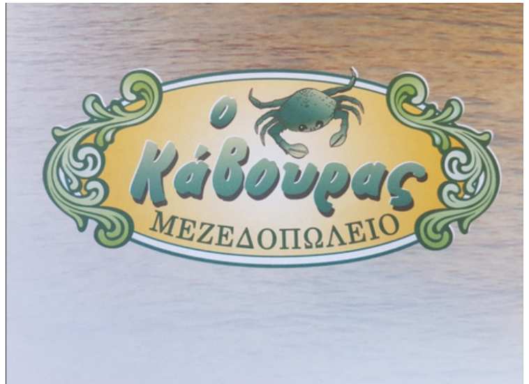
One day we were eating breakfast at a restaurant down in the harbor. It is called Κάβουρας or Taverna Kavouras. That means crab in Greek.