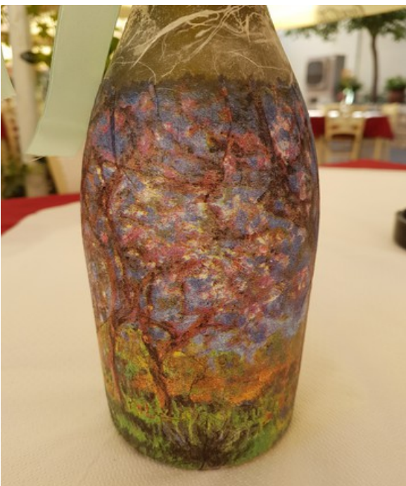
I took a picture of one of the vases on Avoprado while I was waiting for the food.