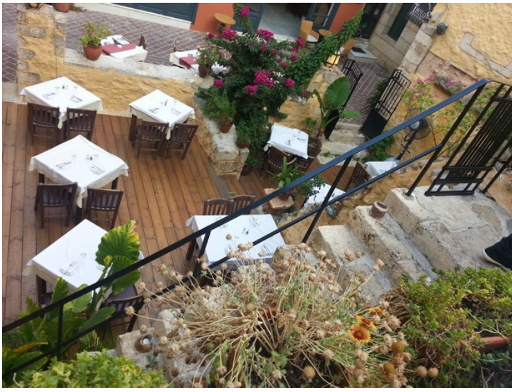
We sat upstairs and could look down.