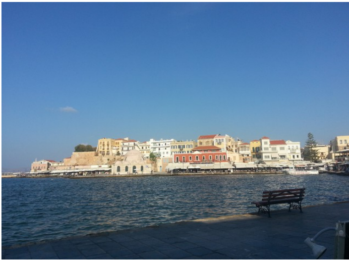
Then some pictures we took while we sat at the restaurant. This is across the harbor towards the Kasteli hill .