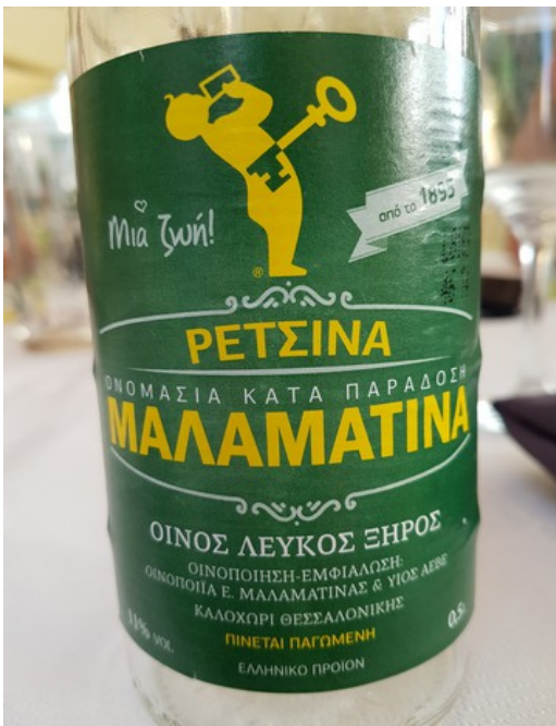
We had a retsina win, Malamatina , which was quite good.