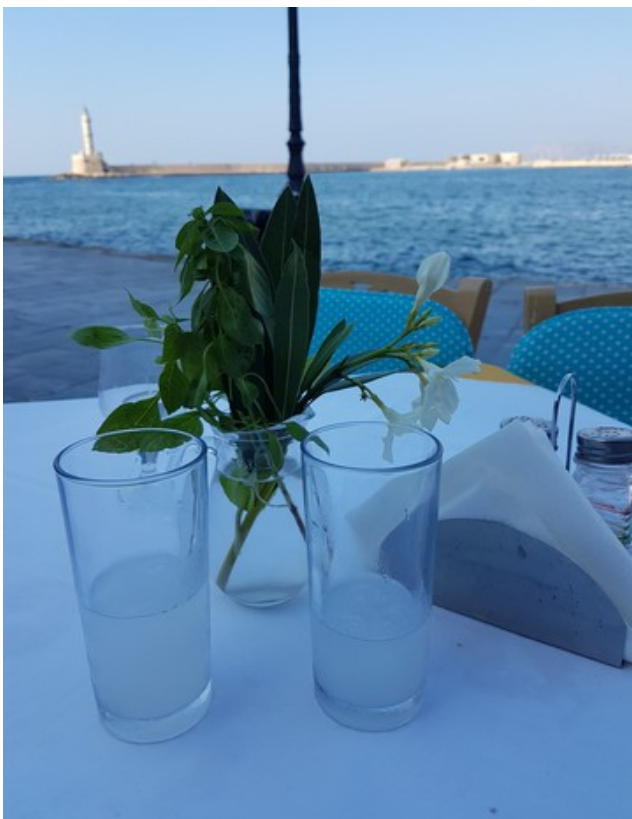
We started with Ouzo.