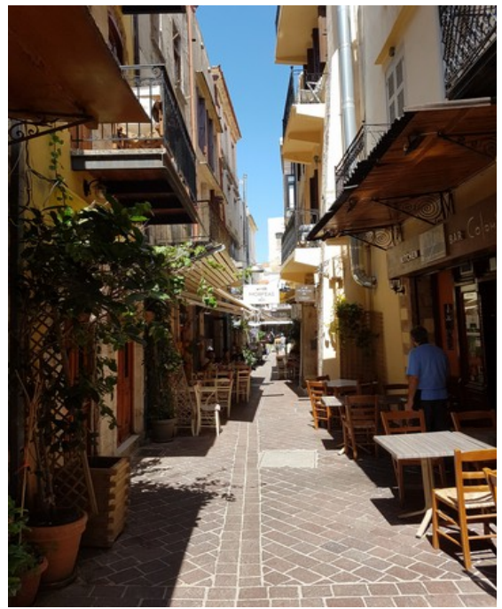
The hotel is located in the middle of the old town and there are many narrow streets here and there are lots of restaurants.