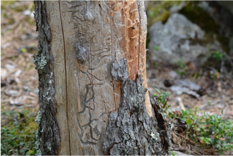
Attacks of bark beetles.