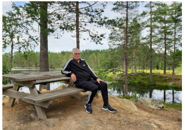
We sit and look at the view before we drive home again.