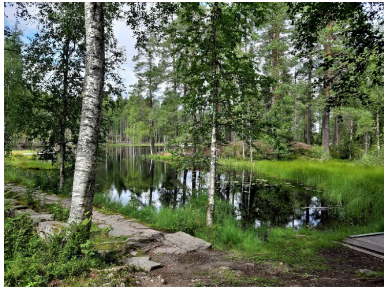
Here we see the dam and the lake inside.