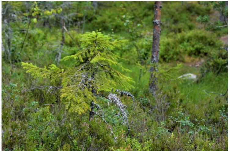
Spruce with lichen.