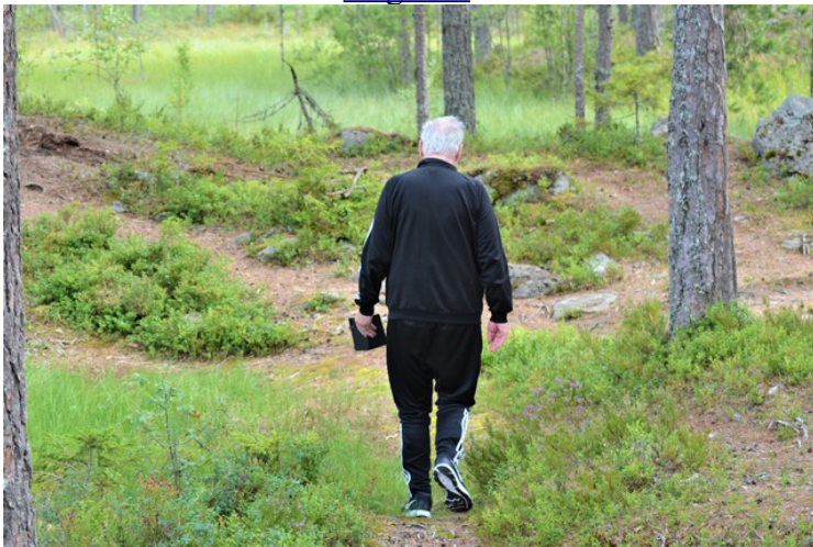
I'm going to take more pictures.