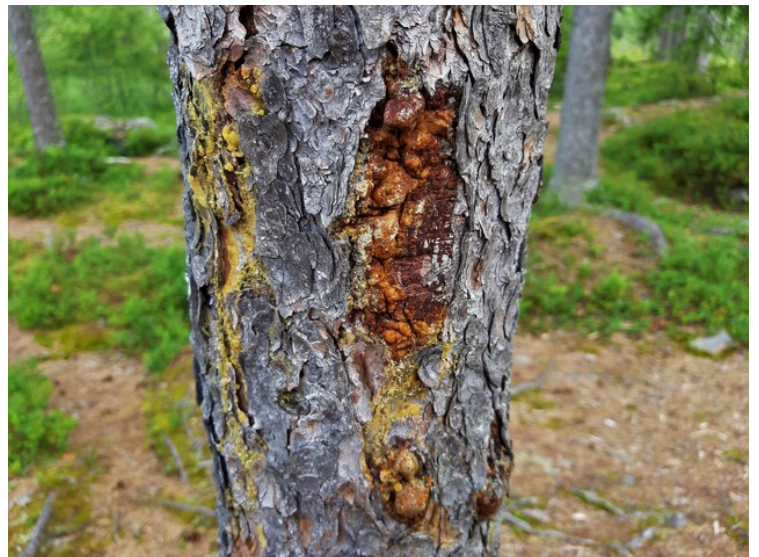
This is resin .