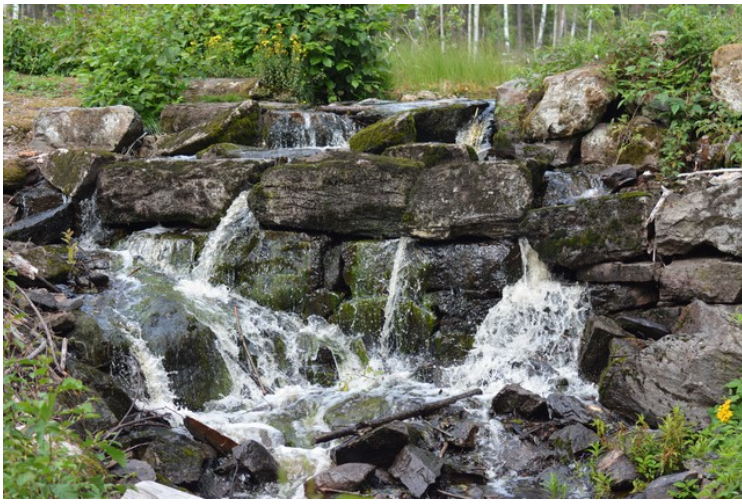
Overflow in the dam.