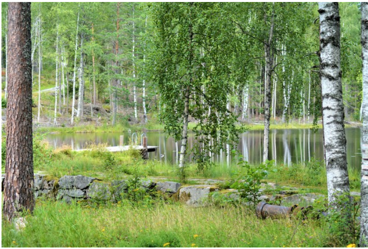
This is the bathing jetty.