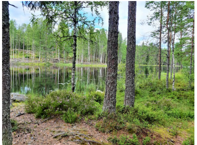
Below are various photos from the area around the lake.