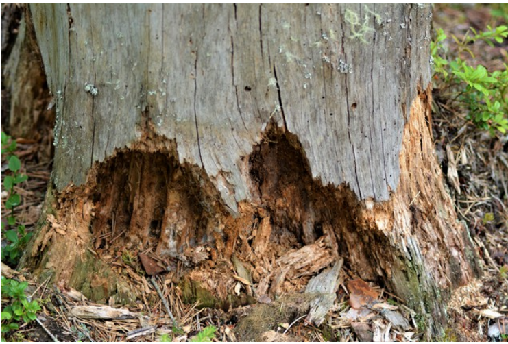
The woodpecker has been here in this rotten tree.