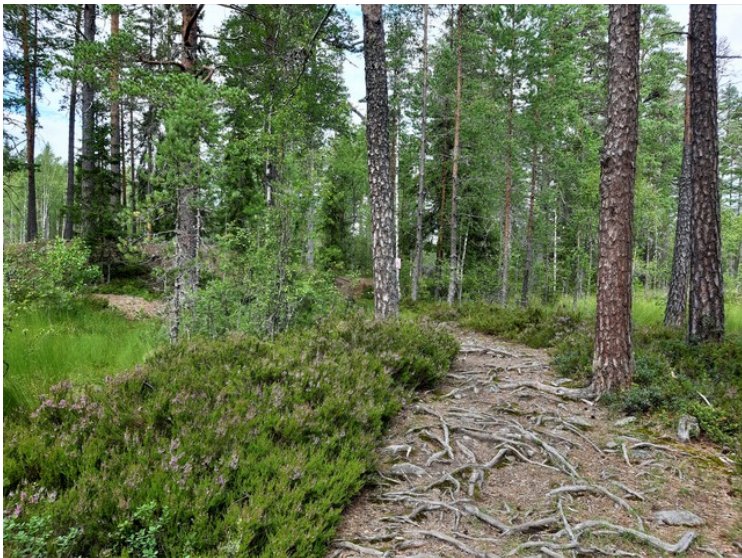
Paths are made when people travel in the area.