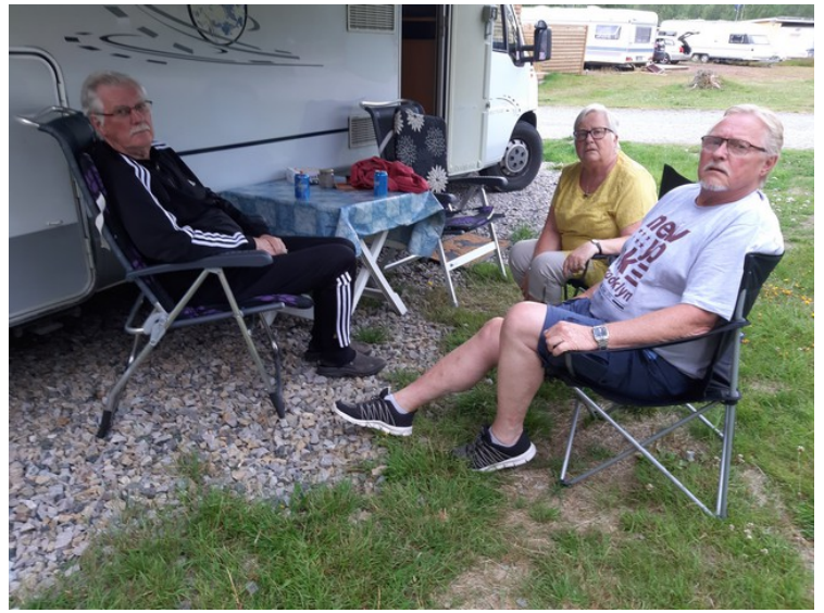
The next day, we were visited by Bjørn and Pia. We ate char in the restaurant at Villmarksenteret.