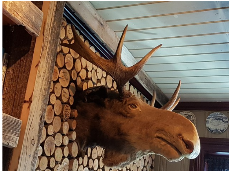
Before we left I had to have a picture of the moose inside.