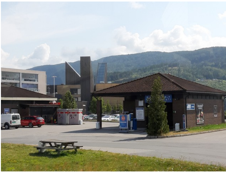
This is part of the Hydro Park in Notodden. At the rear we see Notodden Cinema.