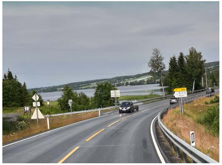
North of Lygna we pass Einavatnet .