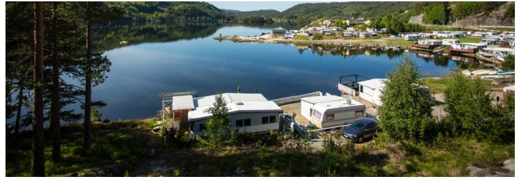
The next stop was at Bornes Camping just south of Eyje .