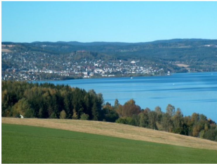
We drove through Gjøvik .