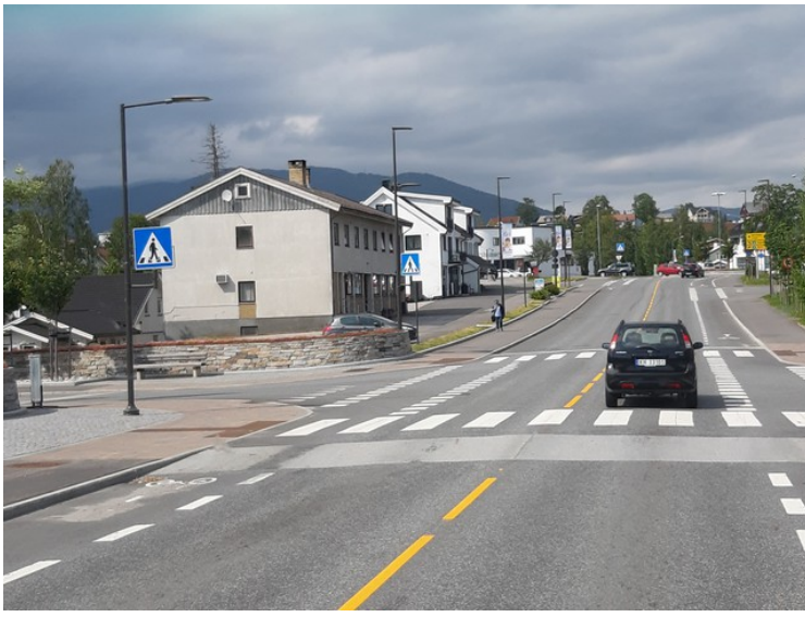
This is in the outskirts of Notodden .