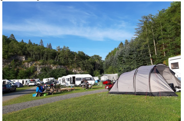
Some pictures from the place.