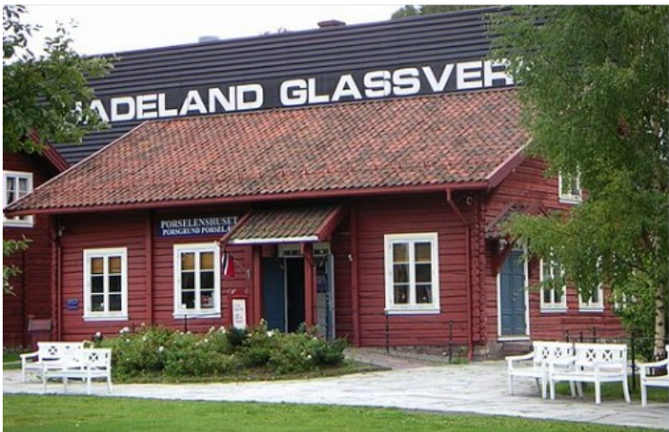
The next stop was at Hadeland Glassverk . This is one of the many buildings on the site.