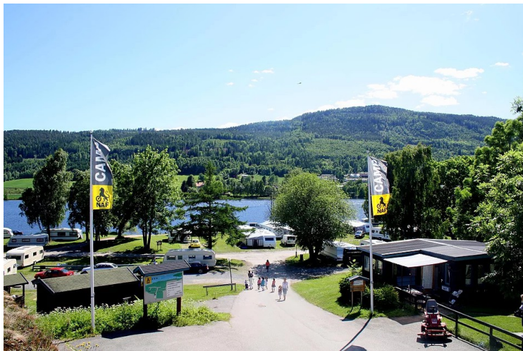
After two overnights at Skasen , we continued on to Drammen where we stayed at Drammen Camping .