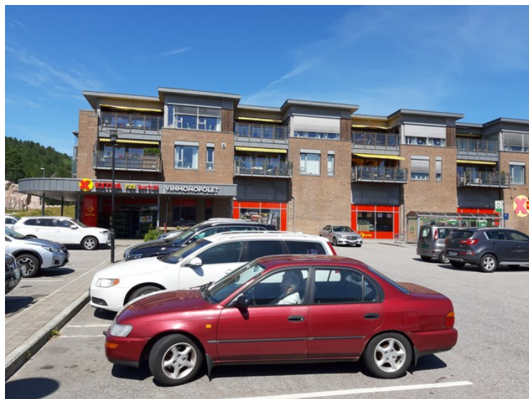
In Tangvall we stopped to buy some provisions.