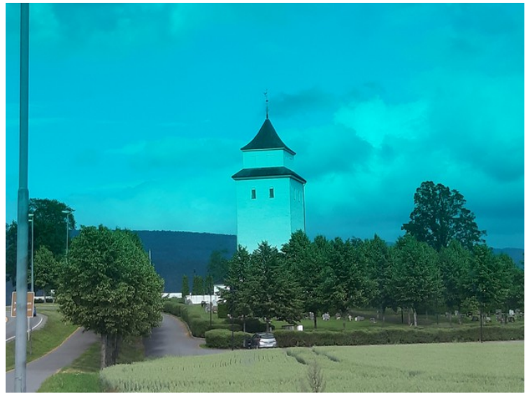
Our destination today was Hokksund . This is Haug Church in Hokksund.