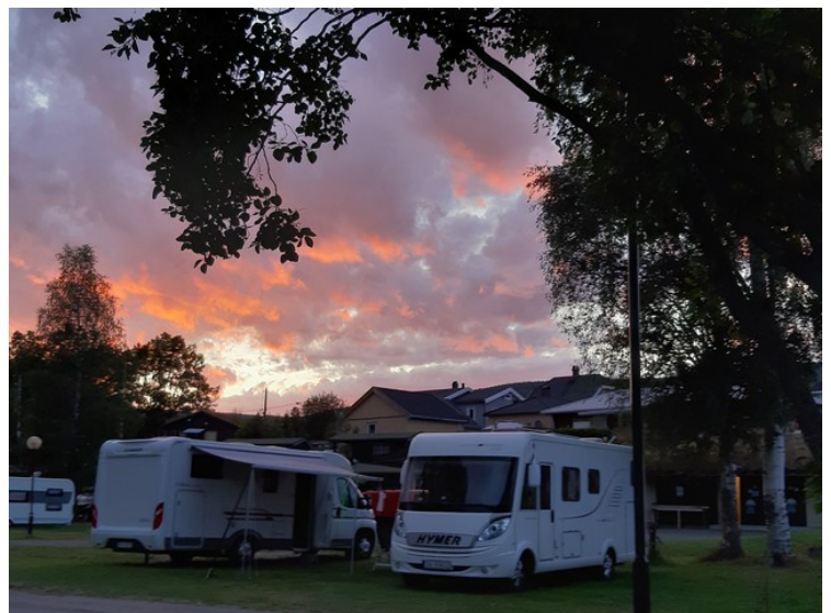
Here we are on the site.