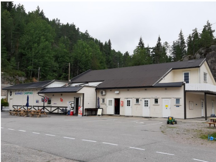
Reception and service building.