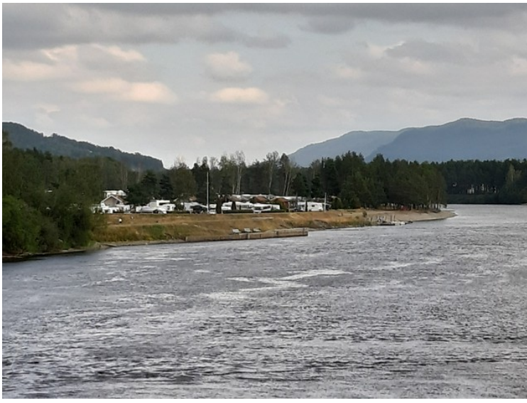
Hokksund Camping lies right by the river.