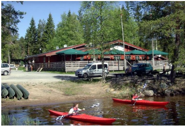
We were placed right behind the main buildings to the left of the picture.