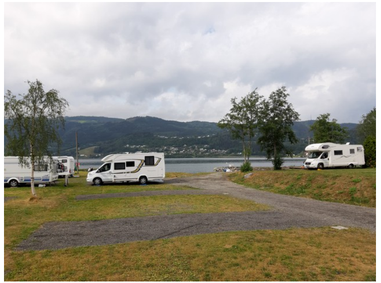
Soon in place.