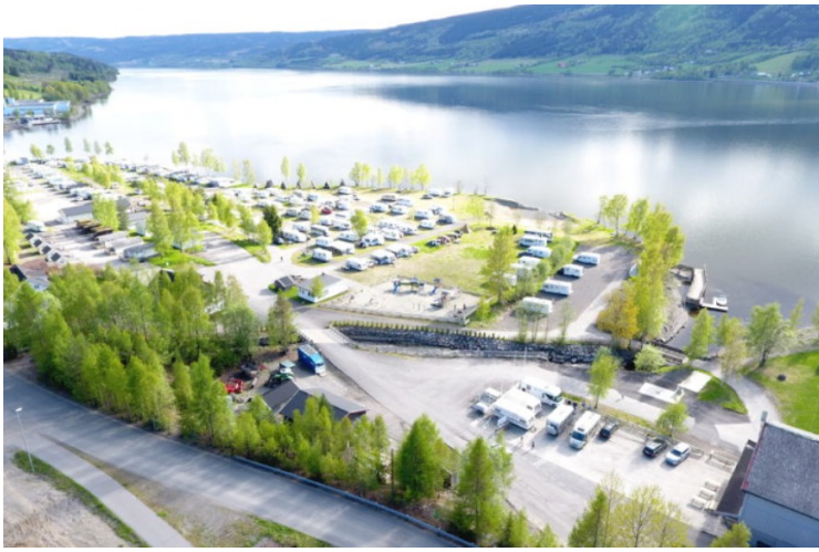
Then we stopped at Lillehammer Camping .