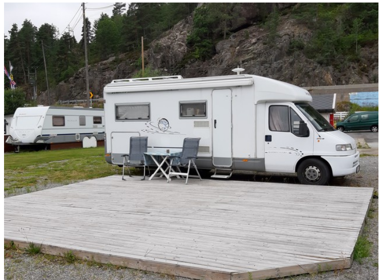
We got a very big terrace.