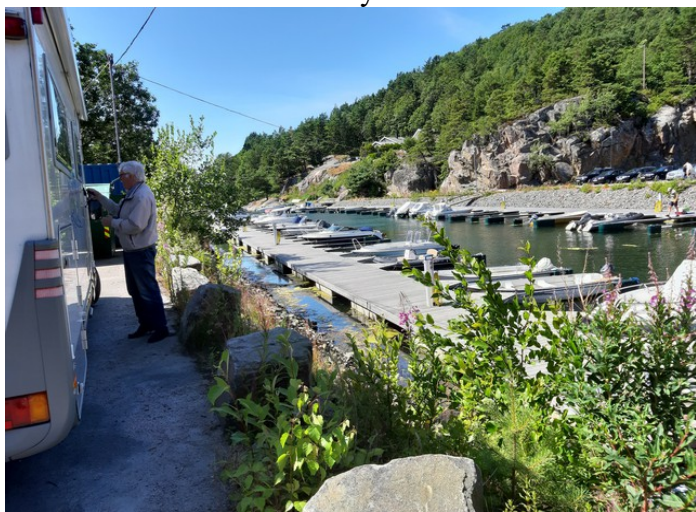
We found a parking space in Prestebukta Båthavn.