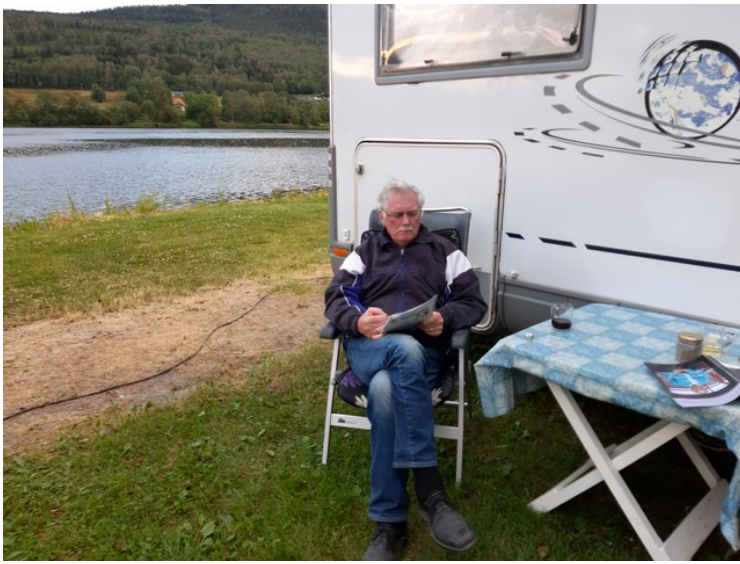
A bit crosswords in the afternoon.