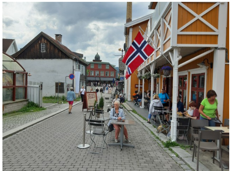
Then I picked up the car while Anne Berit and Solveig waited outside the restaurant.