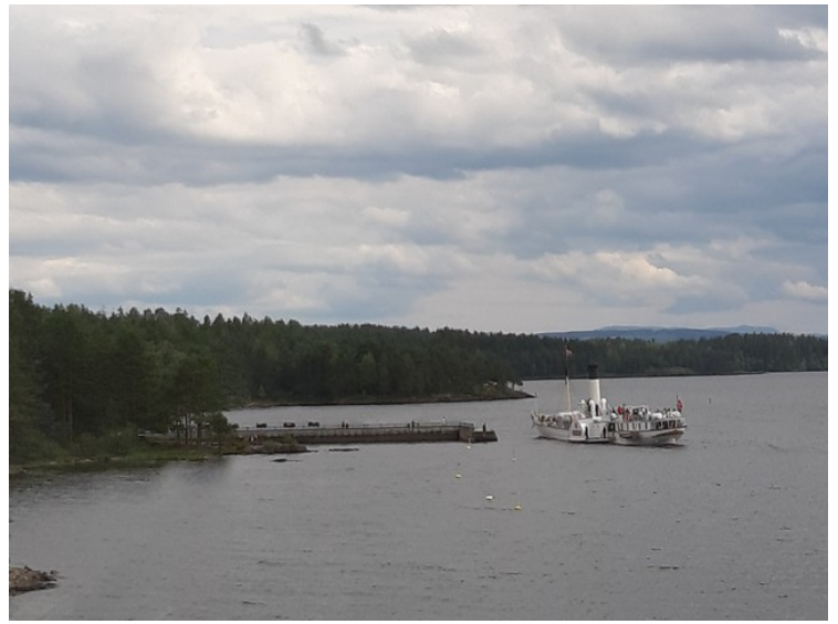
When we were up on the bridge we noticed Skibladner that was going to dock at Moelv jetty.