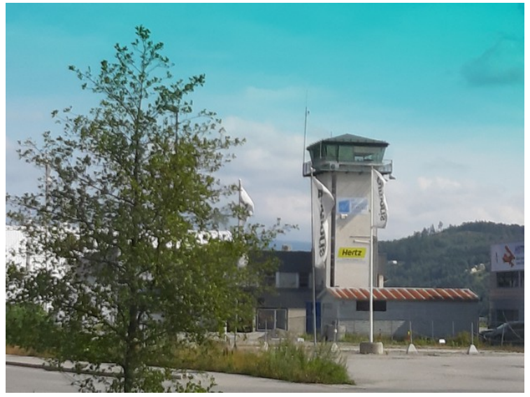
We drove right across the runway of Notodden Airport .