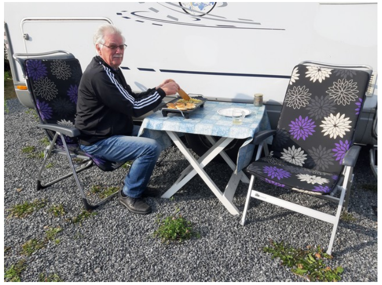
I'm frying onions.