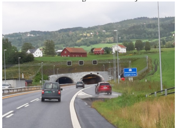
This is the tunnel on the new main road that goes outside Gran .