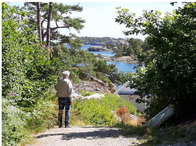
Here we are arriving at the cabin.