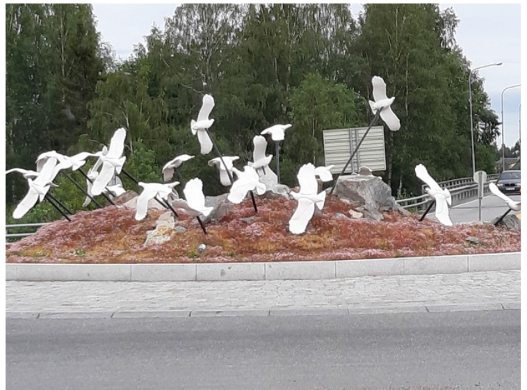
Almost home. Mountain grouses in the roundabout in Skarnes .