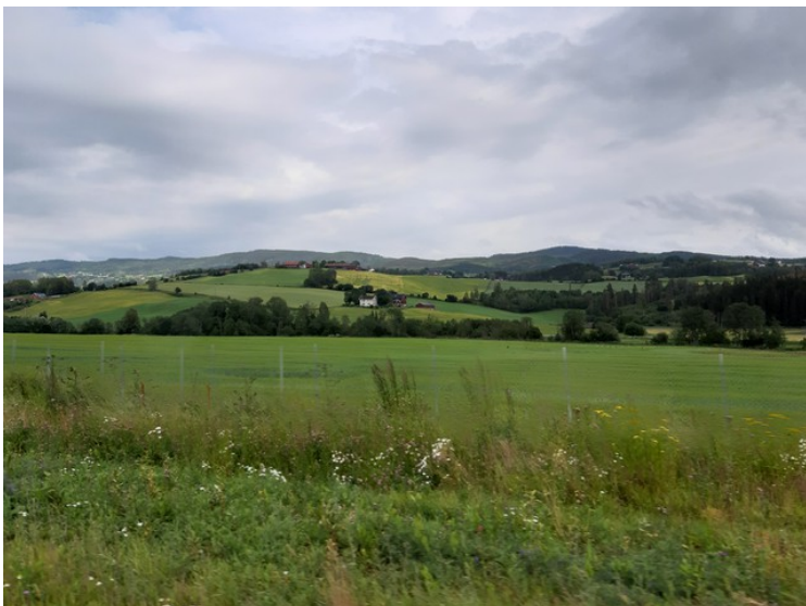
We drove through Hadeland .