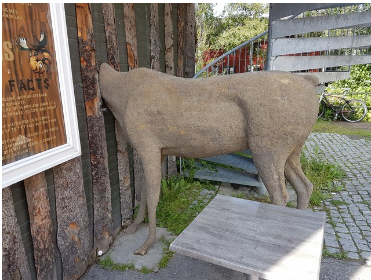
The rest of the moose is standing outside.