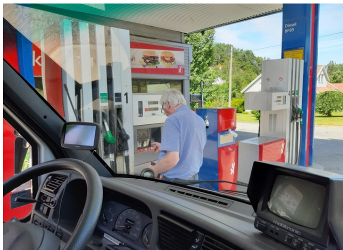
The next day we were to visit my daughter who has bought a cabin in Søgne . Here I refill diesel along the way.