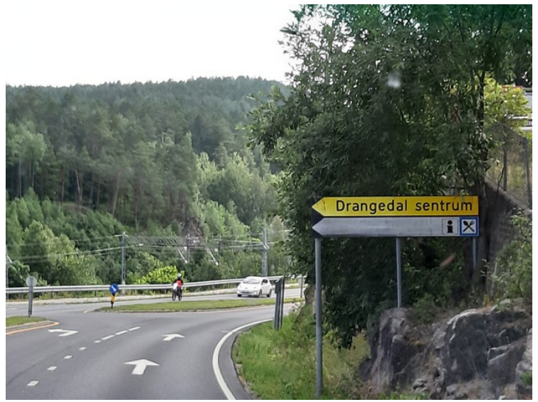
Arriving at Drangedal .