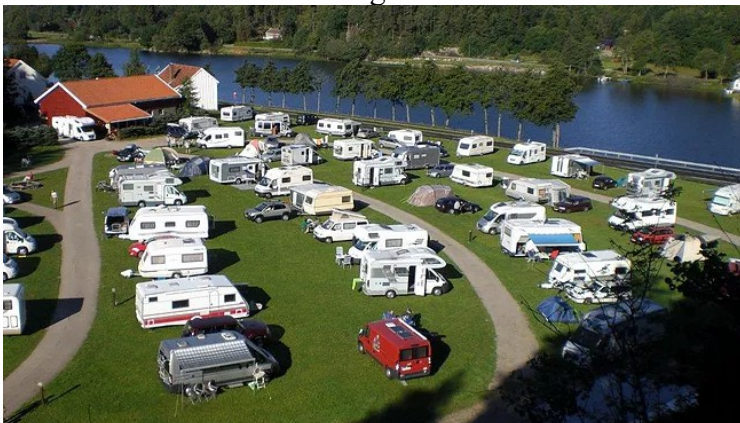
We went to Sandnes Camping outside Mandal .