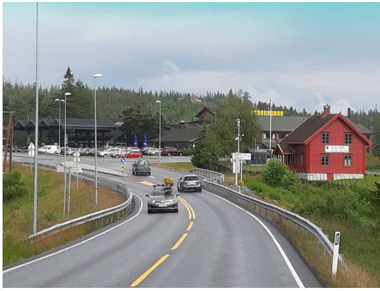
This is Lygna , which is at the highest point on the road that runs between Hadeland and Toten .