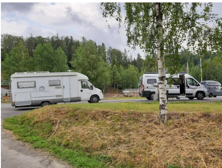
The next day we continue.