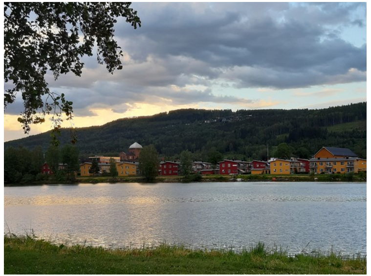
Some views from the site in the evening.