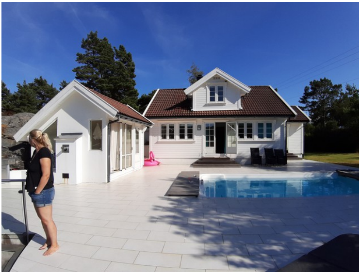
The cabin with annex and pool.