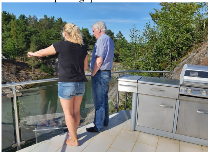
Looking at the view.