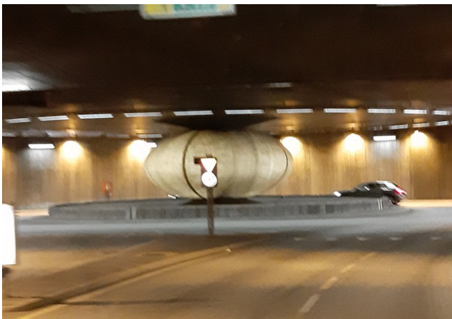
The next day we drove through a roundabout in the tunnels through Drammen.