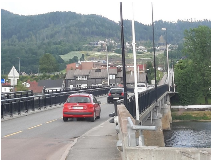
The bridge that crosses Drammenselva .