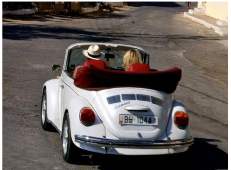
But first we visited Asbjørn and Rigmor Mythen. I stole this picture from their Facebook page.