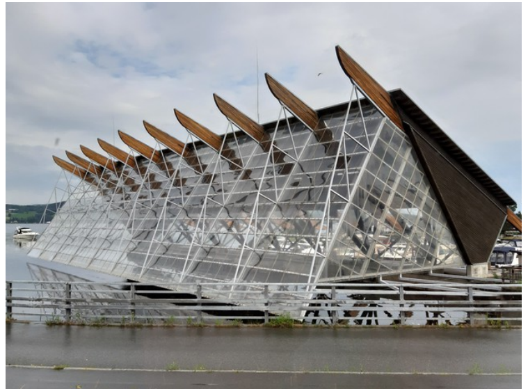
In Gjøvik lies this glass house where DS Skibladner is kept during the winter.