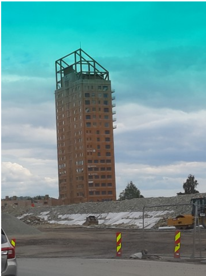
This is Mjøstårnet in Brumunddal . It will be the world's tallest wooden house.