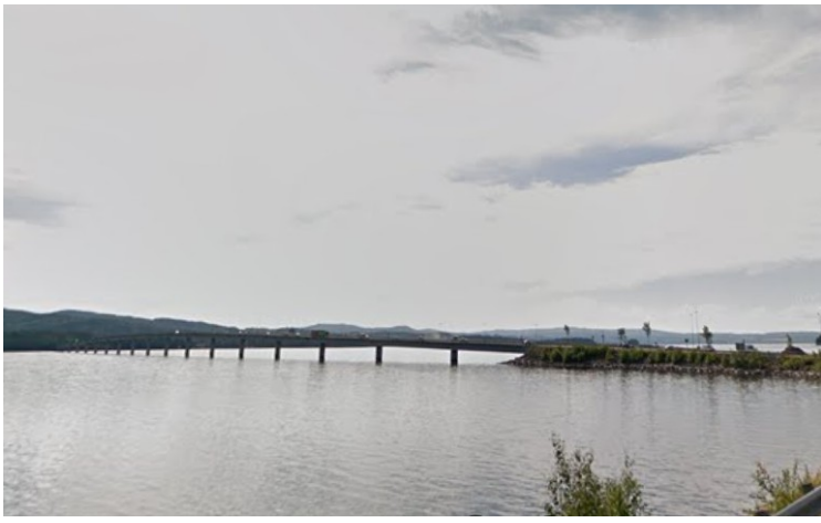
On our way home we crossed over Mjøsbrua .