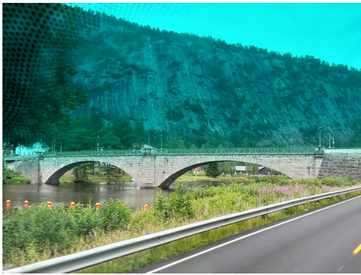
Here we are passing Åmfoss bru in Åmli . It is one of the longest stone bridges in northern Europa. It crosses Nidelva which flow into the sea at Arendal .