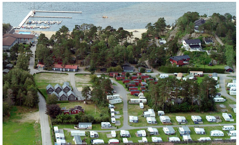
We drove to Åros Camping . There it was almost full and the places they could offer were so bad that we drove on.