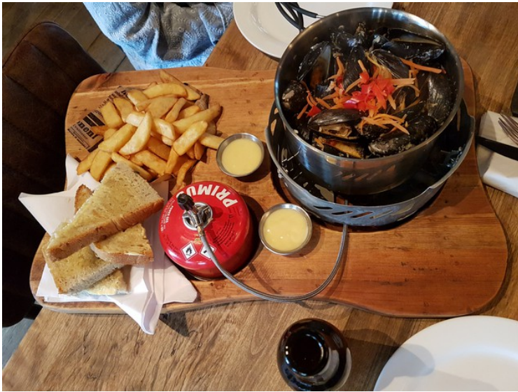
I and Solveig shared a mussels casserole.