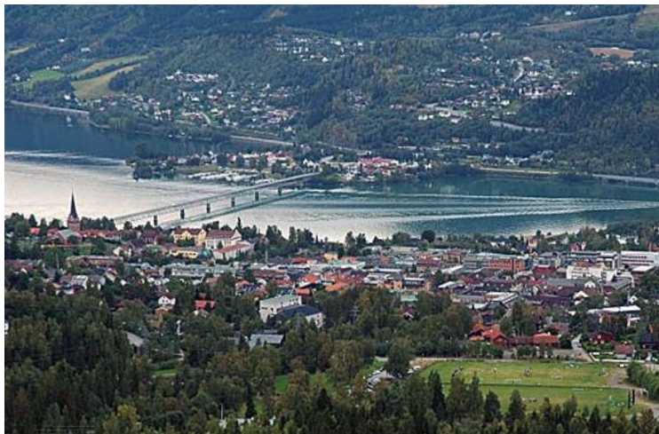
The last stop this day is in Lillehammer . We have planned to go to Lillehammer Camping.