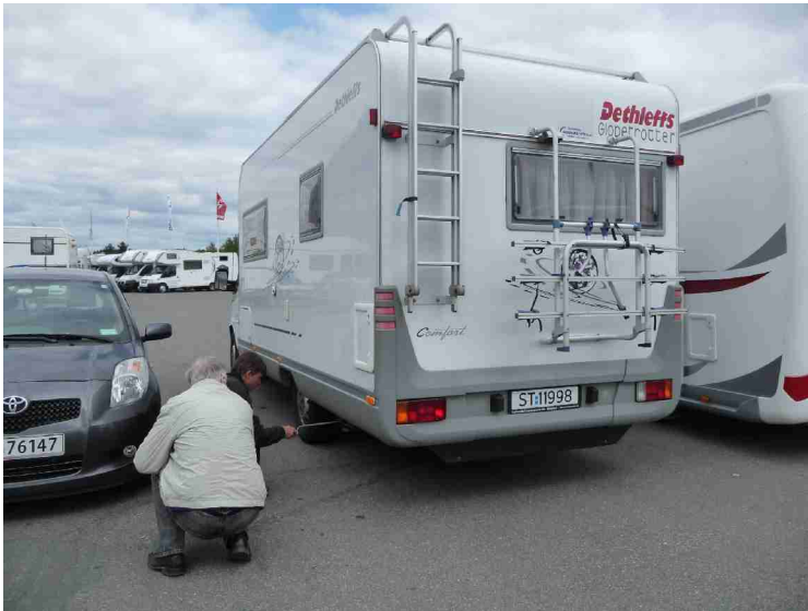
Empty the "gray water" tank.