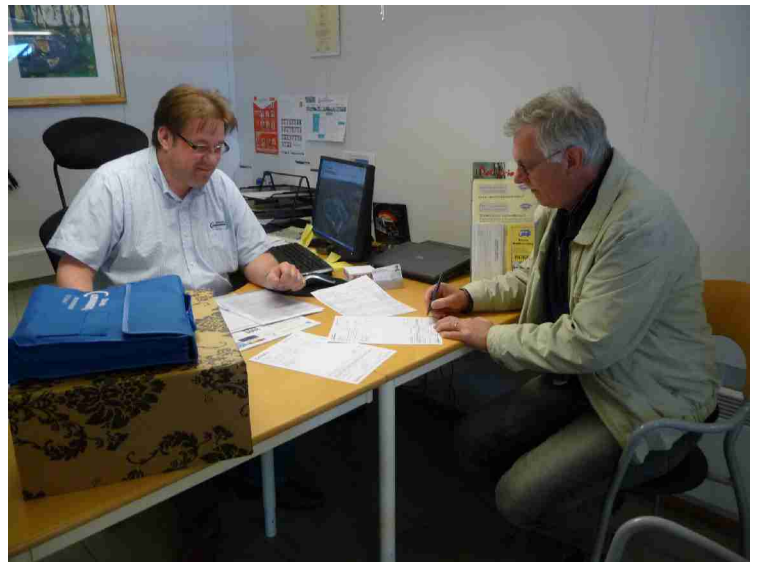
Signing the purchase kontrakt.