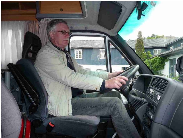
Finally ready to go.