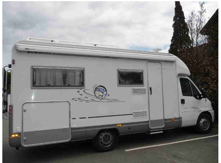
Outside Grimstad Vertshus.