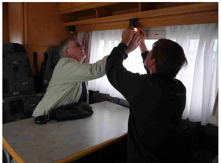
Here was a light bulb finished.