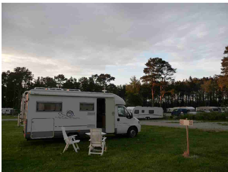
This is at Vølstadskogen Camping in Sandnes.