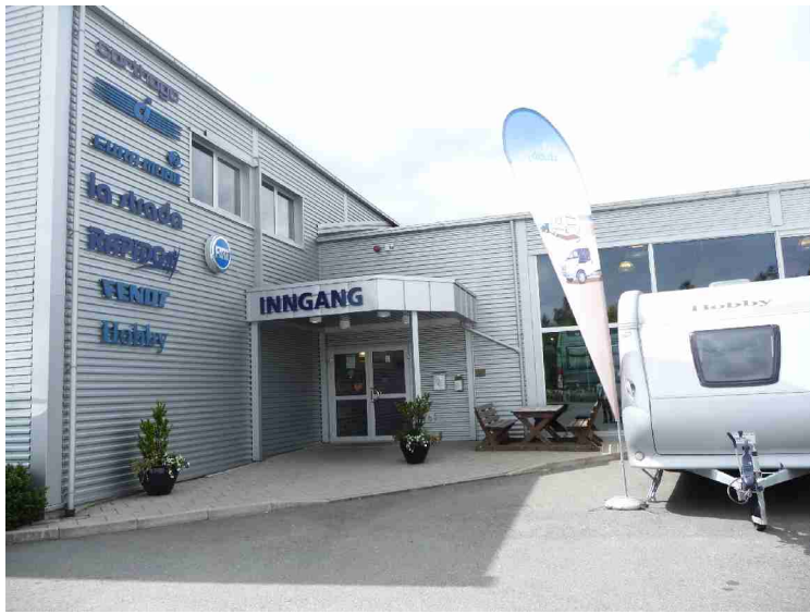
The entrance to the offices.