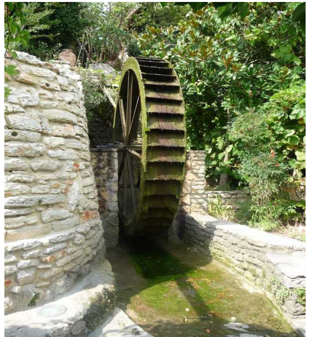
A water wheel for the mill that once stood here before the summer house was built.