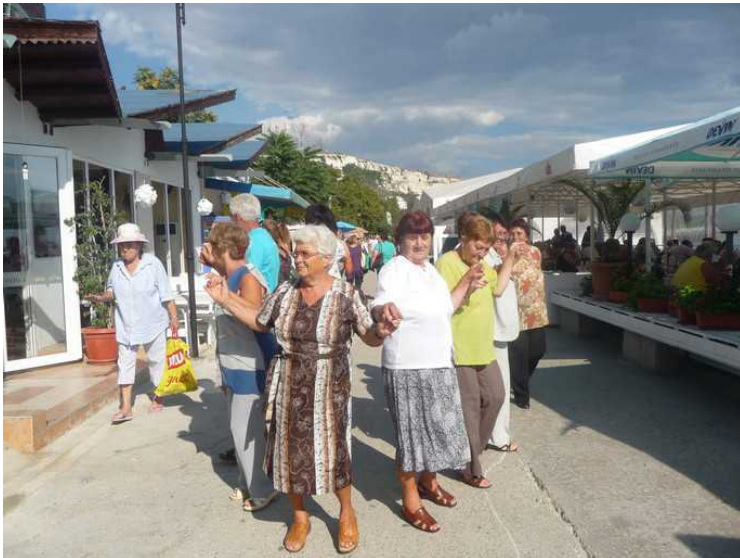
Good wine and good food.