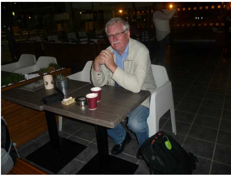
We had some coffee while we waited. The airport had opened a new departure terminal a few days before. It was pretty good with plenty of space.