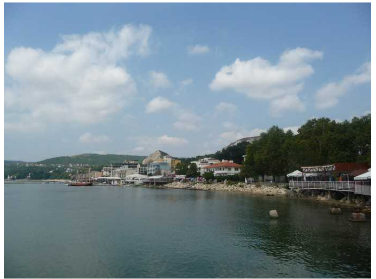
Here we have walked towards the city center and look back towards the hotel where we were staying.