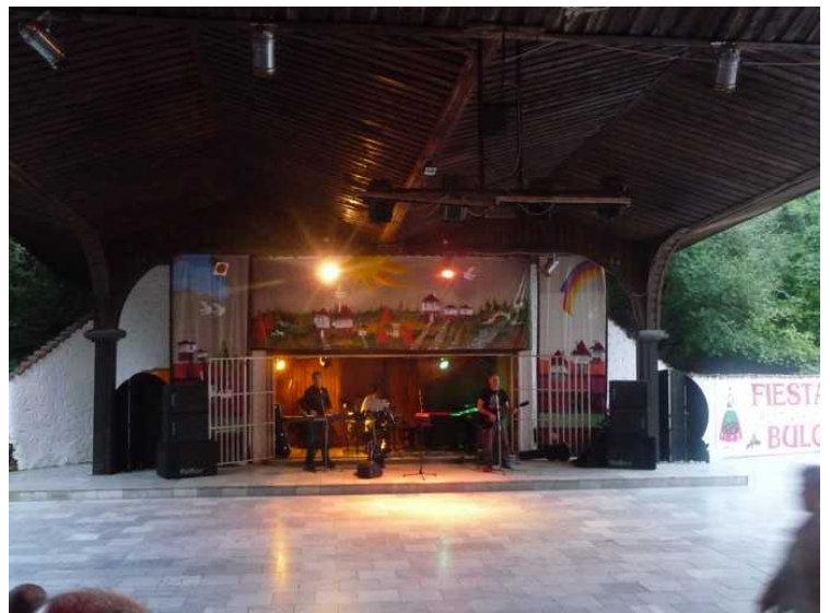
This is the stage where the performance will take place.