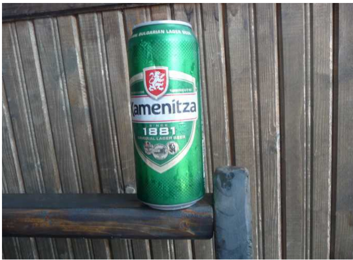
It was hot to walk in the sun, so when we finished and went back out the same way we came in, I had to have a cold beer. The local beer is called Kamenitza. Afterwards we took a taxi back to town.