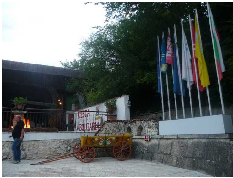
Flags from many nationalities.