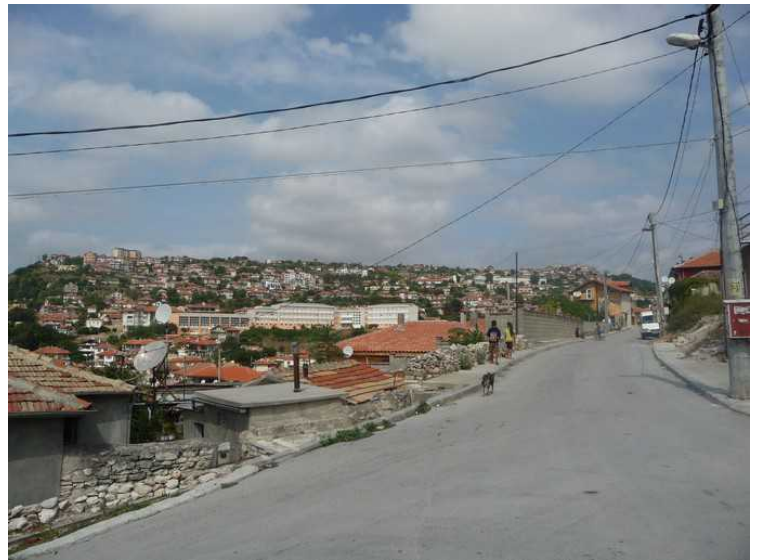
On the way down again.