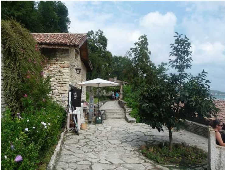
It is walled and landscaped stone paths set up the slope.