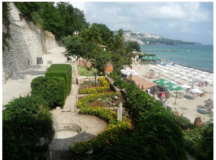
It's nice planted here too. The beach below.