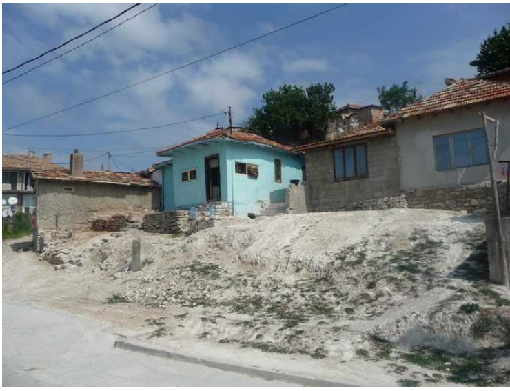
This is almost back to the center.