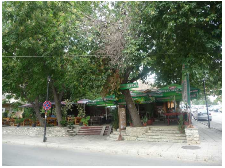
Here we arrived at the local restaurant.