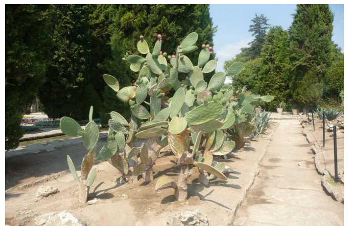
It has the second largest cactus collection in Europe. Only the collection in Monaco is bigger.