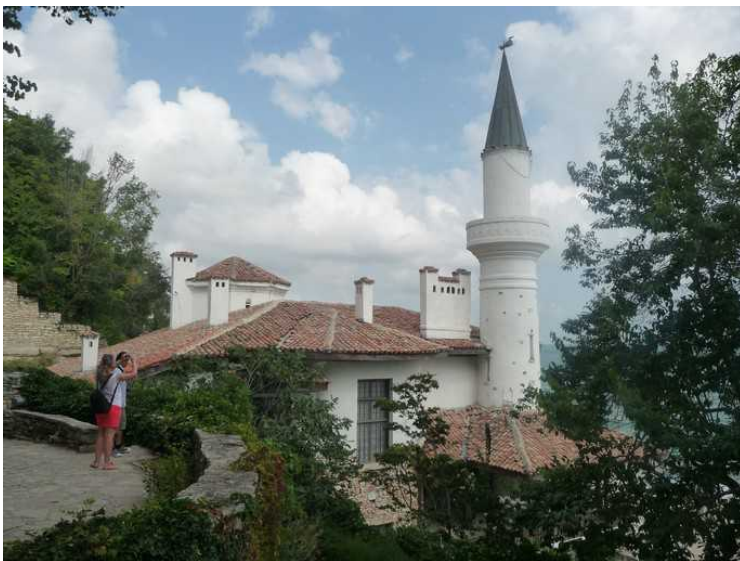
The summer House seen from the back.