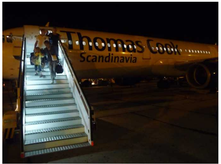
Then we could board the plane.