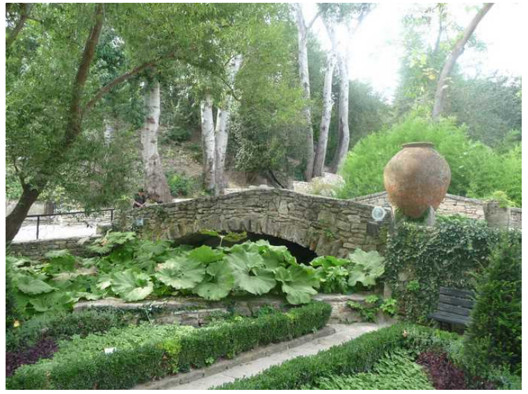
The summer house and the botanical gardens belong together, and after we had looked at the summer house, we went up to the Botanical Gardens where we had been before. The botanical garden was begun in 1940.