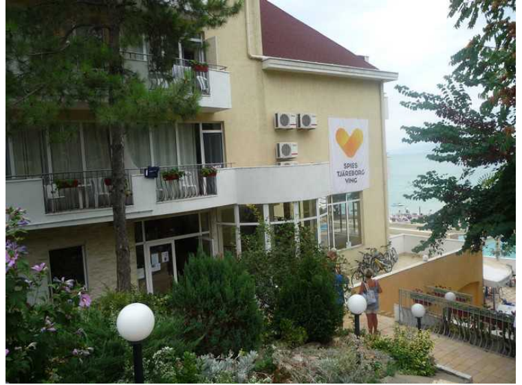
The hotel is called Helios, and lies just above the beach. We liked our hotel better.