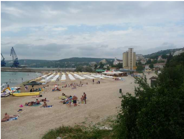
The beach that lies just below.