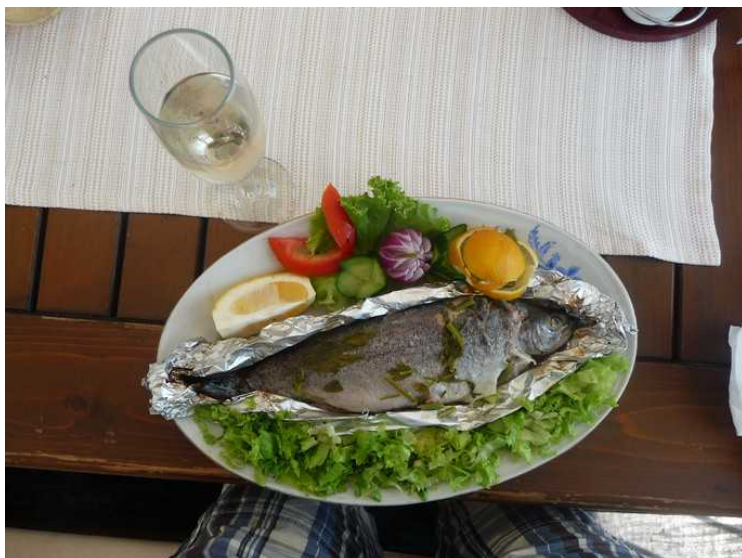
I also tried the fish, and it was actually pretty good.