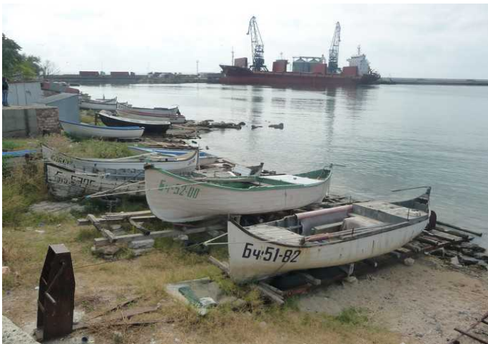
There are plenty of fish here, and these boats were in use every day. In the background the port crane that was working most of the day to unload and load boats.