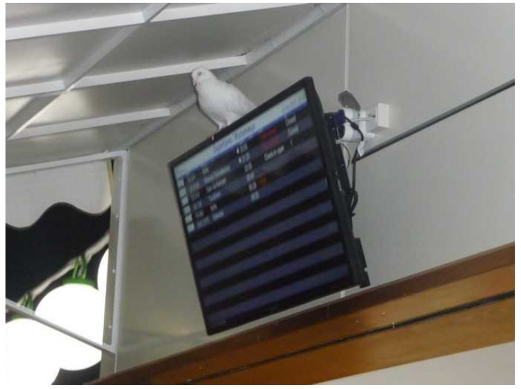
On the way back to Norway again. A pigeon sits on a display in the cafe at the airport.