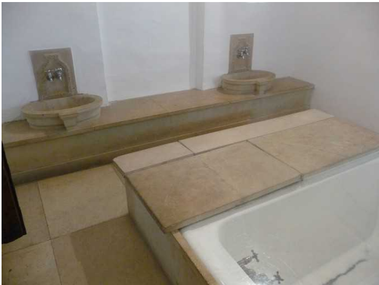
This is inside the summer house, in the bath room.