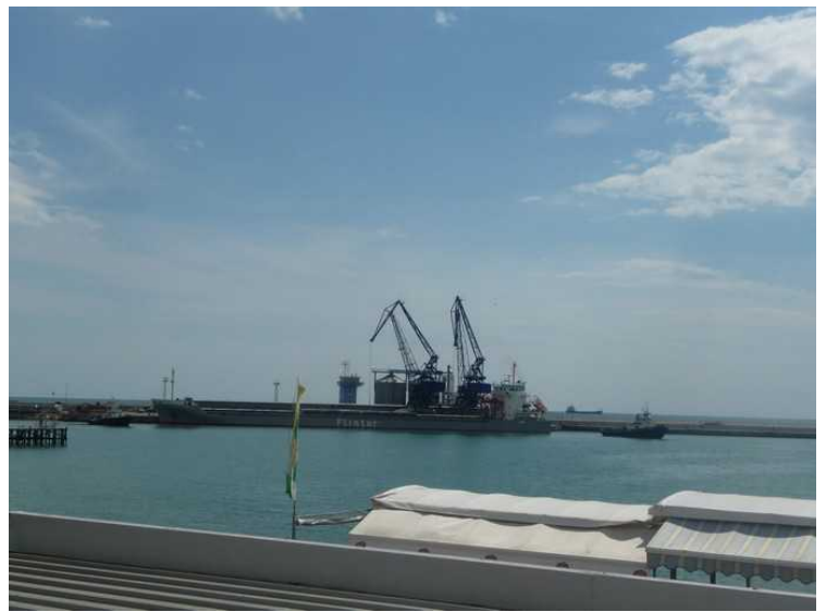
Back at the hotel, we can confirm that the port cranes still are working to unload the ship at the dockside.