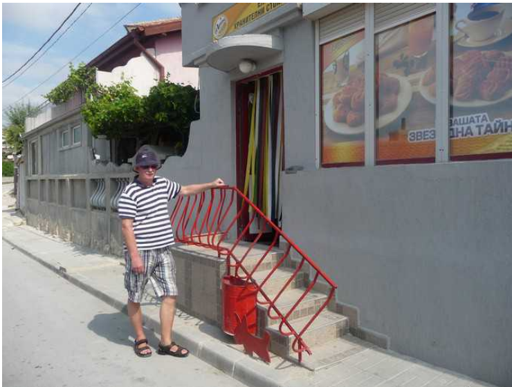
Here we come to the local bread and cake outlet.