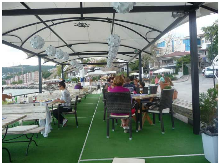
Further inside the restaurant pavilion.