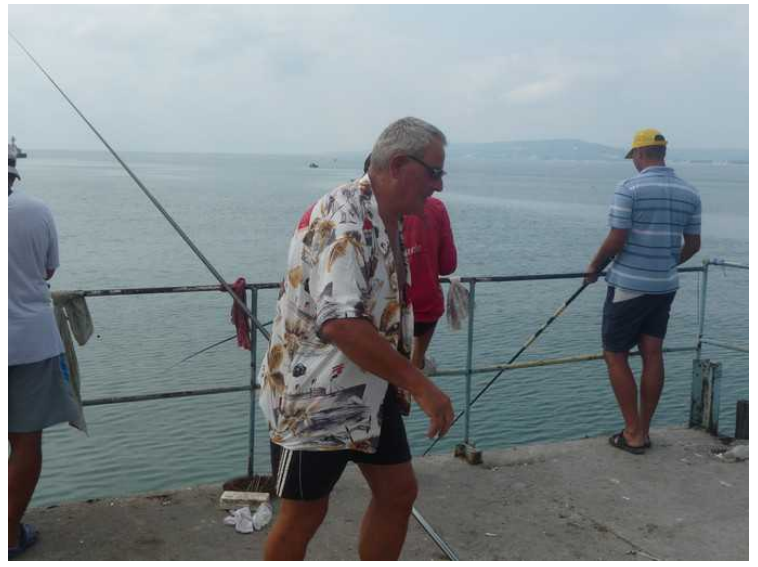
Located at the pier are many people out fishing. They are here every day and they also get a good number of fish.