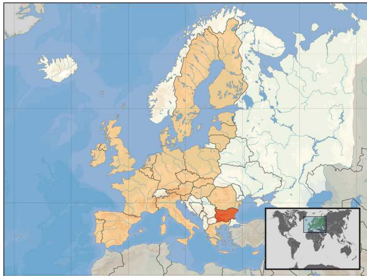
Map showing where Bulgaria is.