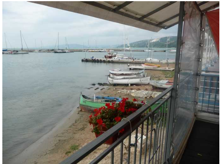
The view from the restaurant at the hotel.