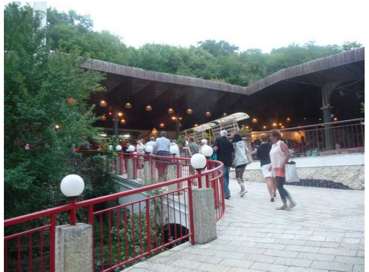
One evening we joined a Bulgarian evening. Here we are entering the gate.