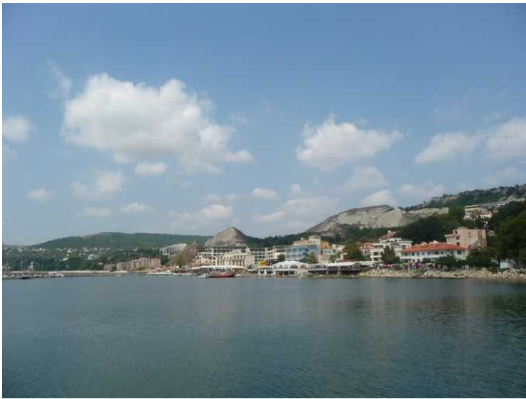
View from the edge of the pier and back to the hotel.