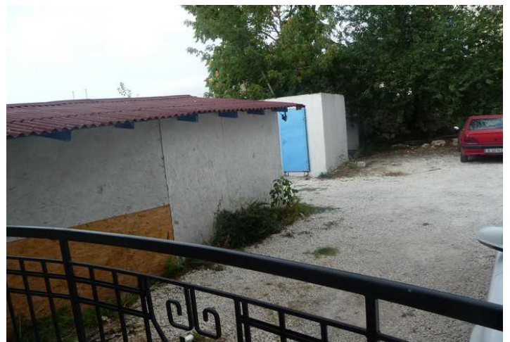
Outside the room at the hotel it looked like this.