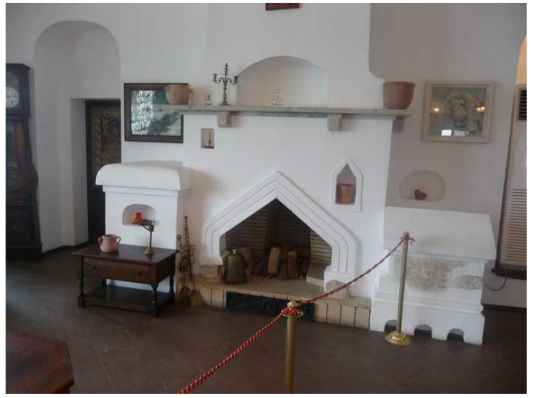
The fireplace living room.