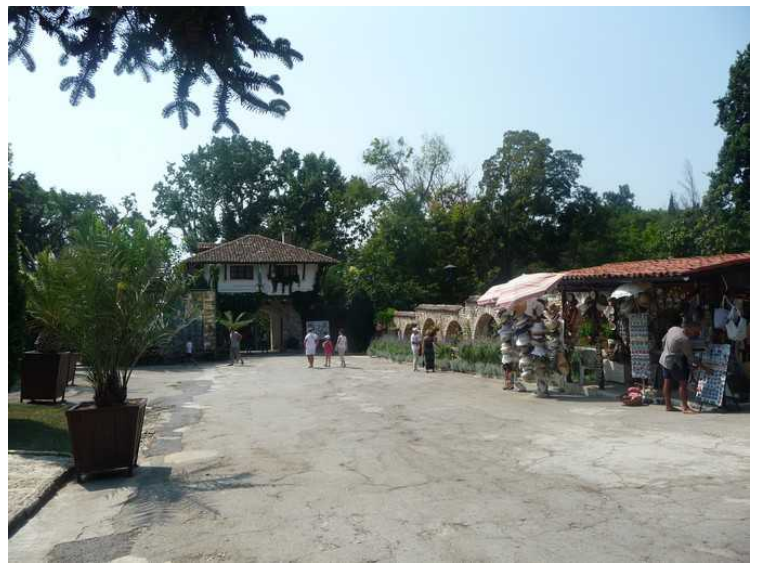
At the upper entrance to the garden is a long shopping street.