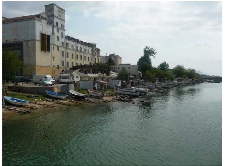
Here is a big industrial building.