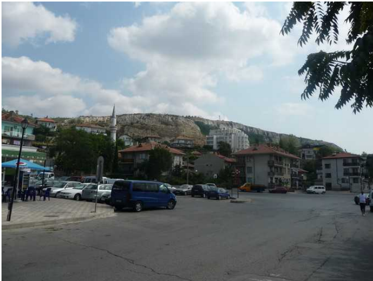
This is in the center of Balchik.