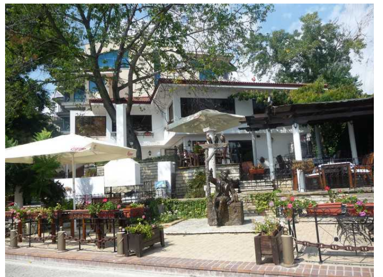
Another day we walked along the seafront and along the beach. There are some nice houses here.