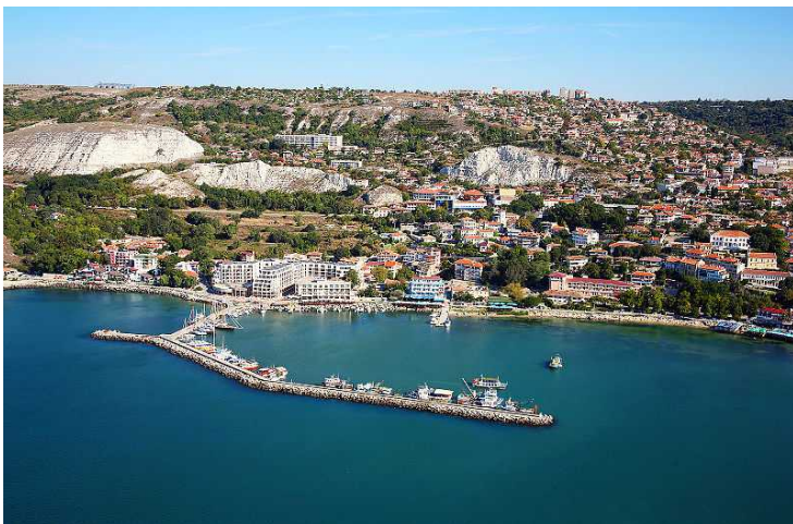
Aerial view of Balchik.