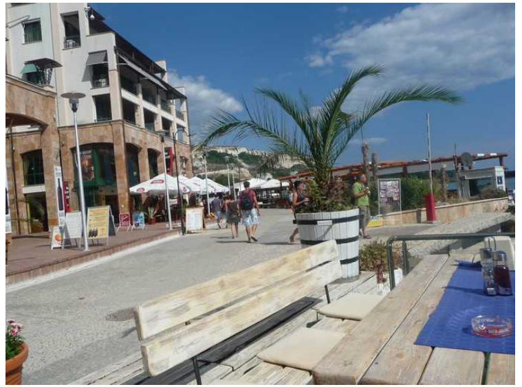
View along the promenade.