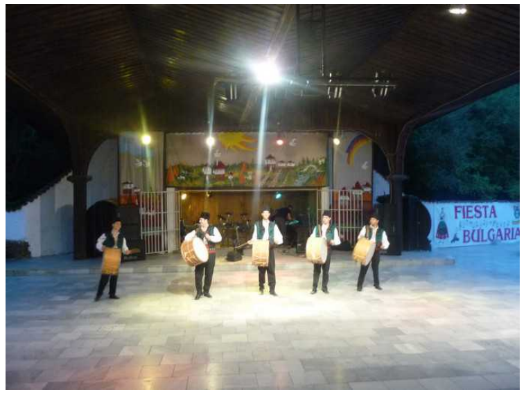
The show has started.