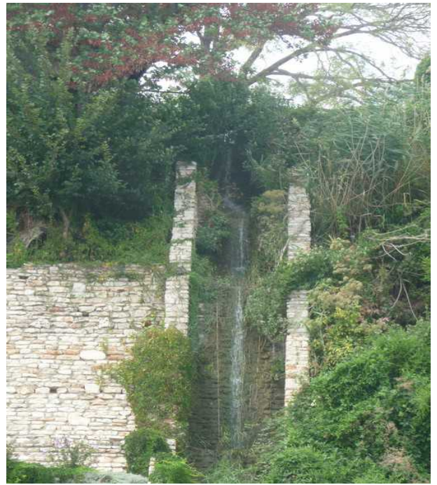
This is a small waterfall coming from the creek that flows through the botanical gardens.