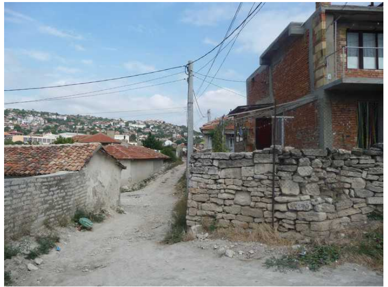
Living conditions up here was fairly simple, but there was no shortage of satellite dishes,