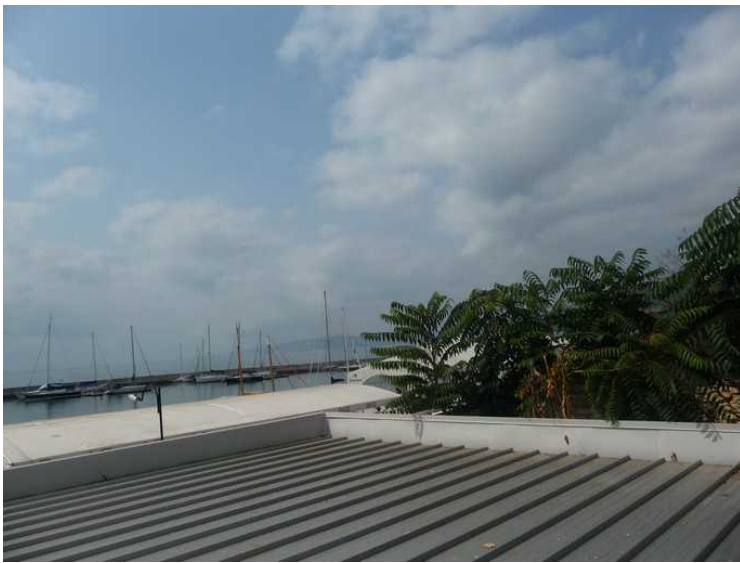
We thought this was so sad that we complained to both the hotel and Ving. The result was that we could move to another room where we were given a sea view. The hotelier and Ving were very nice and were able to arrange it in a straightforward manner.