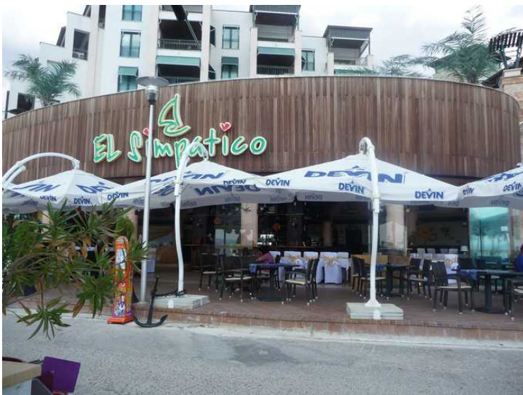
We had to try the food at other restaurants too. Here we are at El Simpatico, farther along the seafont.