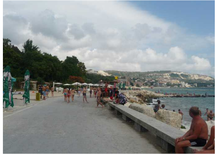
There were a lot of people on the small beach.