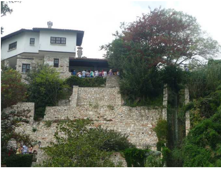
Another nice house.