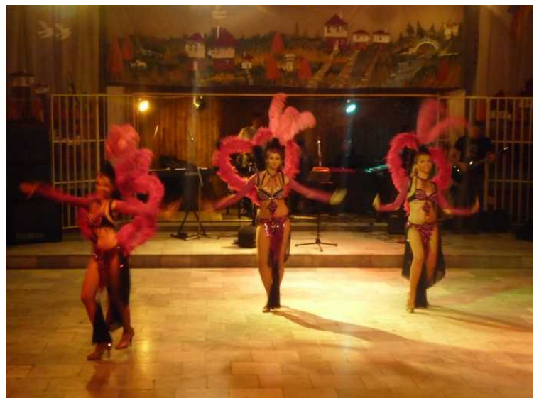
The performance consisted of Bulgarian music and dance at first, then it became a magician show and after that a more cancan-inspired music and dance. Finally, it was disco music there all who wanted could dance. It was not exactly what we had been expecting on a Bulgarian evening.