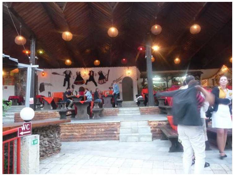
There are tables and benches along one wall.