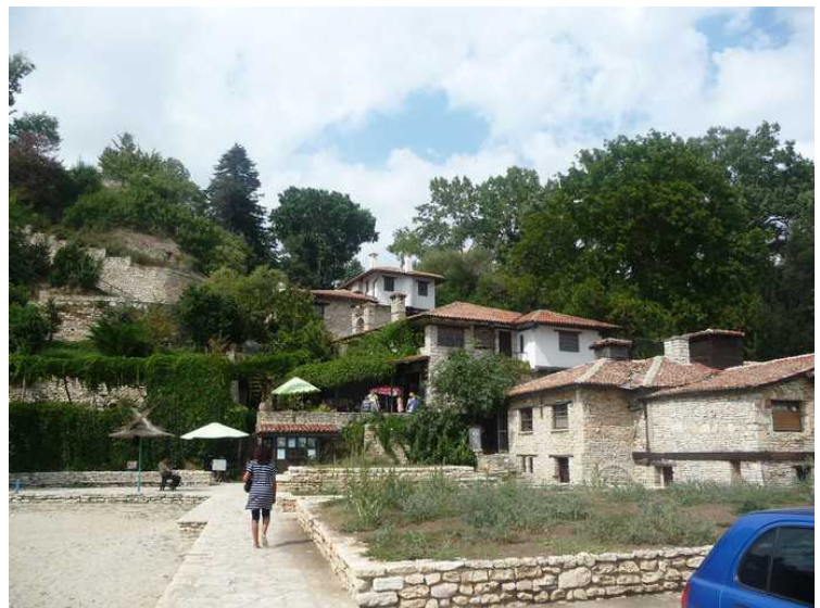
The entrance to the summer house. There is also a small restaurant here.