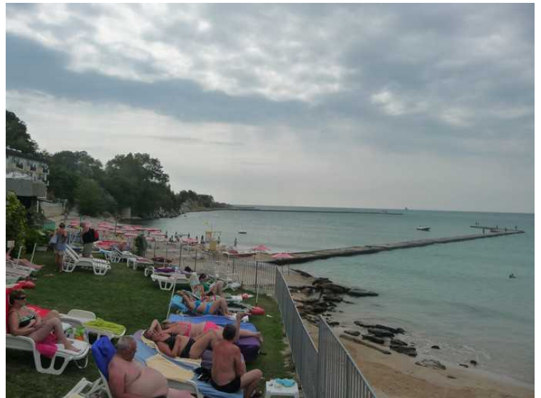
Looking the other way, it looks like this.