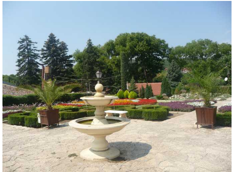
One day we took a taxi up to the botanical gardens. It was nice landscaped with lots of different plants. Below are some pictures from there.