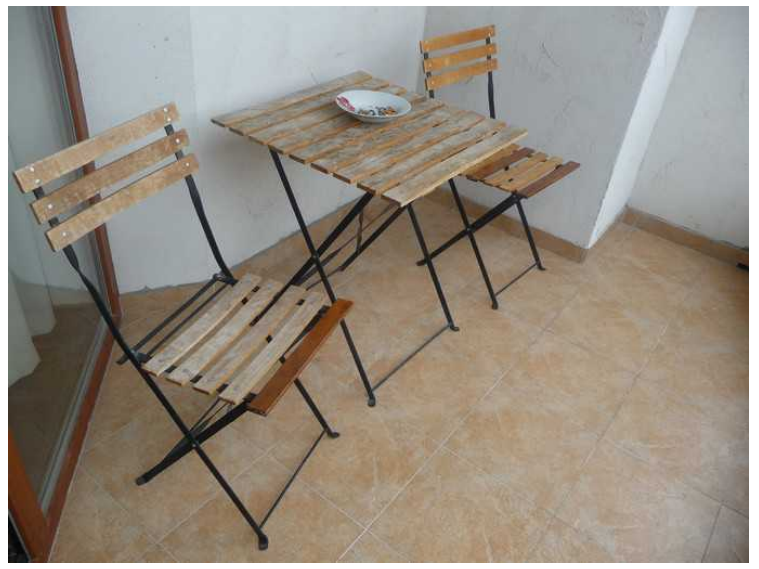
The terrace furnishings were not anything to brag about.