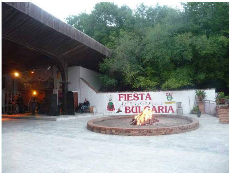
Next to the stage is lit a fire.