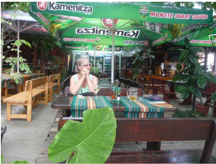
We were hot and sweaty after going on the slopes, so it did well with something cold to drink under the trees at the restaurant.