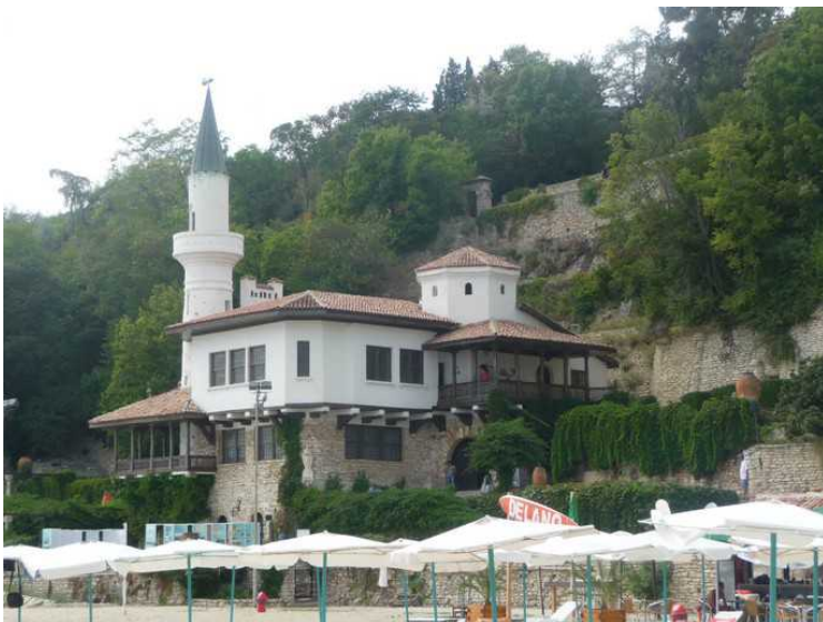
This is Queen Maria of Romania's summer house. It was built in the period 1926-1937.