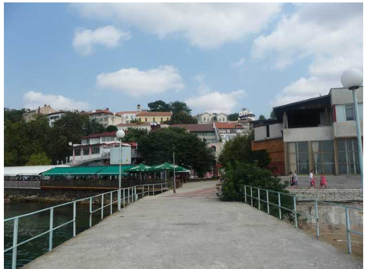
Here we are out on the pier and looking inward.