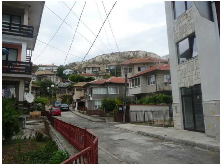
One of the side streets off the city. Limestone cliffs in the background.