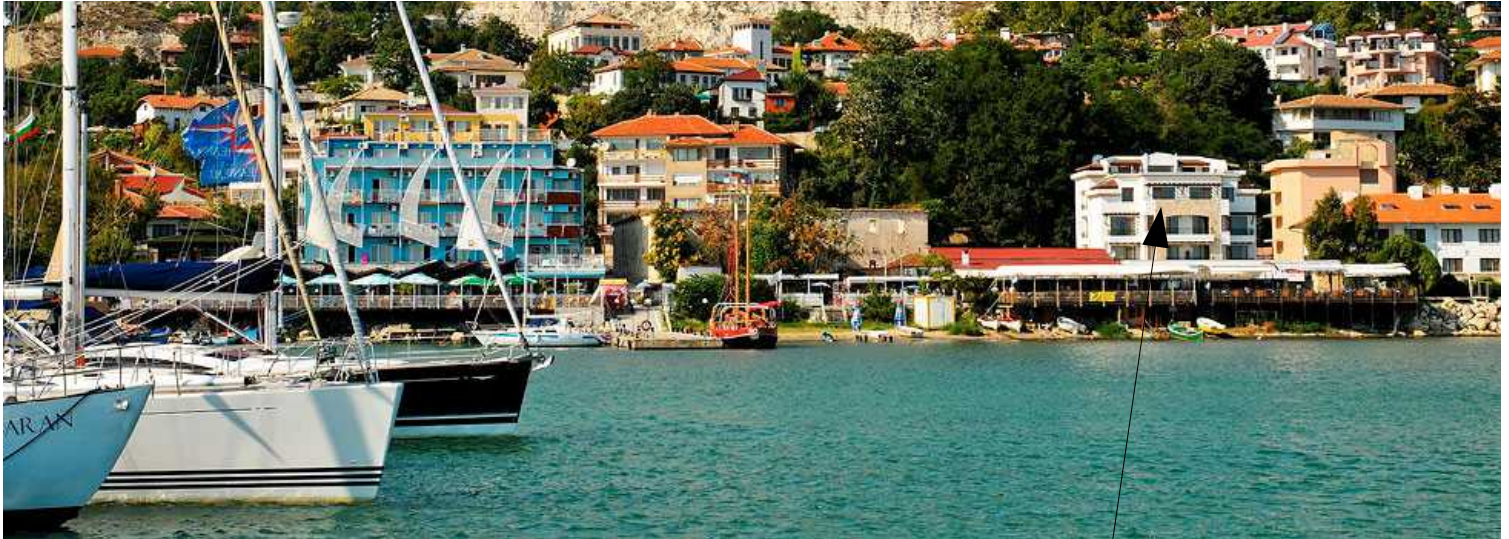
Photo from the beach promenade. Hotel Selena is here.

The city was the capital for a short period in the 14th century.