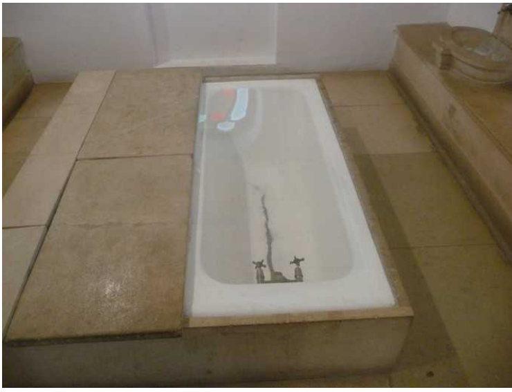
The bath tub.