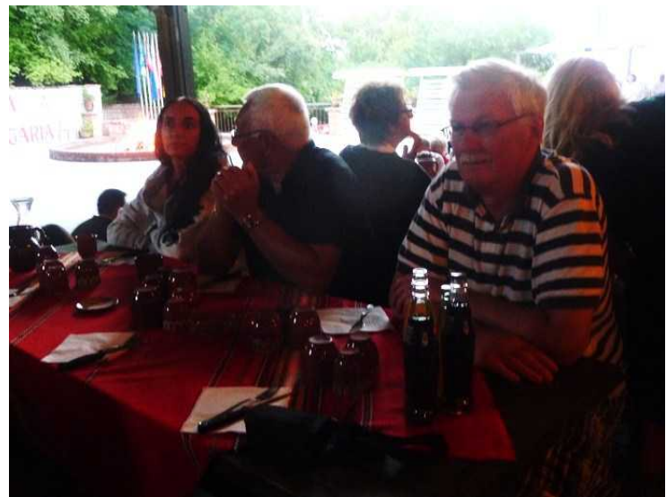
Here we found a table. There were two couples who had already sat down at the table.