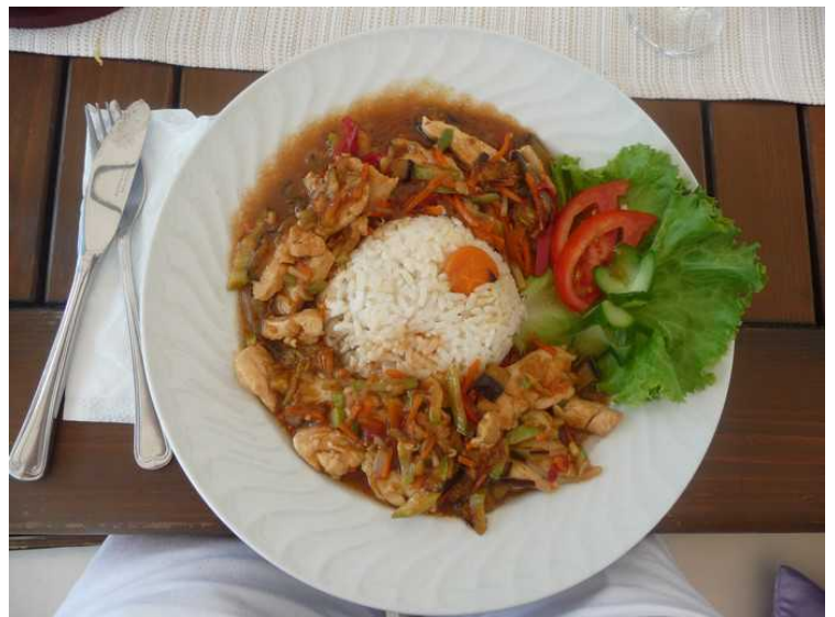
There is a restaurant in the hotel where we stayed and we often ate there, they had great food. This is one of the dishes that Anne Berit had.