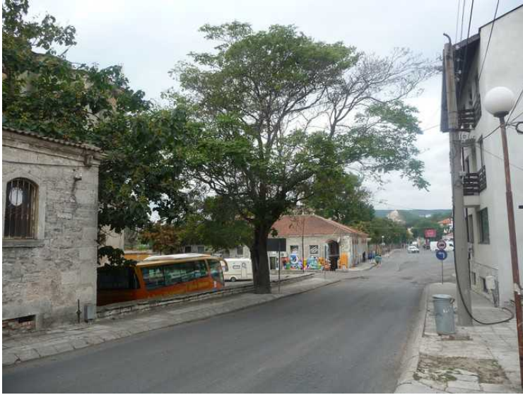
We are heading towards one of the other hotels that Ving use in Balchik. Here we look back towards the center.