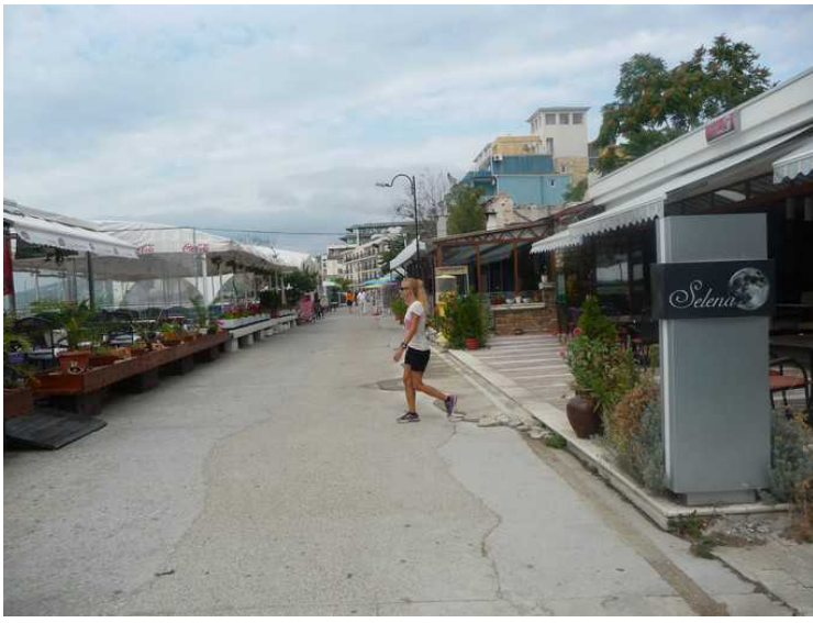
This is how it looks like on the seafront. Our hotel is on the right.