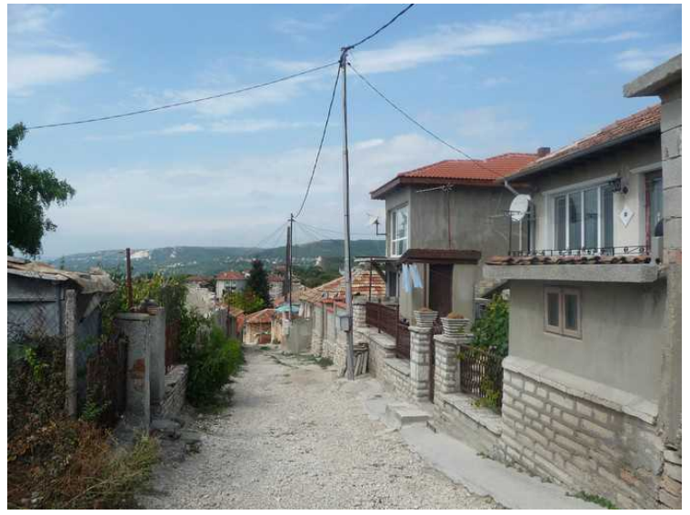
Here we are quite high up.