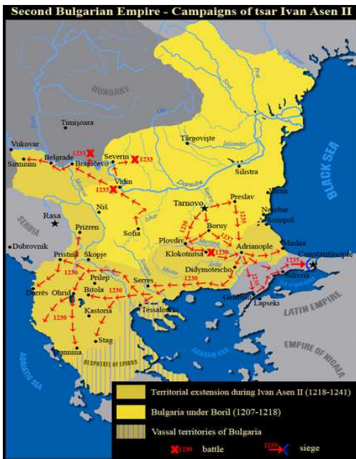
Bulgaria during its greatest extent.