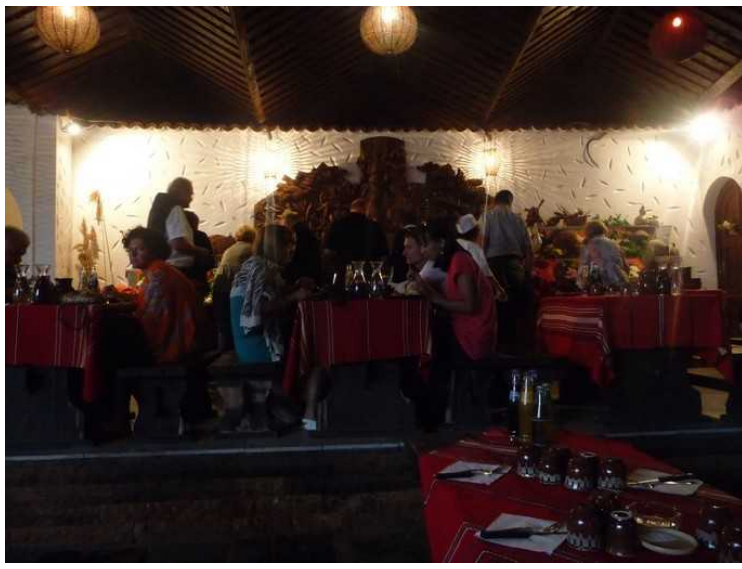
There is service self of appetizers and wine.