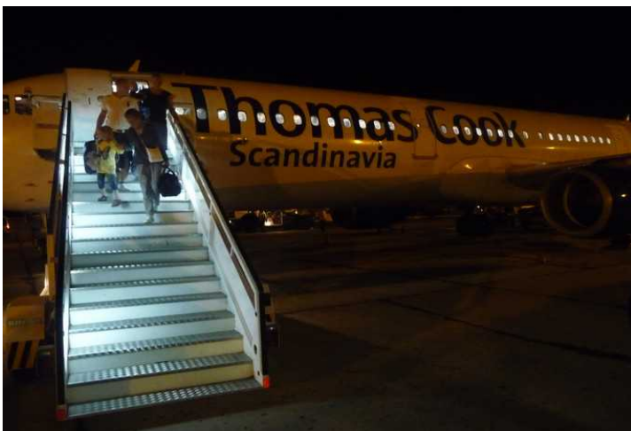
Here we exited the plane.