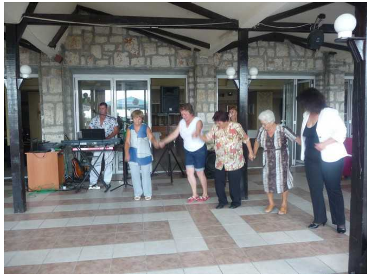
They were very eager.