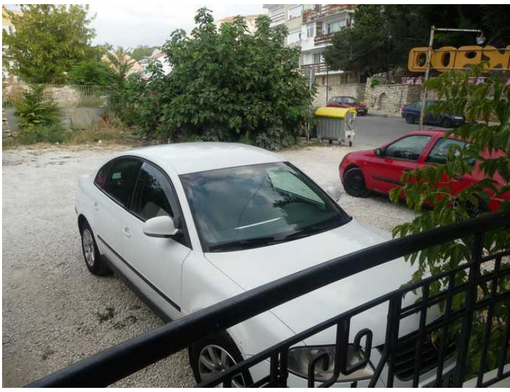
There is parking lot outside and the main street.