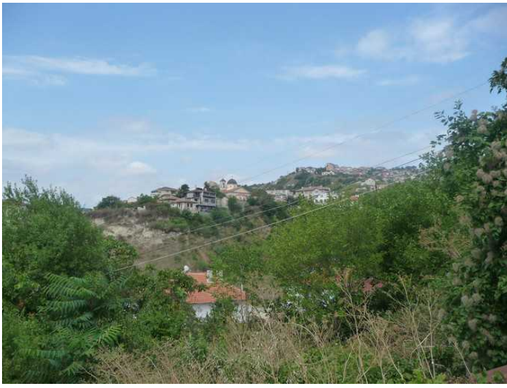
Another day we went up the hill above the city. There were a lot of houses up here.