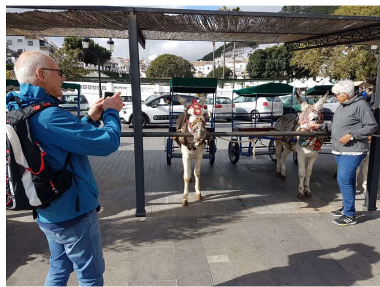
At first we had a look at the donkeys. We could be driven with donkey cart or ride on the donkey's back.