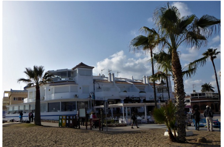
One of the restaurants by the beach. To the left is the start of a promenade that goes all the way to Calahonda.