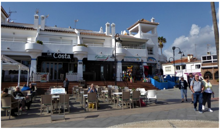
This is a restaurant right next to the tower.

It was built in 1773 to protect against pirate attacks from the sea, and several guns were installed. There were a whole series of lookout towers along the coast, and at the risk of attack, they could signal to each other by mirrors during the day and by fire during night-time.