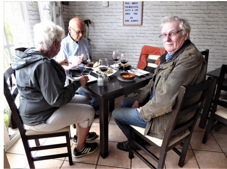
I was very pleased.