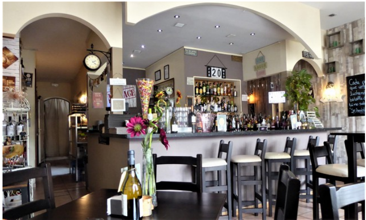
After that we went back to have some lunch. We went in on KonFusion Tapas & Cocktail Bar.