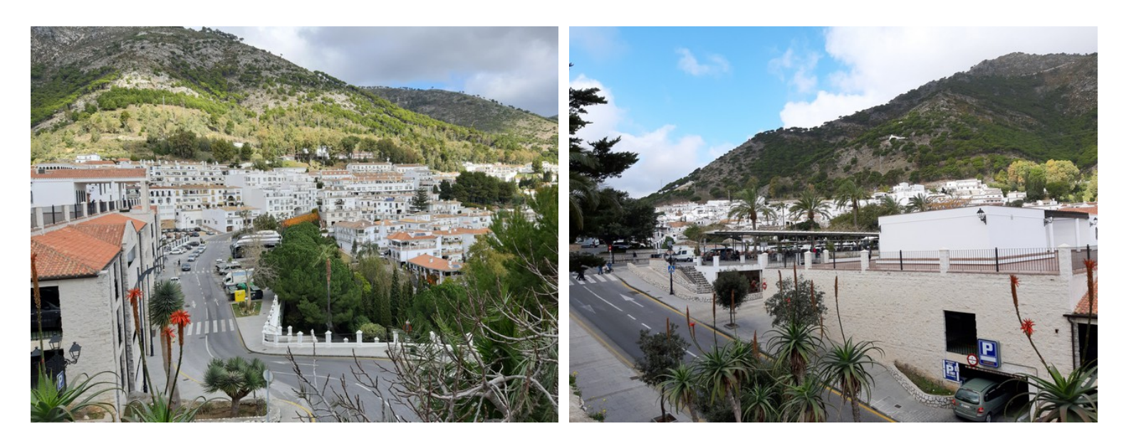
View from the plateau outside the chapel.