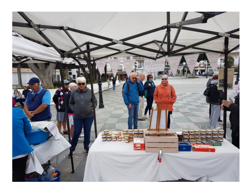
Here is sold honey and jam.