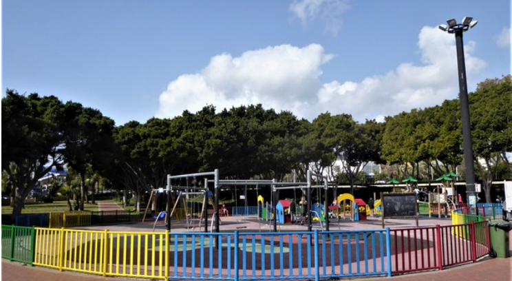
We walked until we got to a small park where there was also a small playground for kids. There was a small restaurant and some tables here, so we sat for a while and took a beer etc.