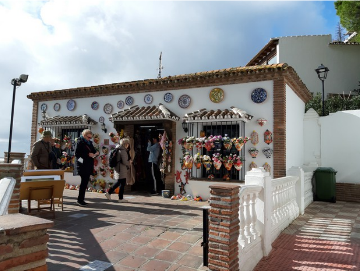
Souvenirs are sold here.