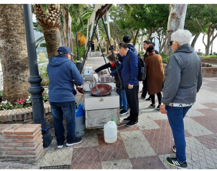
Roasted chestnuts are sold here.