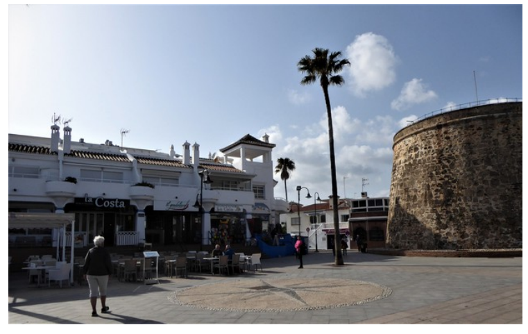
Finally we took a taxi back to La Joya.