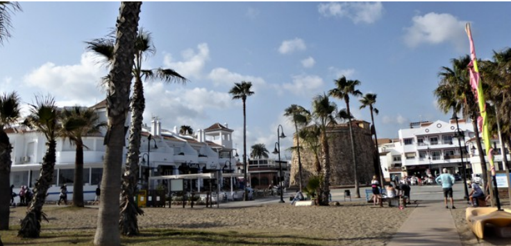
More pictures taken at the beach of La Cala.