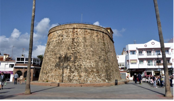
On February 20 we took a taxi to <u>La Cala de Mijas</u>. This is a watchtower, <u>Torre de la Bateria o Torreon de la</u> <u>Cala de Mijas</u>.

arrived, so we took it to Fuengirola and taxi from there.