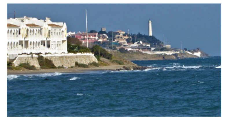
We see the lighthouse in El Faro in the background.