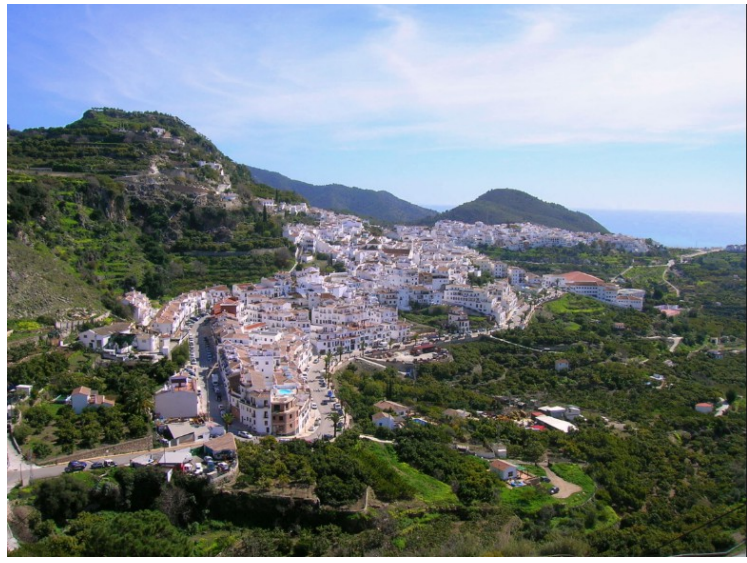
An aerial view of the city.

On Wednesday, February 13, we took a taxi from La Joya up to Mijas Pueblo. <u>Wikipedia.org</u> <u>Andalucia.com</u> <u>Malagaweb.com</u>