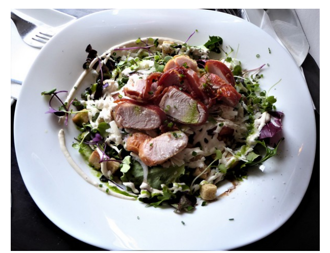
We all had different dishes and everyone thought it was good.