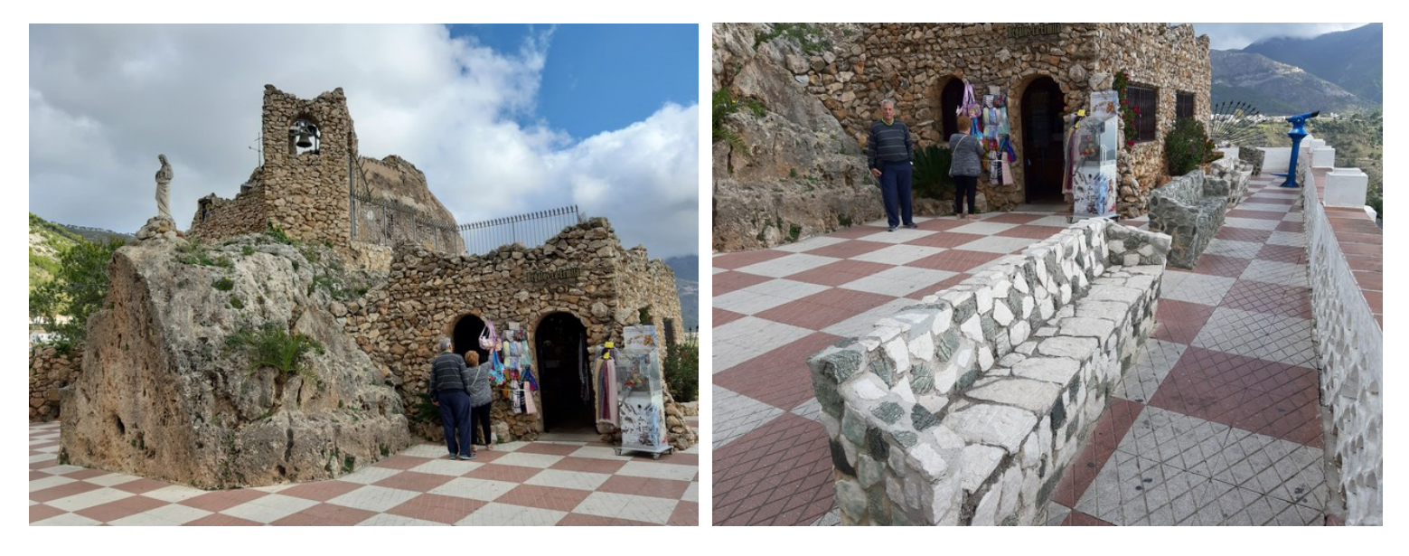
The back of the chapel.