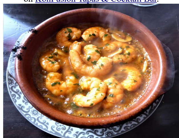
I had shrimps in a spicy sauce. Very good.