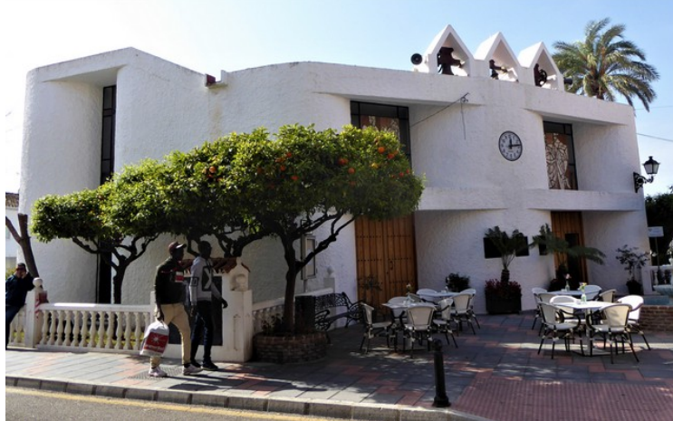
Some street pictures from the town.