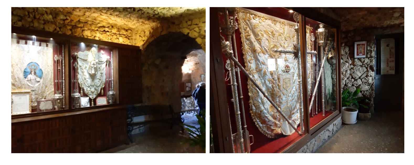
Some pictures from inside the church.

The chapel is called <u>Ermita de la Virgen de la Peña</u>. Virgen de la Peña (Virgin of the stone) is the patron saint of Mijas and the chapel is built in honor of her. According to legend, the statue has been hidden for 500 years and was recovered by a mason in 1587. His sons were herdboys and they were led there by a dove.