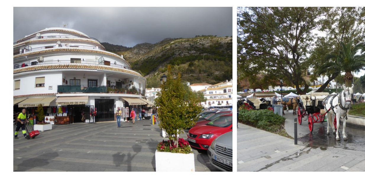
Here we are out on the plaza again.

This is before we got the food we had ordered and everyone looks happy. I remember getting OK food, and it wasn't expensive, so I expect we were just as happy after we had eaten.