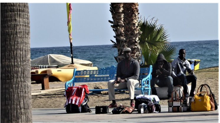
After that we went back to the beach. <u>This beach</u> has got a blue flag.