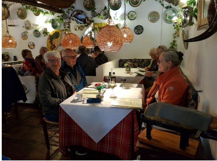
We had to have lunch so we went into this restaurant, <u>Los</u> <u>Arcos</u>.