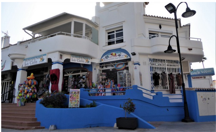
Another street photo.

Finally we had dessert. The others had ice cream while I had an advanced <u>creme catalana</u>. Everyone had sherry.