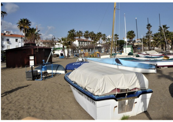
There is no marina here, so the boats are pulled up on the beach.