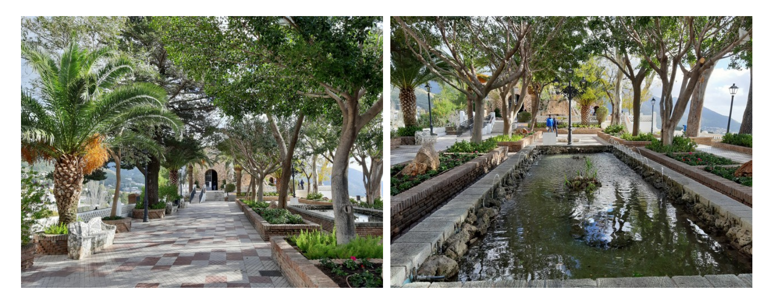
A chapel is located on the edge of this plateau.