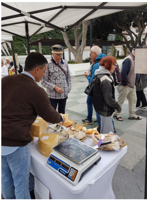
Down in the square, cheese is sold.