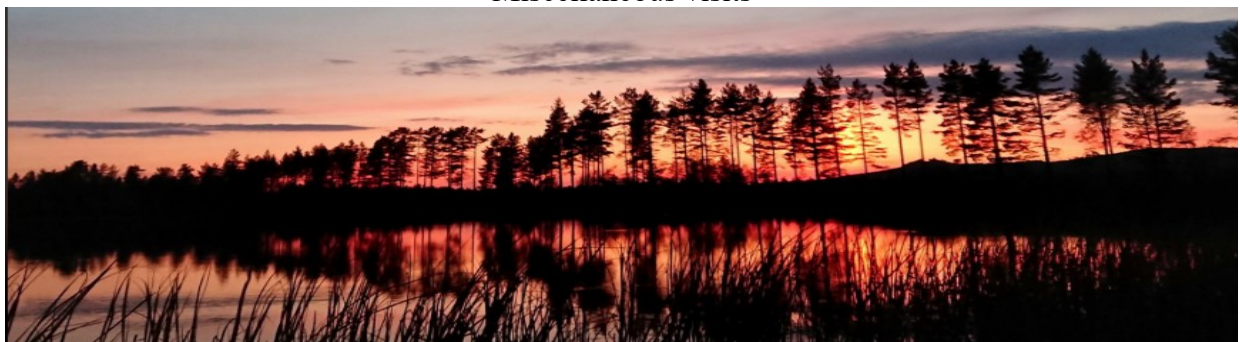
The Finn forest