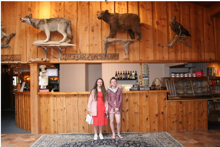
At Villmarksenteret in Skasenden.