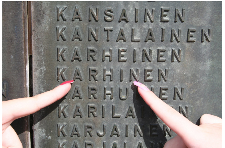
Descending from Karhinen i Finland.