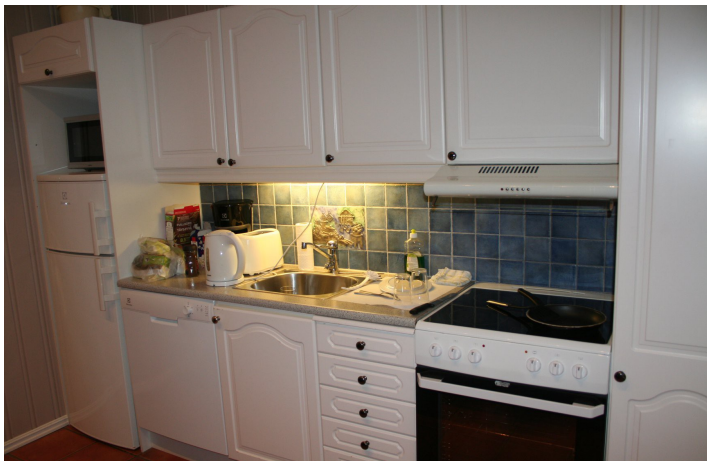
The kitchen in the cabin.