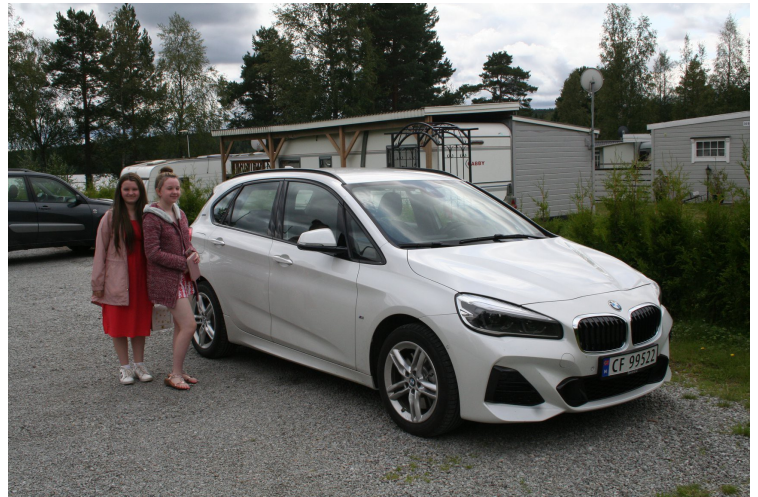
The rental car