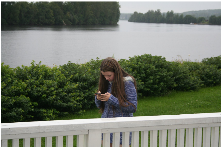
Outside the terrace at the cabin.