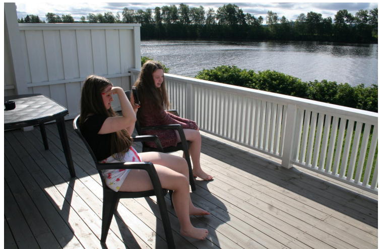
On the terrace. View across Glomma.