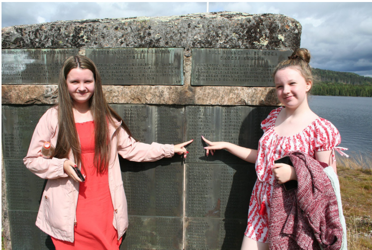
This monument is just inside the border.