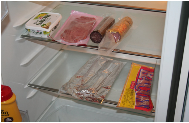
They arrived late in the evening, so we had therefore prepared some food provisions.