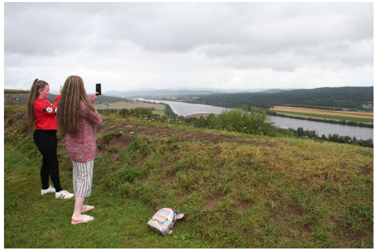
At Kongsvinger Fortress.