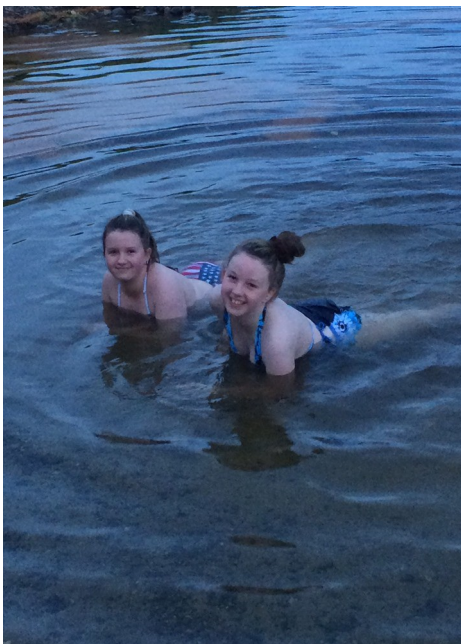
Bathing in Glomma